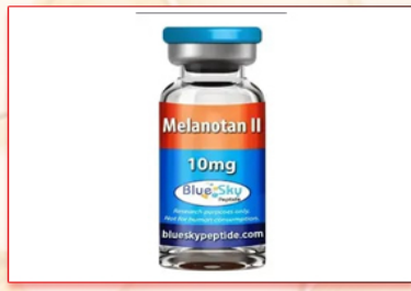
Melanotan II 10MG