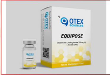
Otex sciences EQUIPOSE