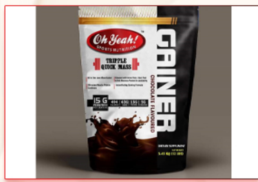
TRIPPLE QUICK MASS 15G