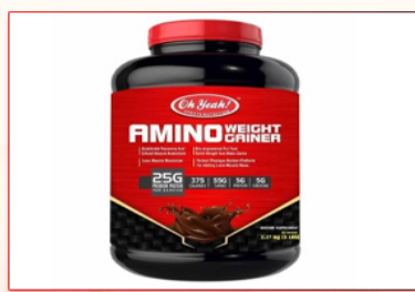
AMINO weight gainer