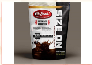
ULTIMATE STRENGTH 25G