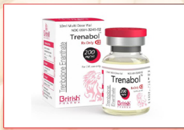
Trenabol Rx only 200 mg