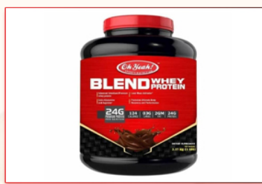
BLEND whey protein