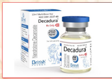
Decadur Rx only 250mg