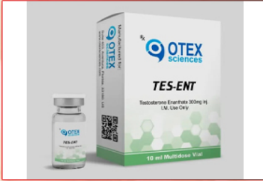
Otex sciences TES-ENT