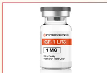
IGF-1 LR3 1MG