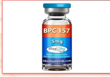
BPC 157 5MG