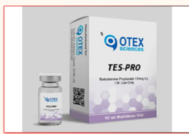
OTEX sciences TES-PRO