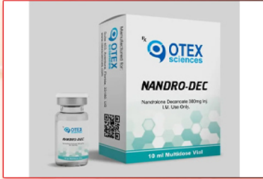
Otex sciences NANDRO-DEC