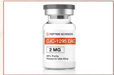
CJC-1295 DAC 2MG