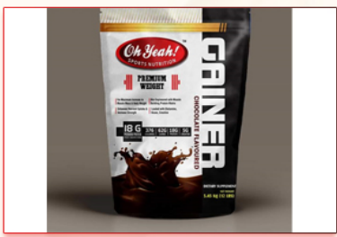
PREMIUM WEIGHT 18G