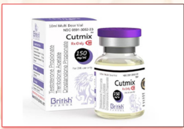
Cutmix Rx only 150mg