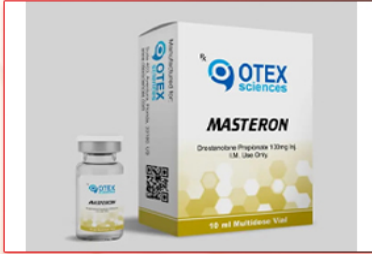
Otex sciences MASTERON