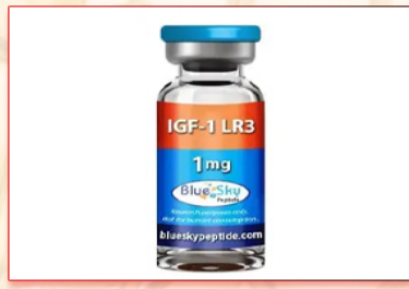
IGF-1 LR3 1 MG