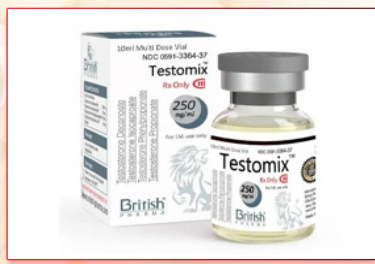
Testomix Rx only 250 mg