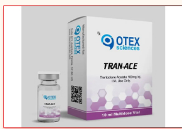
OTEX sciences TRAN-ACE