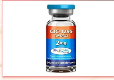
BPC 157 2MG