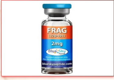
FRAG (176-191) 2mg