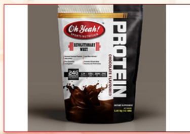
REVOLUTIONARY WHEY 24G