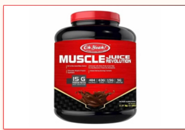
MUSCLE juice revolution