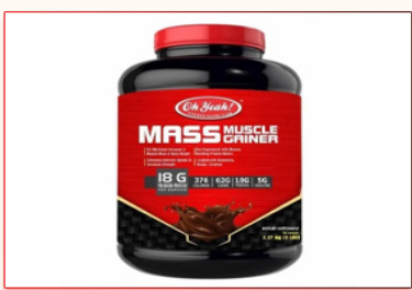
MASS muscle gainer