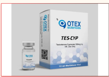
OTEX sciences TES-CYP