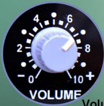
Volume & Frequency Controllers