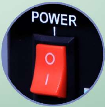
Power On/Off Switch

STRONG WAVE Ultrasound Rat Repellent Device : F1-EI86HC