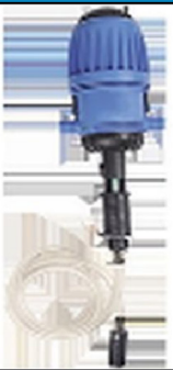
Drip Irrigation Dosing Pump