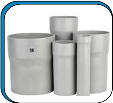
Drip Irrigation Upvc Pipe