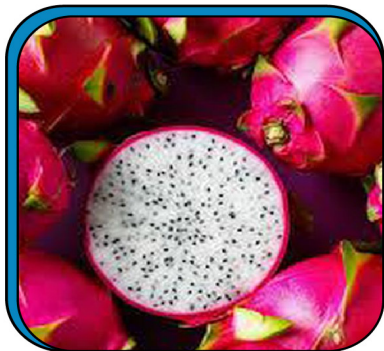
Fresh Dragon Fruit