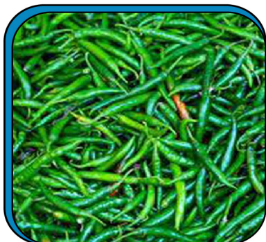
Fresh Green Chilly