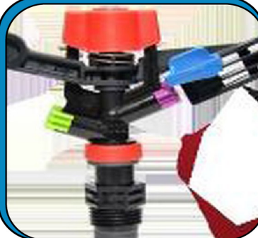
Drip Irrigation Sprinkler