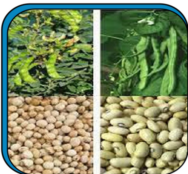
Pigeon Pea Seeds