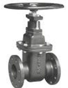
Drip Irrigation Sluice Valve