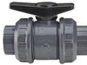
Drip Irrigation Control Valve