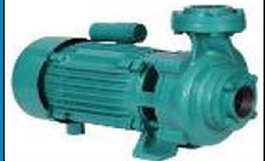
Drip Irrigation Monoblock Pump