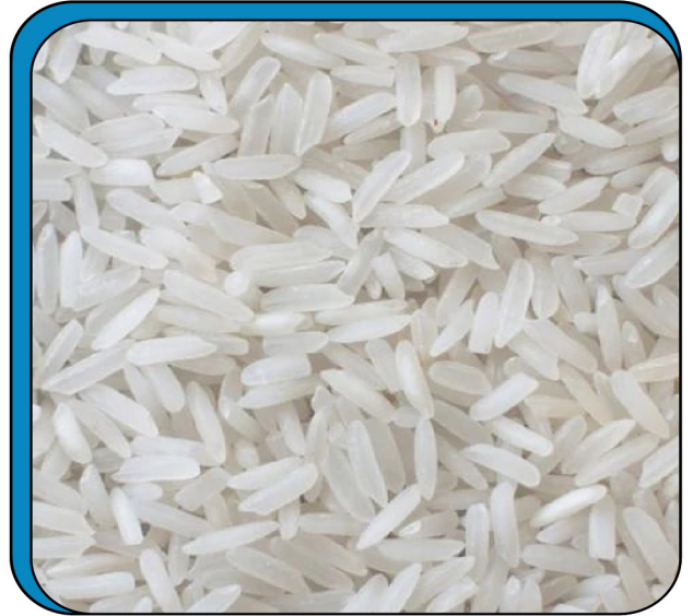
Non Basmati Rice