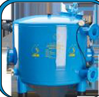
Drip Irrigation Sand Filters