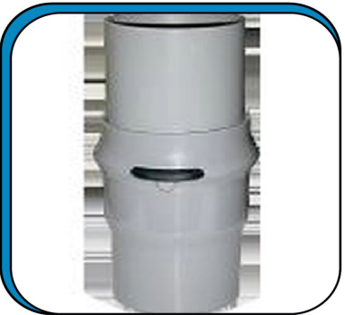
PVC Quick-Fix Rubber Ring Joint Pipes