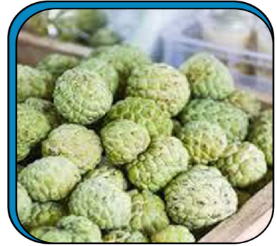
Fresh Custard Apple