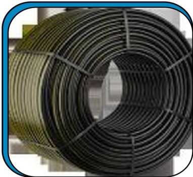
Drip Irrigation Lateral Pipe