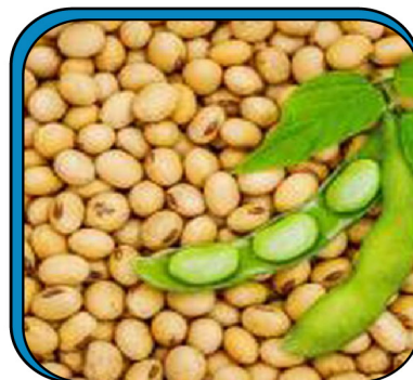
Soya Bean Seeds