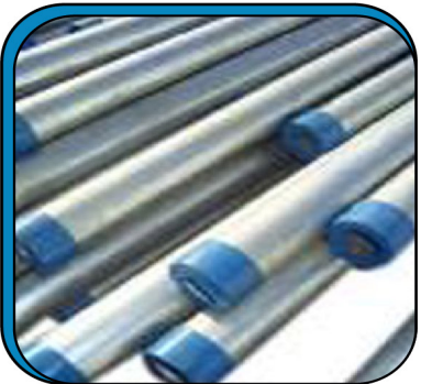
Galvanized Iron Pipes