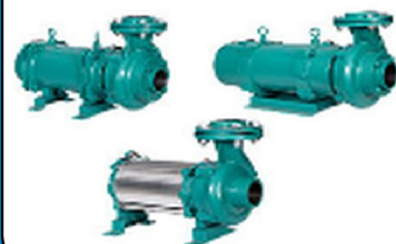
Drip Irrigation Submersible Pumps