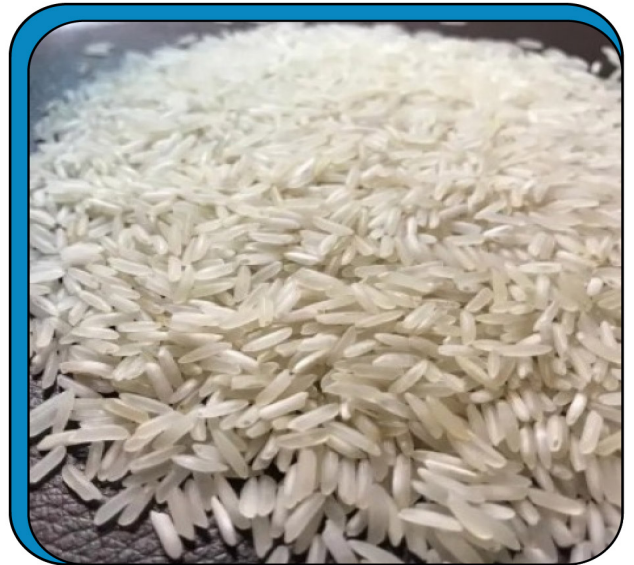
White Sella Basmati Rice