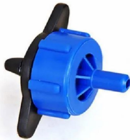
Drip Irrigation Drippers