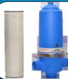
Drip Irrigation Screen Filter