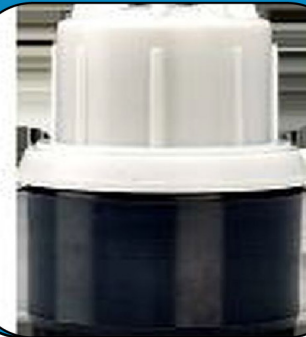
Drip Irrigation Flush Valve