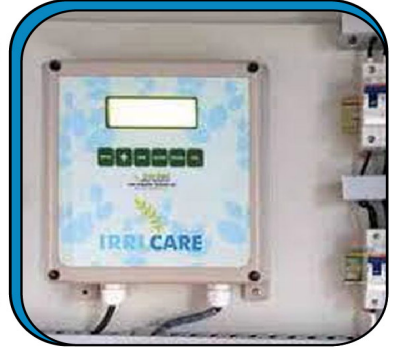
Drip Irrigation Controller