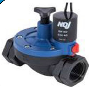
Drip Irrigation Solenoid Valve