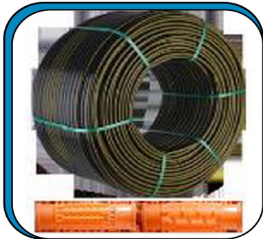
Drip Irrigation Emitting Pipe