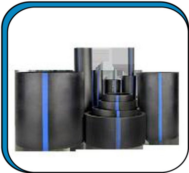
High Density Polyethylene Pipes