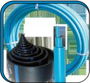
MDPE Water Supply Pipes