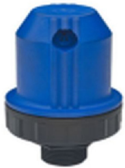
Drip Irrigation Air Valve