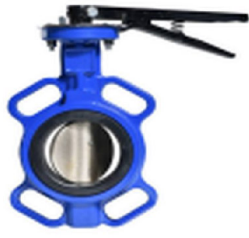
Drip Irrigation Butterfly Valve