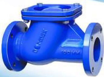
Drip Irrigation Non Return Valve