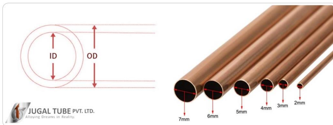
Copper Tube Dimensions Chart