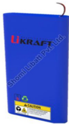
LiK2542S 24V Series Lithium Ferro Phosphate Battery