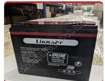
Likraft Lead Acid Battery