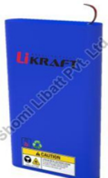
LiK25100S 24V Series Lithium Ferro Phosphate Battery