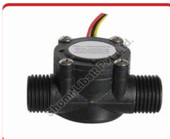
Liquid Flow Sensor