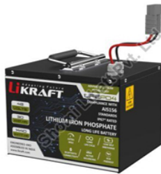
LiK4833 Lithium Ion Phosphate Battery