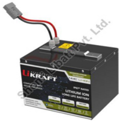
LiK4826 Lithium Ion Phosphate Battery

Adopting Future LiKRAFT Shomi Libatt Pvt. Ltd.