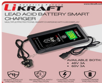
Likraft Lead Acid Battery Charger