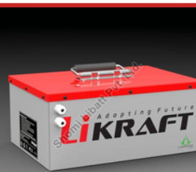
72v-40ah-NMC-18650-2550 Electric Two Wheeler Battery