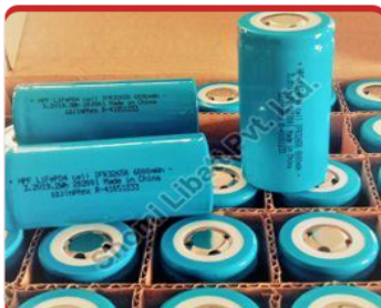
3.2V 6000 32700 3C Battery Cell