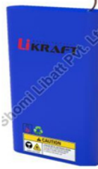
LiK12100S 12V Series Lithium Ferro Phosphate Battery