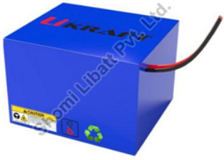
LiK2518S 24V Series Lithium Ferro Phosphate Battery

LiKRAFT Adopting Future Shomi Libatt Pvt. Ltd.