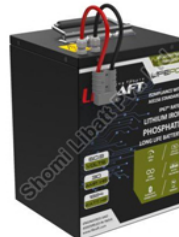
LiK6133 Lithium Ion Phosphate Battery