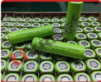
BAK 2900 3.7V Lithium Battery Cell

Adopting Future LiKRAFT Shomi Libatt Pvt. Ltd.