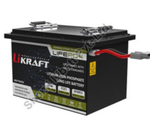
LiK51100 Lithium Ion Phosphate Battery