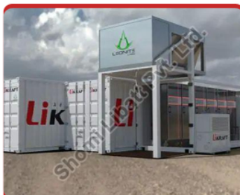
Energy Storage System Container