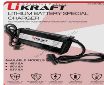
Likraft Lithium Battery Charger