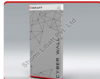
Likraft Home Energy Storage Cyberwall