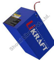
LiK2554S 24V Series Lithium Ferro Phosphate Battery