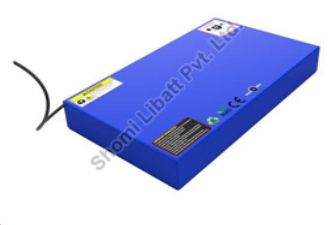
LiK2536S 24V Series Lithium Ferro Phosphate Battery