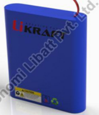
LiK1206S 12V Series Lithium Ferro Phosphate Battery