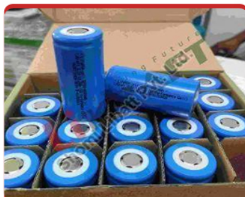
3.2V 6000mAh A- Grade EV Battery Cell