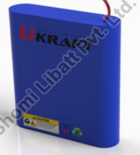
LiK1212S 12V Series Lithium Ferro Phosphate Battery