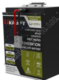
LiK7260 Lithium Ion Phosphate Battery