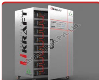
Energy Storage System Rack