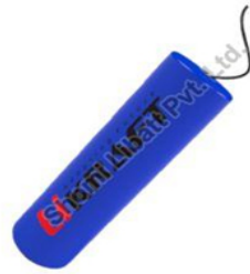
LiK2524S 24V Series Lithium Ferro Phosphate Battery