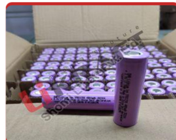
3.7V 4800 Lithium Battery Cell