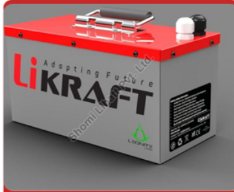
12.8V 96Ah Bed Lithium Ion Solar Battery