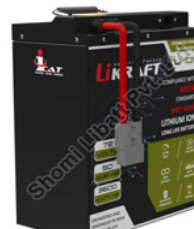
LiK7250 Lithium Ion Phosphate Battery