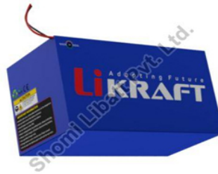
LiK2530S 24V Series Lithium Ferro Phosphate Battery