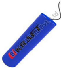
LiK1224S 12V Series Lithium Ferro Phosphate Battery