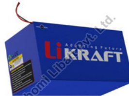
LiK1230S 12V Series Lithium Ferro Phosphate Battery