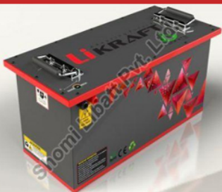
60V Electric Three Wheeler Battery