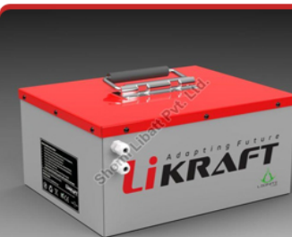
72V-35Ah-NMC-18650-2550 Electric Two Wheeler Battery