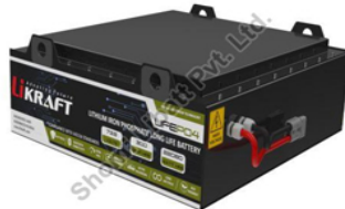
LiK72300 Lithium Ion Phosphate Battery