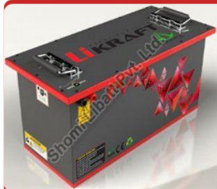
72V Electric Three Wheeler Battery