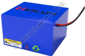
LiK1218S 12V Series Lithium Ferro Phosphate Battery