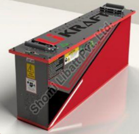
51.2V Electric Three Wheeler Battery