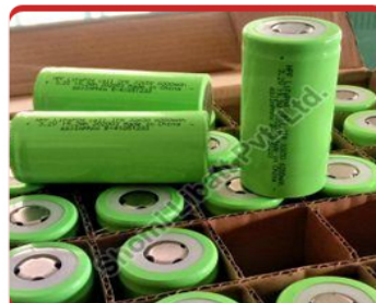
3.2V 6000 Lithium Battery Cell