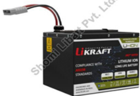
LiK6026 Lithium Ion Phosphate Battery