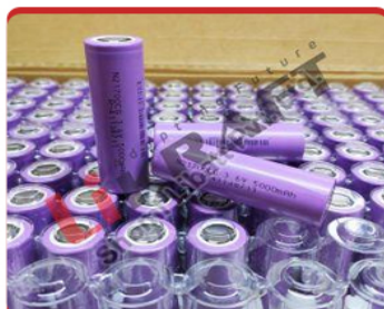
3.7V 5000 Lithium Battery Cell