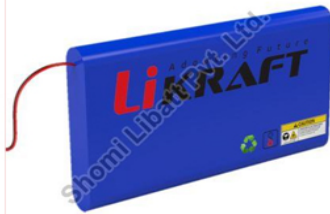
LiK1248S 12V Series Lithium Ferro Phosphate Battery