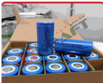
3.2V 6000mAh A- Grade 5C Boost Battery Cell