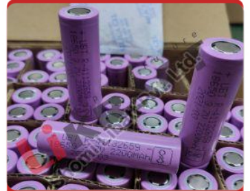
2200 3.7V Lithium Battery Cell