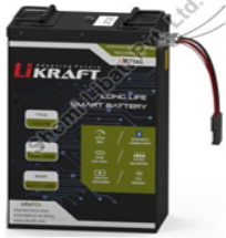
LiK7345 Lithium Ion Phosphate Battery

Adopting Future LiKRAFT Shomi Libatt Pvt. Ltd.