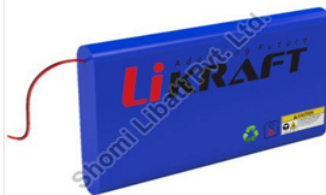
LiK2548S 24V Series Lithium Ferro Phosphate Battery