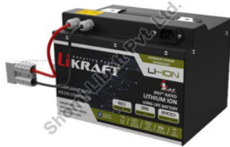
LiK6035 Lithium Ion Phosphate Battery