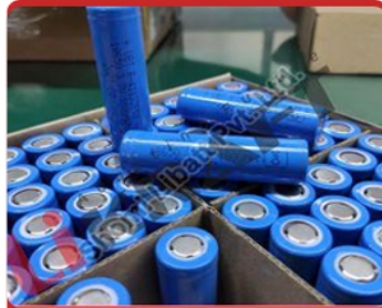
1800 3.7V Lithium Battery Cell