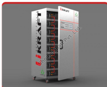
Medical Lithium Storage