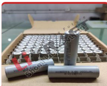
BAK 2550 3.7V Lithium Battery Cell