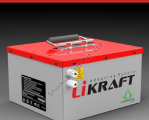
72V 30Ah Lithium Ion Electric Two Wheeler Battery