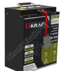
LiK7255 Lithium Ion Phosphate Battery