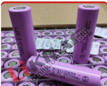
2600 3.7V Lithium Battery Cell