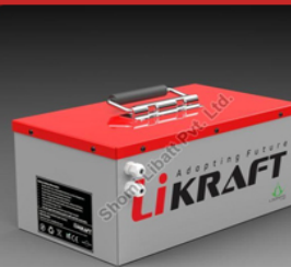
60V-40Ah-NMC-18650-2550 Electric Two Wheeler Battery