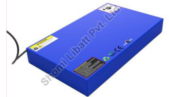
LiK1236S 12V Series Lithium Ferro Phosphate Battery