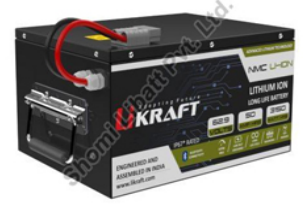
LiK6250 Lithium Ion Phosphate Battery