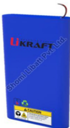
LiK1242S 12V Series Lithium Ferro Phosphate Battery