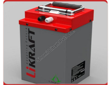
2.8v 100Ah Tall Lithium Ion Solar Battery