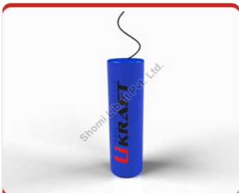
3.7V 2.5Ah Lithium Ion Solar Battery