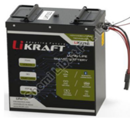
LiK7333 Lithium Ion Phosphate Battery