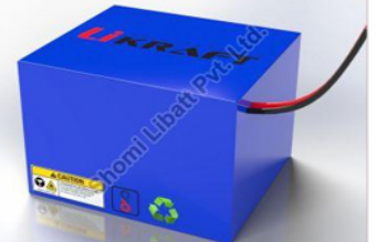
LiK2506S 24V Series Lithium Ferro Phosphate Battery