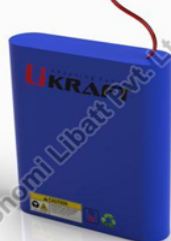
LiK2512S 24V Series Lithium Ferro Phosphate Battery