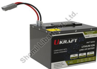
LiK7226 Lithium Ion Phosphate Battery