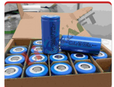
3.2V 6000mAh A Grade 3C Battery Cell