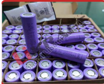
2000 3.7V Lithium Battery Cell