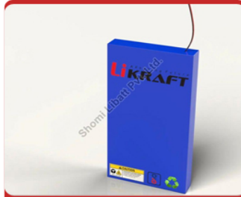
12.8V 30Ah Flat Lithium Ion Solar Battery