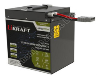
LiK5133 Lithium Ion Phosphate Battery