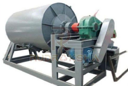
Ball Grinding Mill