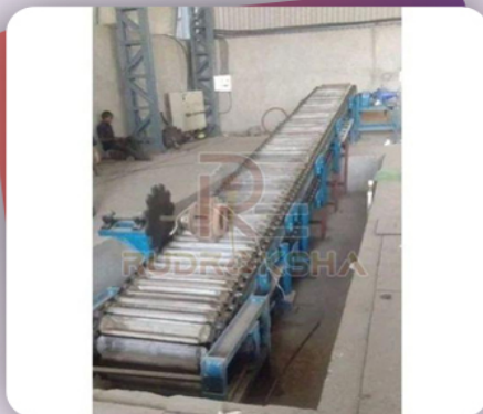
Copper Ingot Casting Conveyor