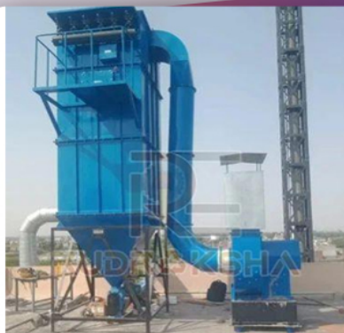
Industrial Bag Filter System