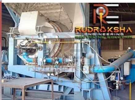
Universal Tilting Rotary Furnace