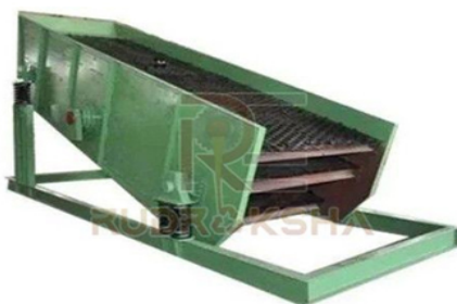
Sand Screening Plant