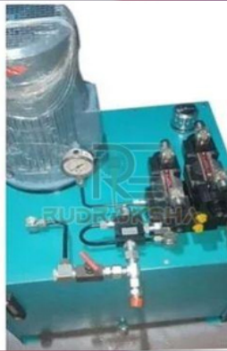
Hydraulic Power Pack