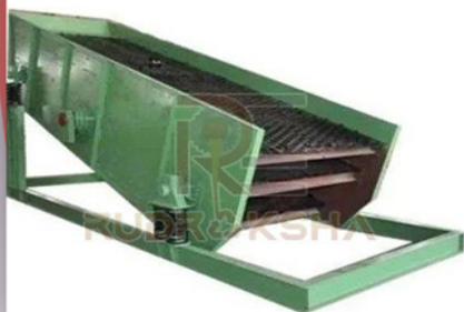
Sand Screening Machine