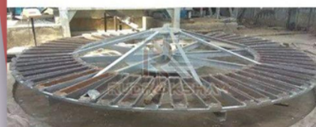
Table Ingot Casting Conveyor