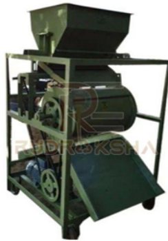
Single Drum Magnetic Separator