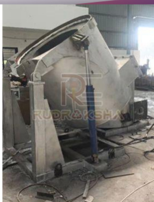
Copper Melting Furnace