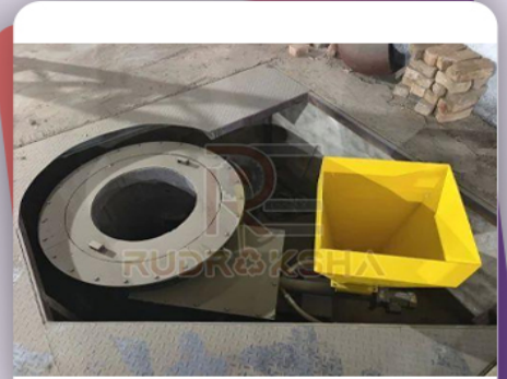
BioMass Pellet Burner