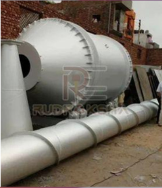
Aluminium Skelner Furnace