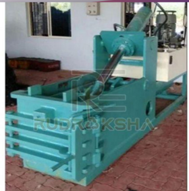
Aluminium Baling Press