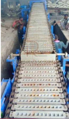
Qube Casting Conveyor