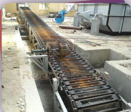
Aluminium Ingot Casting Conveyor