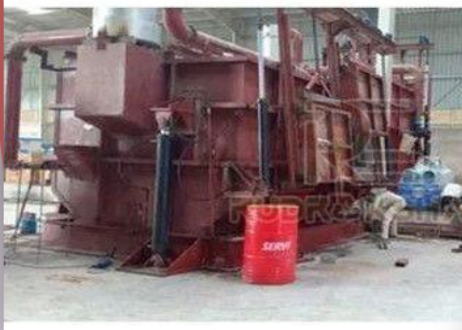
Aluminium melting skelner furnace