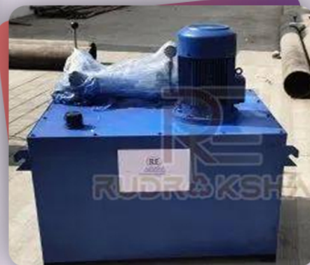
Auto Bale Cutting Machine