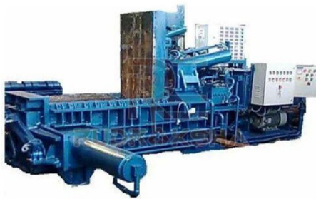
Scrap Baling Press Machine