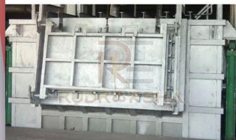
Gas Aluminium Melting Furnace