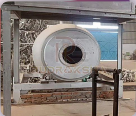
Gas Aluminium Roasting Furnace