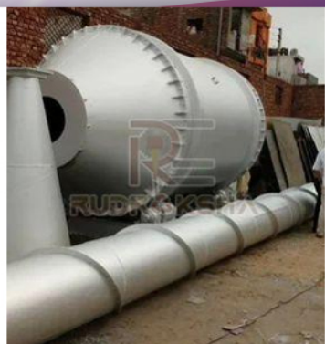
Gas Aluminium Rotary Furnace