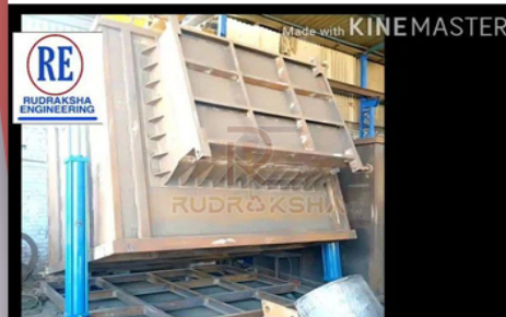
Aluminium melting furnace