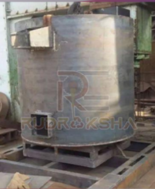
Crucible Tilting Furnace