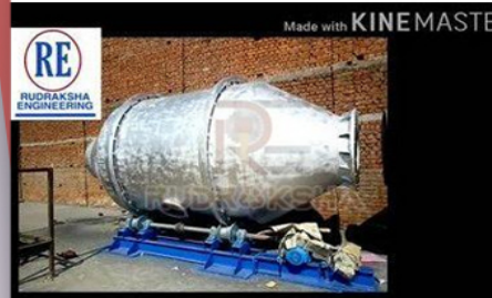
Tilting Rotary Furnace