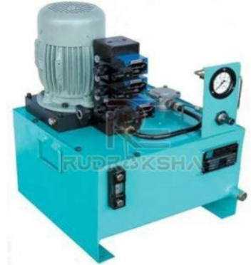
Hydraulic Power Pack