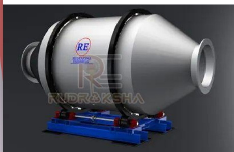
Aluminium Rotary Furnace