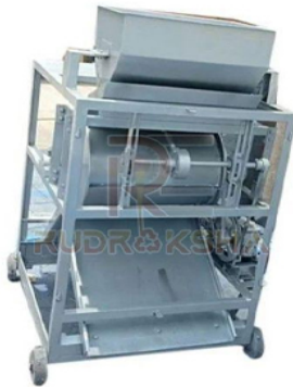
Magnetic Iron Separator