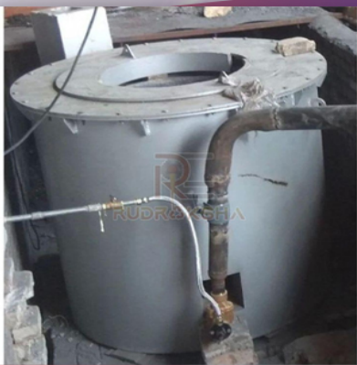
Aluminium Melting Furnace