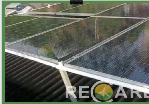
Solar Panel Cleaning System

Business Type Brand Name Driven Type Rope material Color Condition Automatic Grade Application Voltage