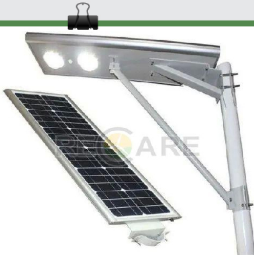
All in One Solar Led Street Light