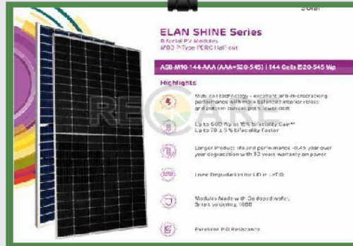
Adani Solar Panel

Exporter, Supplier Adani New Automatic Solar 520-545 W Industrial Solar Panel