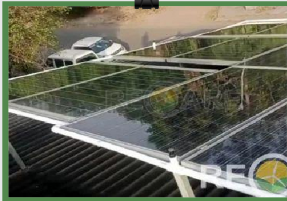
4kw Solar Rooftop System

Business Type Brand Name Color Condition Rated Power Automatic Grade Type Capacity Axis Type IP Rating