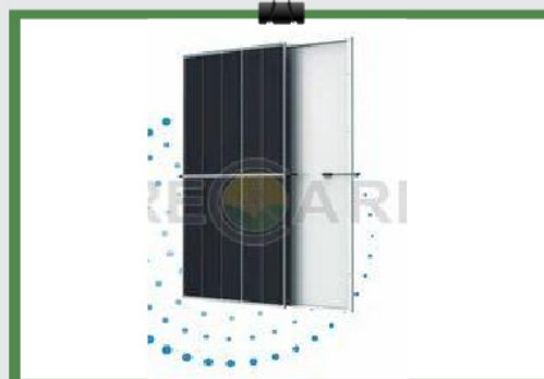
Waaree Solar Panel

Exporter, Supplier Recare Solar New Semi Automatic Solar Power Plants 5yrs India