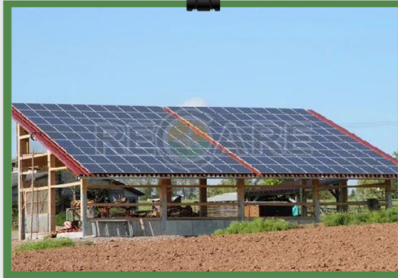
20kw Solar Rooftop System

Business Type Driven Type Color Condition Automatic Grade Type Country of Origin Capacity Axis Type IP Rating