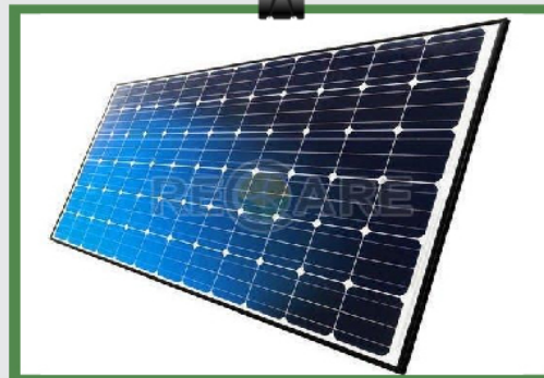
Monocrystalline Solar Panel

Exporter, Supplier Recare New Automatic Solar, Solar 50W Industrial Monocrystalline Solar Panel