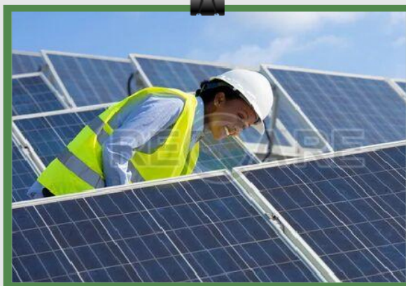
Single Phase Solar On Grid Rooftop System

Business Type Brand Name Capacity Condition Automatic Grade Power Source Application Purity Warranty Country of Origin