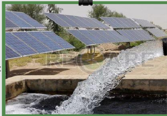
Solar Water Pumping System

Business Type Brand Name Color Condition NewAutomatic Type Warranty Country of Origin Power Phase