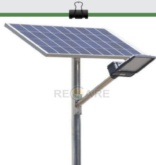
Semi Integrated Solar Street Light