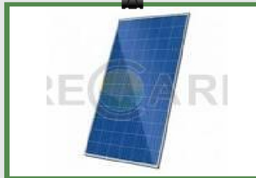
Polycrystalline Solar Panel

Exporter, Supplier Recare New Automatic Solar 50W Industrial Multi Crystalline Solar Panel