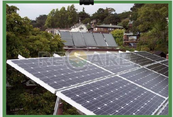
1kw Rooftop Solar Power System

Exporter, Supplier Recare Mechanical Stainless Steel New, New 9-12kw Solar Power System 2yrs India 1 Kw