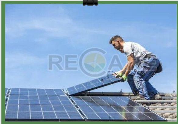
Residential Solar Power System

Business Type Capacity Brand Name Driven Type Rope material Condition Automatic Grade Power Type Country of Origin