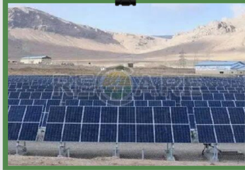
50kw Adani Solar Power Plant

Business Type Driven Type Condition Automation Grade Type Country of Origin Brand Name Capacity