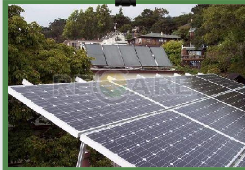
Adani Off Grid Mounting Structure Solar Power Plant

Business Type Brand Name Material Shape Condition Application Pattern Type