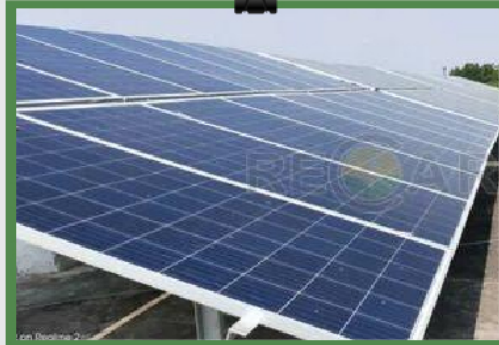
Adani Hybrid Solar Panel Plant

Business Type Brand Name Condition Automatic Grade Power Source Type Country of Origin Capacity