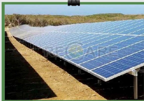
Solar Panel Rooftop Mounting Structure

Business Type Brand Name Material Shape Condition Application Pattern Type Country of Origin