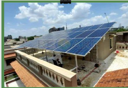
Rectangle Solar Power Plant

Business Type Driven Type Condition Automation Grade Type Country of Origin Brand Name Capacity