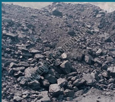
G4 6100-6400 GCV Non Coking Coal