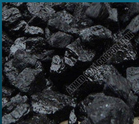
G2 6700-7000 GCV Non Coking Coal