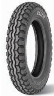
ECO BLASTER SL