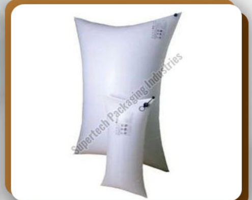
Polypropylene Dunnage Air Bag