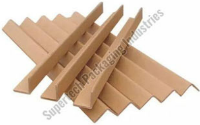
Corrugated Paper Angle Edge Board