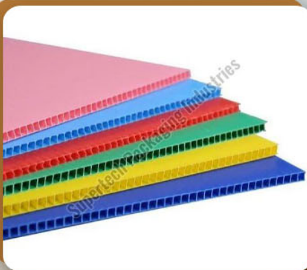
Multicolor Polypropylene Sheet