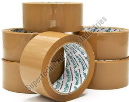
Brown BOPP Tape