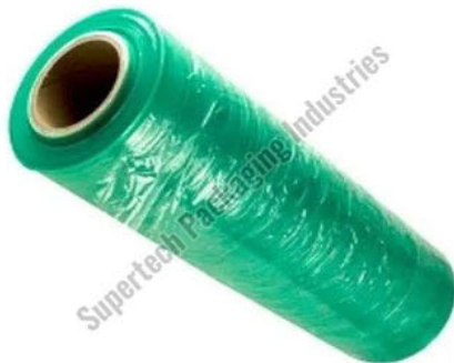
Green Stretch Wrapping Film Roll