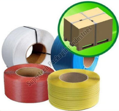
Multicolor PP Strapping Roll