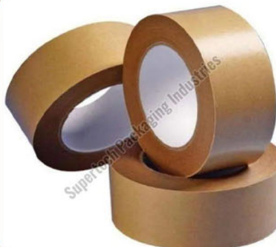
Kraft Paper Reinforcement Tape