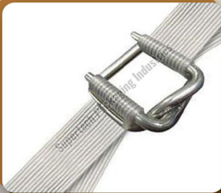
Cord Strap Buckle