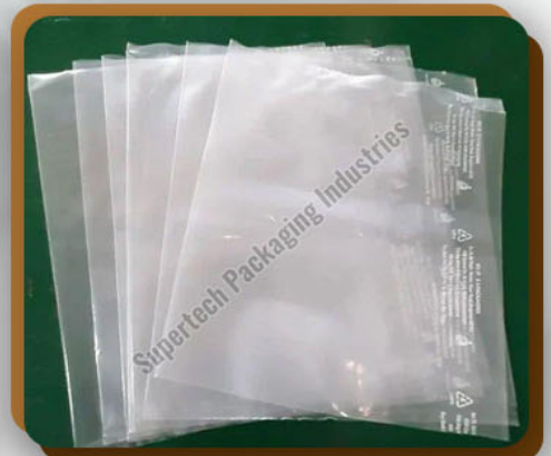
LD Liner Bag