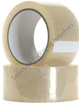
BOPP Packaging Tape