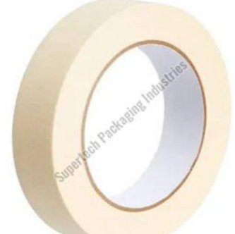
Single Sided Paper Masking Tape