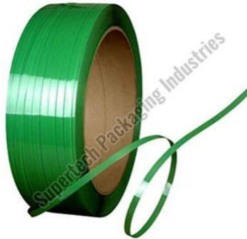
Green PET Strapping Roll