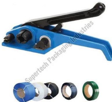
P330 PET Strapping Tool