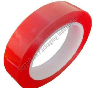
Red Double Sided Polyester Tape