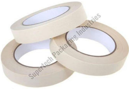
White Paper Masking Tape