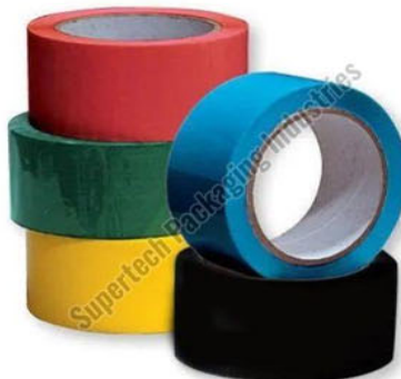
Multicolor Self Adhesive BOPP Tape