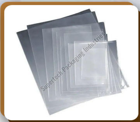
LD Plastic Carry Bag