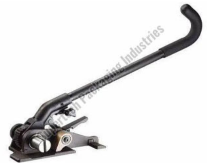
Strapping Tensioner Tool