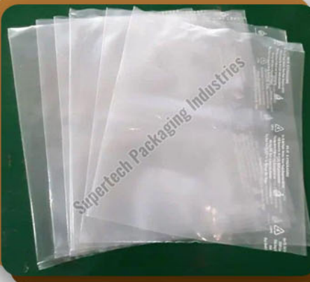
LDPE Plain Wrapping Film