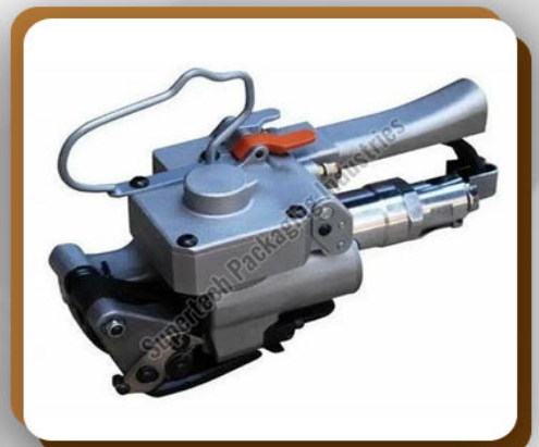
Pneumatic Strapping Machine