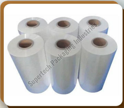
Plastic Stretch Wrapping Film Roll