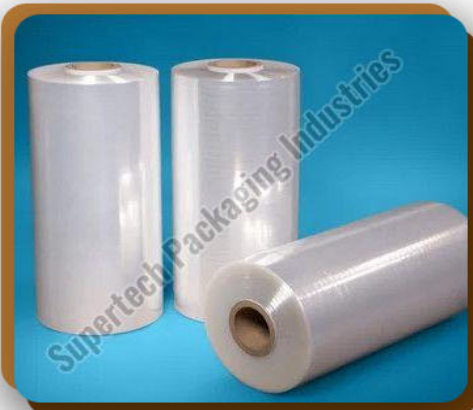
LDPE Transparent Wrapping Film Roll