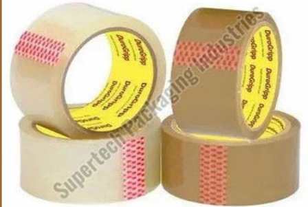
BOPP Transparent Cello Tape