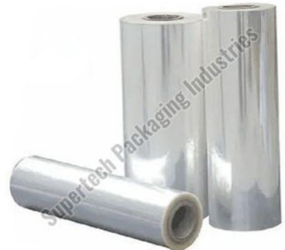
LDPE Shrink Wrapping Film Roll