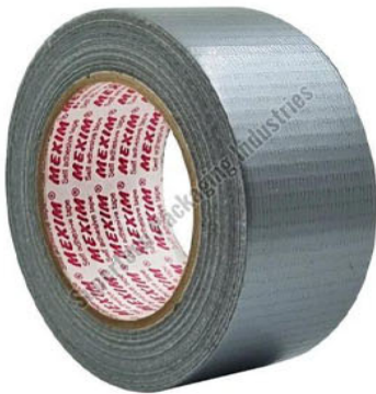
PVC Duct Tape