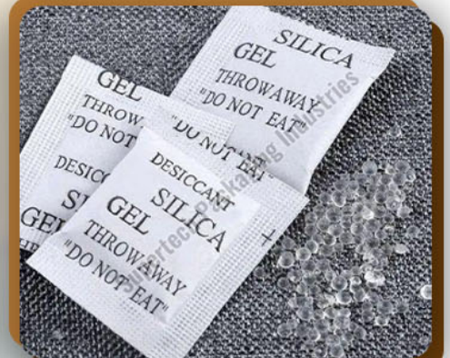
Desiccant White Silica Gel