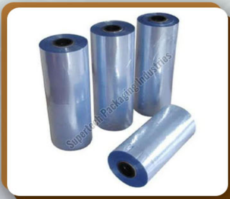
PVC Shrink Wrapping Film Roll