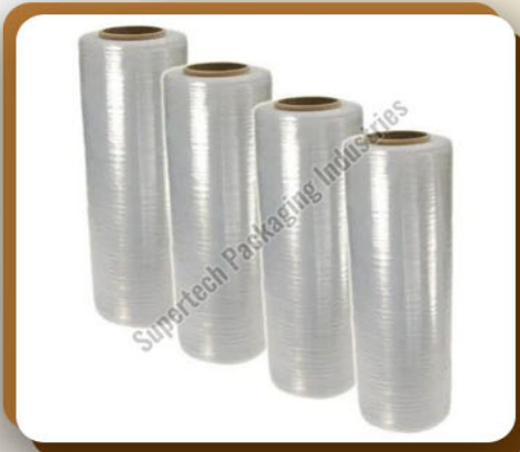
LLDPE Stretch Film Roll