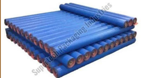
Blue HDPE Laminated Tarpaulin