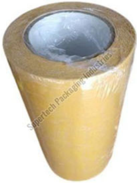
Double Sided Cloth Tape