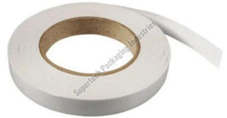
Double Sided Tissue Tape