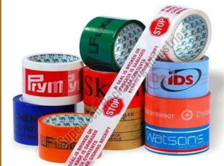
Printed BOPP Tape