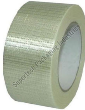
Cross Filament Tape