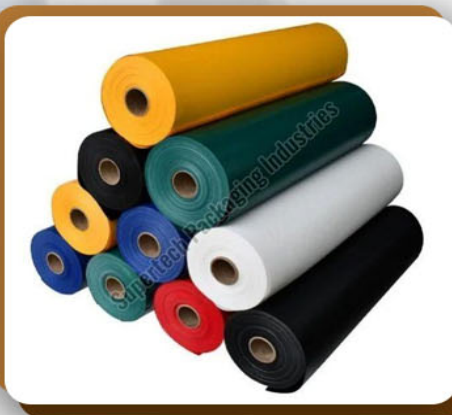
Tarpaulin HDPE Woven Fabric