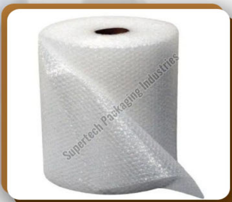
Air Bubble Roll