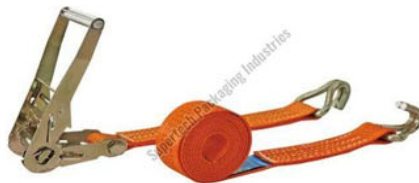
Ratchet Lashing Belt