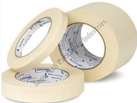
Plain Paper Masking Tape