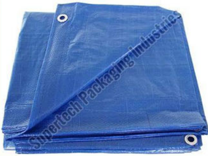
Blue HDPE Tarpaulin