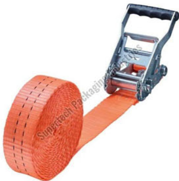
Cargo Lashing Belt