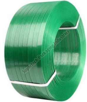
Green Polyester Strapping Roll