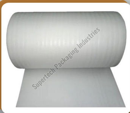
EPE Foam Roll