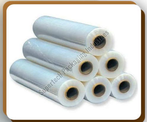
PE Stretch Wrapping Film Roll