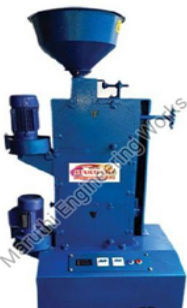
Mini Rice Huller Machine