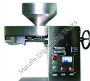
2 HP Mini Oil Expeller Machine