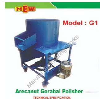
Areca Polisher Machine