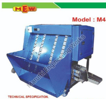
M4 Areca Dehusker Machine