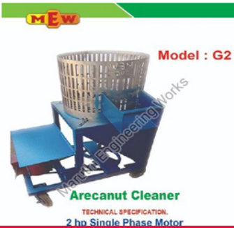
Areca Cleaner Machine