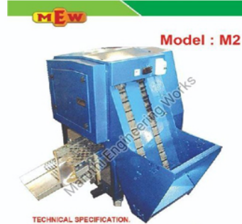
M2 Areca Dehusker Machine