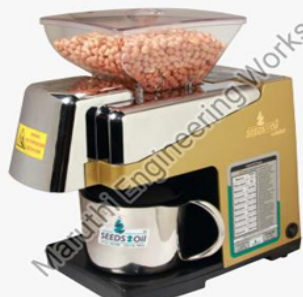
Cold Press Machine