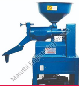
Mini Rice Mill Machine without Destoner