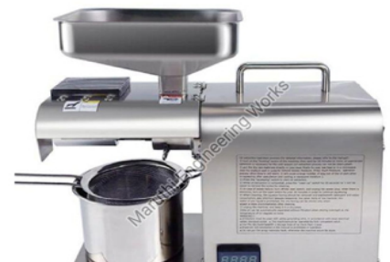
1 HP Mini Oil Expeller Machine