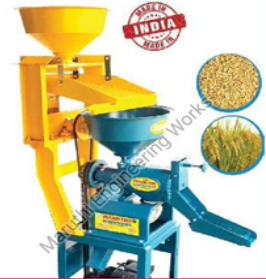
Mini Rice Mill Machine with Destoner