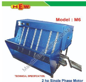
M6 Areca Dehusker Machine