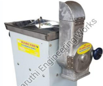
Mini Copper Cutting Machine