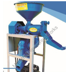
Mini Rice Mill & Bran Powder Machine