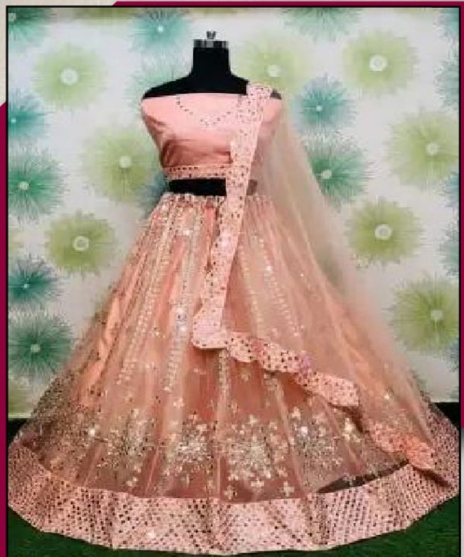
Peach Party Wear Lehenga Choli