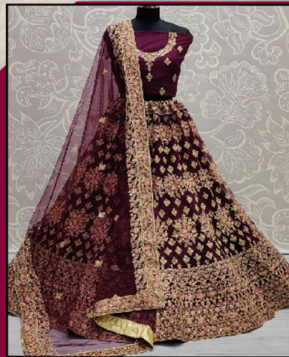
Silk Bridal Lehenga Choli