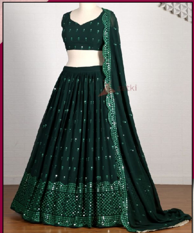
Green Party Wear Lehenga Choli