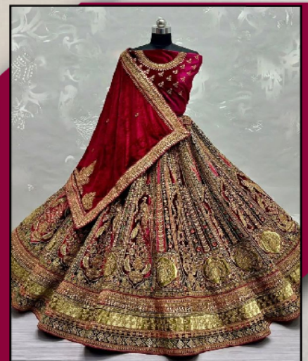
Velvet Bridal Lehenga Choli