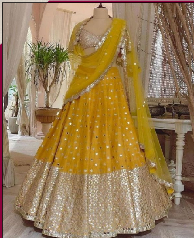
Yellow Party Wear Lehenga Choli