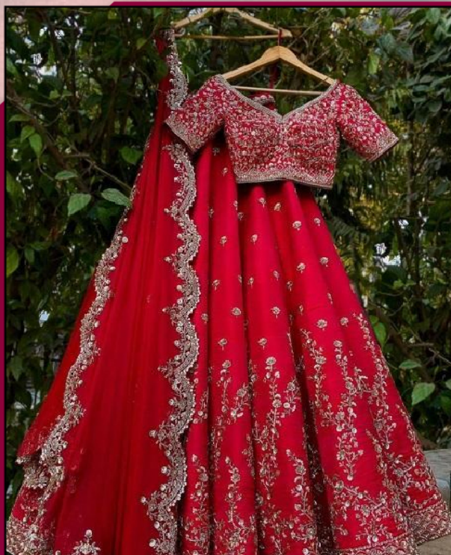
Red Party Wear Lehenga Choli