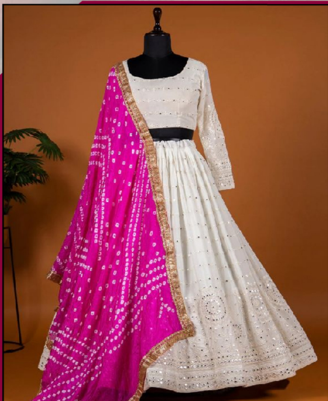
White Party Wear Lehenga Choli