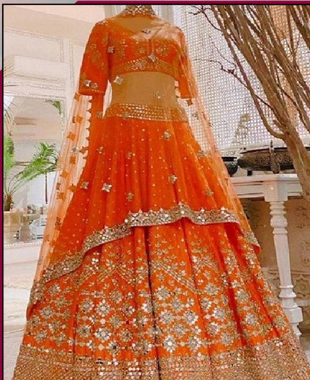
Orange Party Wear Lehenga Choli