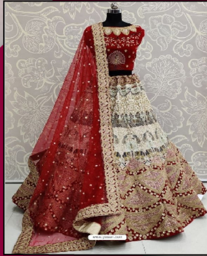
Embroidered Bridal Lehenga Choli