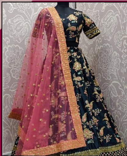
Modern Bridal Lehenga Choli