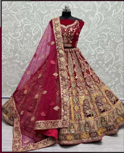
Designer Bridal Lehenga Choli