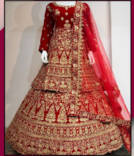
Fancy Bridal Lehenga Choli