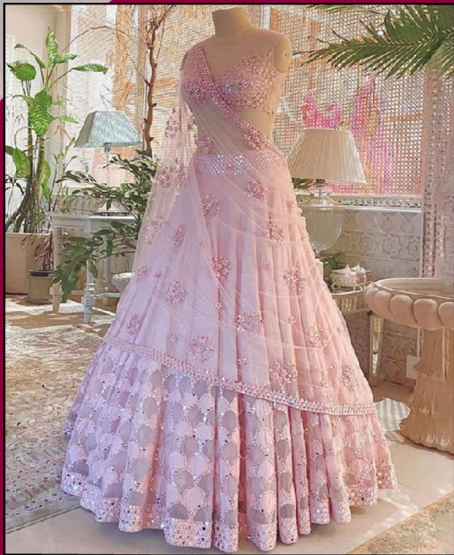
Pink Party Wear Lehenga Choli