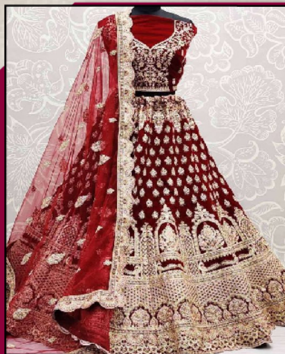
Traditional Bridal Lehenga Choli