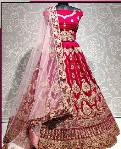
Stylish Bridal Lehenga Choli