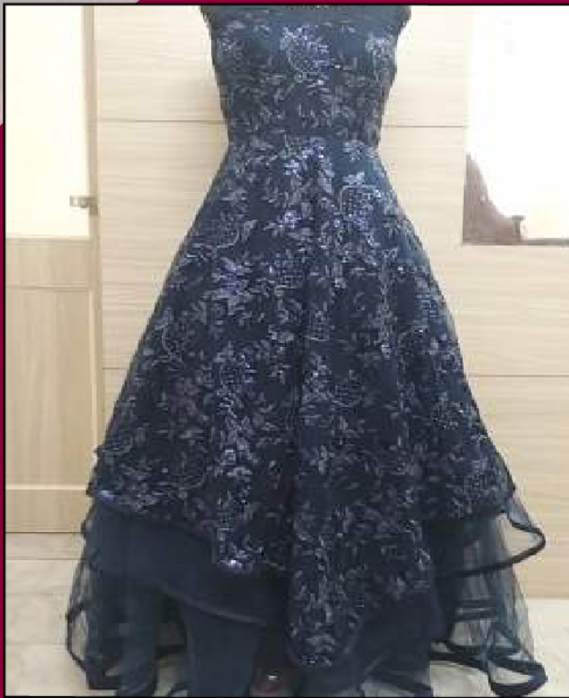
Party Wear Gown