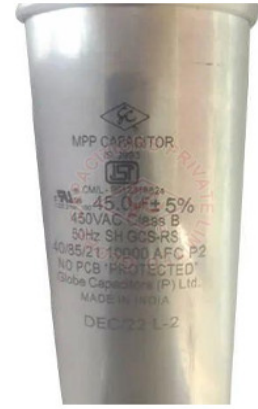
45 MFD 450 VAC Class-B MPP Capacitor