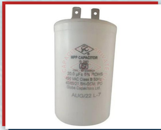
20 MFD 450 VAC MPP Capacitor