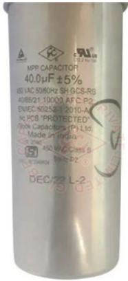
40 MFD 450 VAC MPP Capacitor