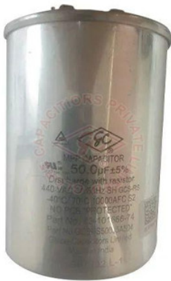
50 MFD 440 VAC MPP Capacitor