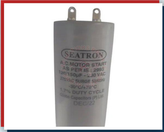
Seatron 120/150 MFD 230 VAC AC Motor Start Capacitor