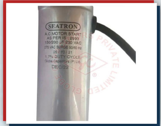
Seatron 150/200 MFD 230 VAC AC Motor Start Capacitor