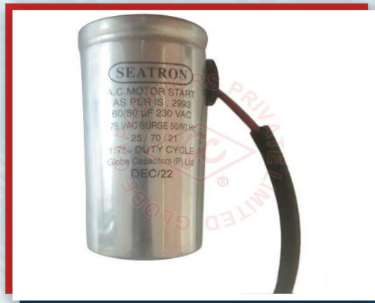
Seatron 60/80 MFD 230 VAC AC Motor Start Capacitor