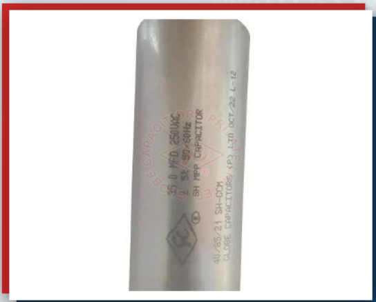
35 MFD 250 VAC Al Cane SH MPP Capacitor