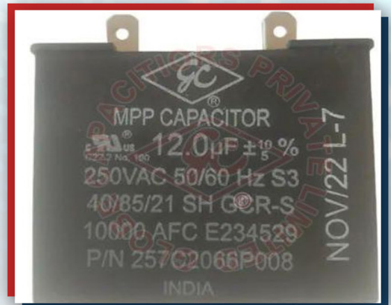
12 MFD 250 VAC Box Type MPP Capacitor