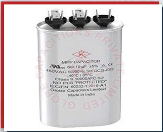
GCS-OD Oval Dual MPP Capacitor