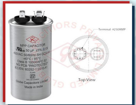
GCS-RS Single Round MPP Capacitor