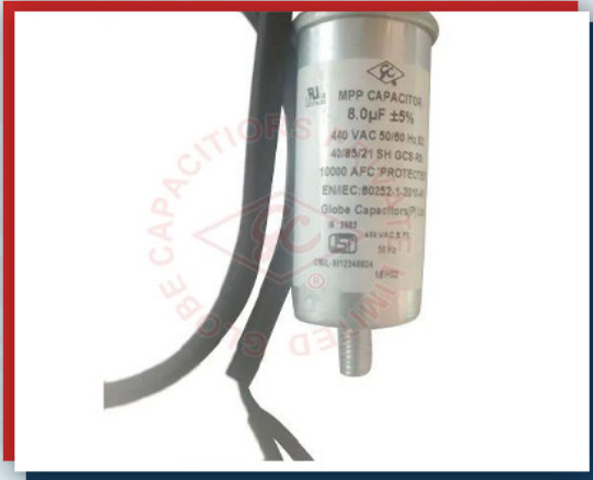
8 MFD 440 VAC Studs MPP Capacitor