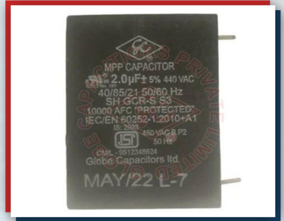
2 MFD 450 VAC MPP Capacitor