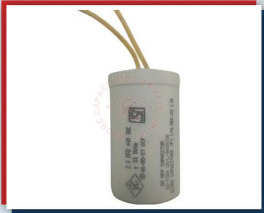
2 MFD 440 VAC PP Cane SH MPP Capacitor