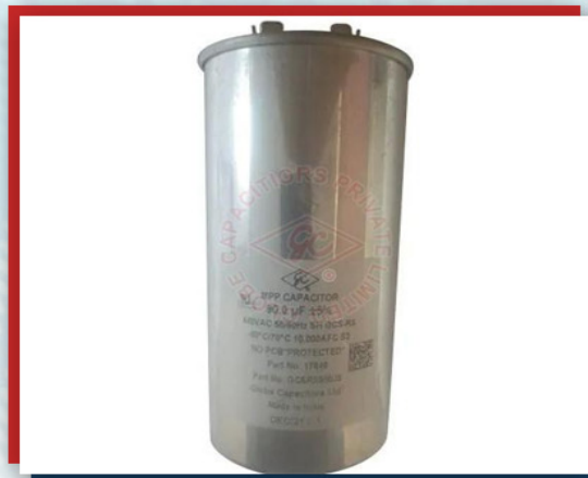
90 MFD 440 VAC Al Cane MPP Capacitor