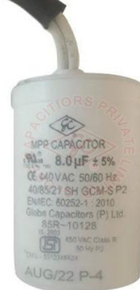
8 MFD 440 VAC MPP Capacitor