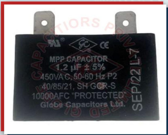
1.2 MFD 450 VAC MPP Capacitor