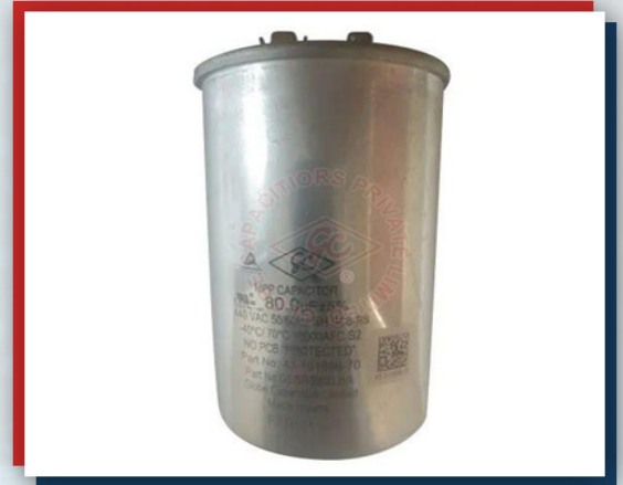
80 MFD 440 VAC Al Cane MPP Capacitor