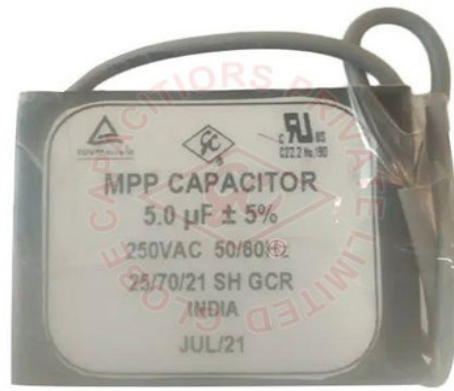
5 MFD 250 VAC MPP Capacitor