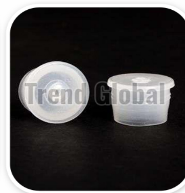
PP Inner Plug Cap