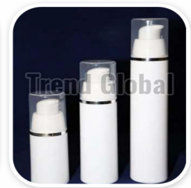
PP Airless Bottle