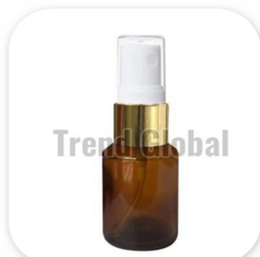
Round Tapered Glass Bottle