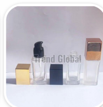
Foundation Glass Bottle