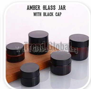
AMBER GLASS JAR WITH BLACK CAP