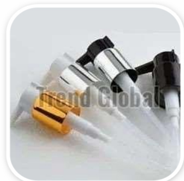
PP Soul Pump