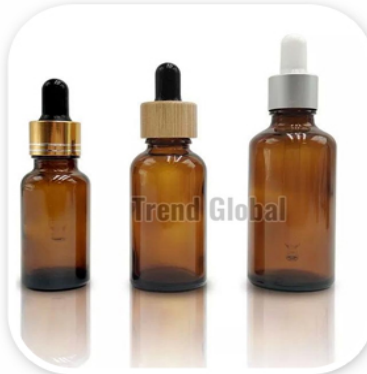
Amber Glass Dropper Bottle