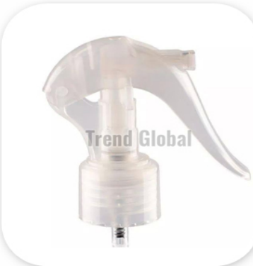
On Off Type Trigger Sprayer