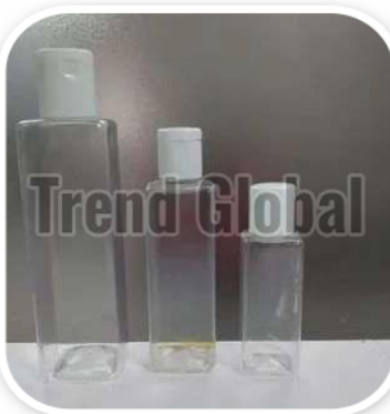
PET CZS Square Bottle