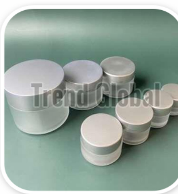
Glass Round Jar