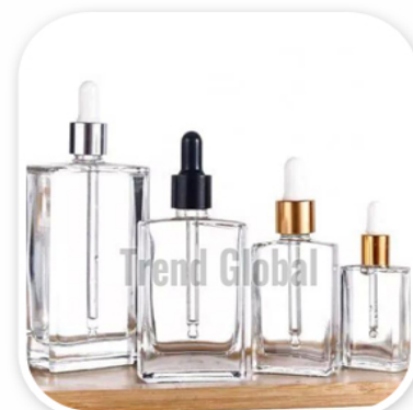
Clear Frosted Rectangular Glass Bottle