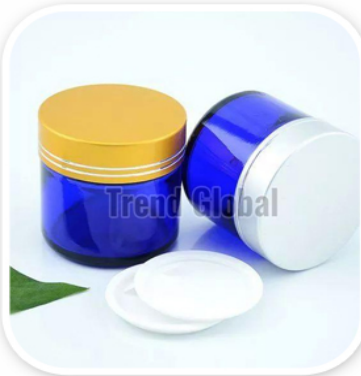
Blue Glass Jar