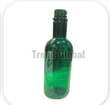
PET Wine Bottle