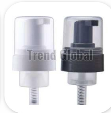
PP Foaming Pump