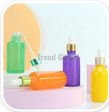
Glossy Color Coated Glass Dropper Bottle