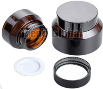
Amber Slant Shoulder Glass Jar

TREND GLOBAL Define A New Era Of Packaging