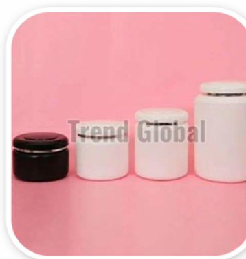
Round HDPE Micra Jar