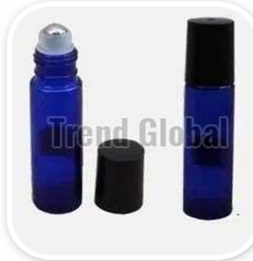
10 ml Glass Roll On Bottle