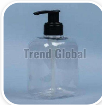
PET Square Hand Wash Bottle