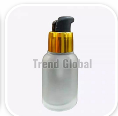
Glass Fancy Serum Bottle