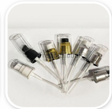
PP Serum Pump With Cap