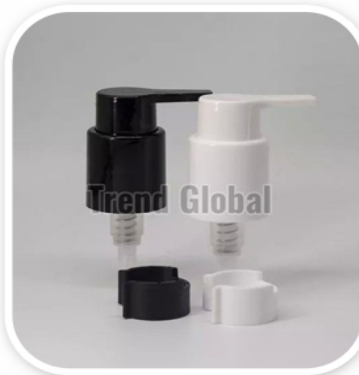
PP Long Neck Type Lotion Pump