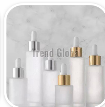
Flat Shoulder Cylinder Glass Bottle