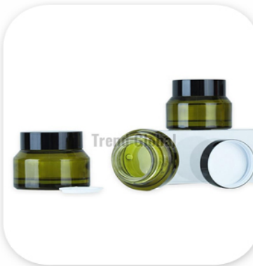
Green Slant Shoulder Glass Jar