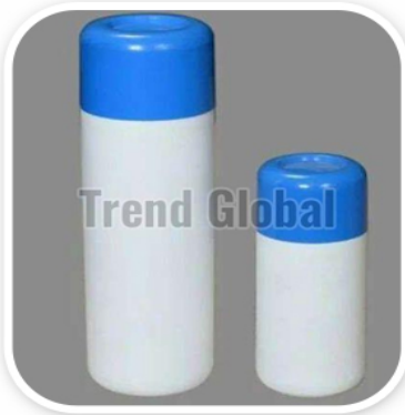
HDPE EW Round Talcum Powder Bottle