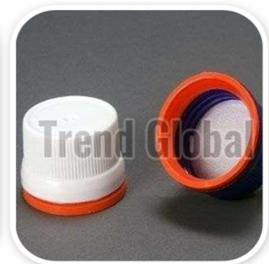
PP Pilfer Proof Caps