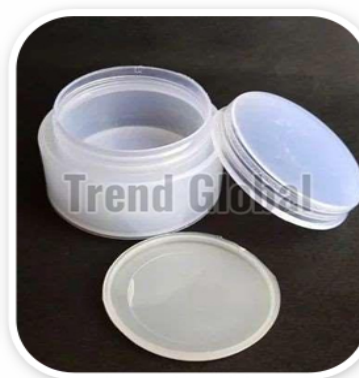
PP DW Cream Jar