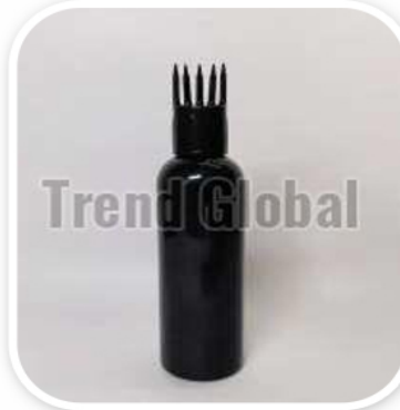
PP Comb Applicator Caps