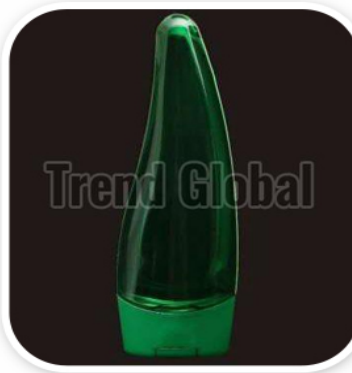
PET Aloe Vera Stand Up Bottle