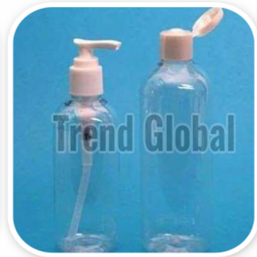
PET Boston Bottle