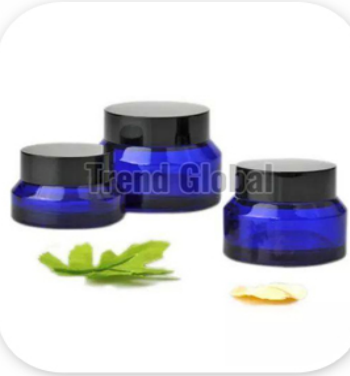
Blue Slant Shoulder Glass Jar