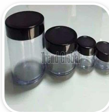
Acrylic San Jar