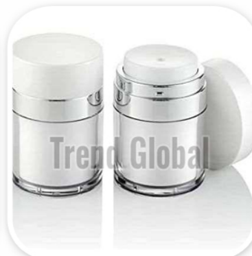
Acrylic Airless Jar