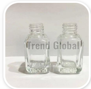
Clear Glass Bottle