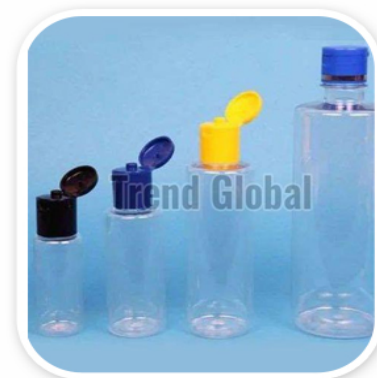
Round PET JLI Bottle