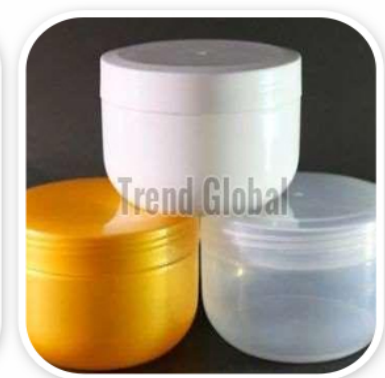
Round Joy Type PP Cream Jar