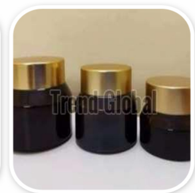
Glass Taper Jar