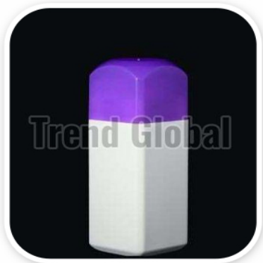
HDPE Square Talcum Powder Bottle