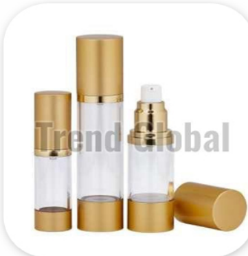
Acrylic Airless Bottle