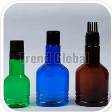
PET Kesh King Hair Oil Empty Bottle