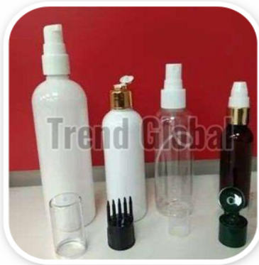
Avon PET Bottle