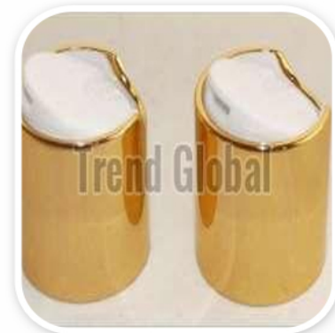
PP Disc Top Caps