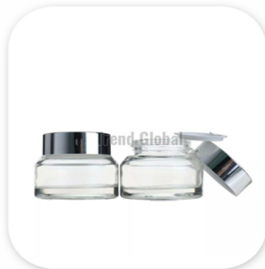
Clear Slant Shoulder Glass Jar