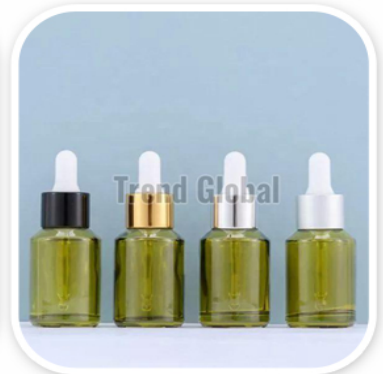
Green Slant Shoulder Glass Bottle