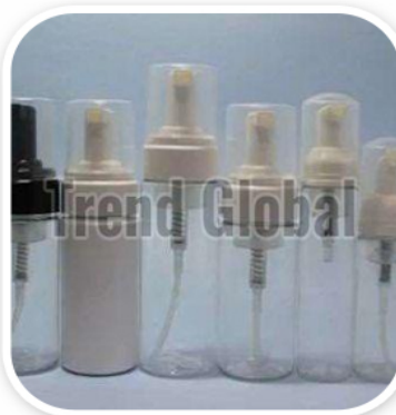
PET Foaming Bottle