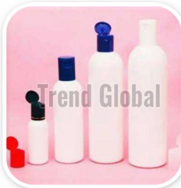
HDPE Round Bottle