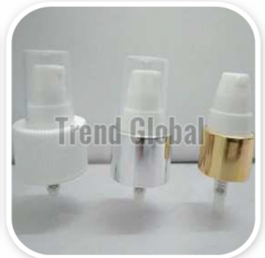
PP Cream Pump