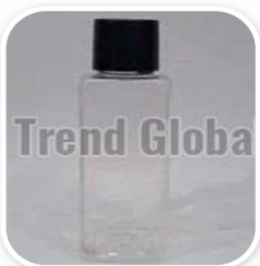
PET CZS Bottle