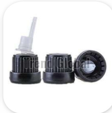
PP Vertical Dropper