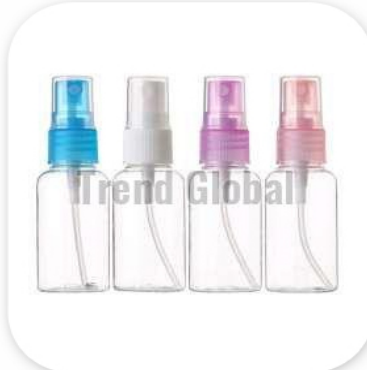
PP Fine Mist Spray Pump