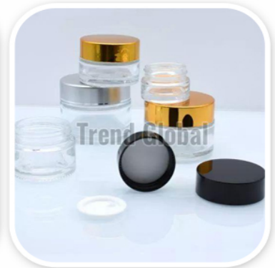
Clear Glass Jar