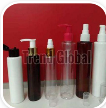
PET Sleek Bottle