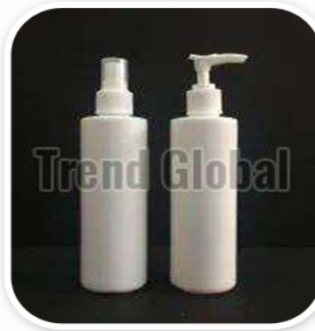
HDPE Sleek Bottle