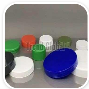
Polypropylene Screw Caps