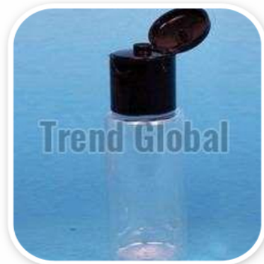
PET JLI Bottle