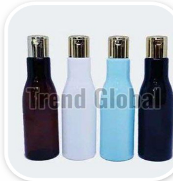
PET Asta Bottle