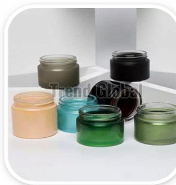
Color Coated Cream Glass Jar