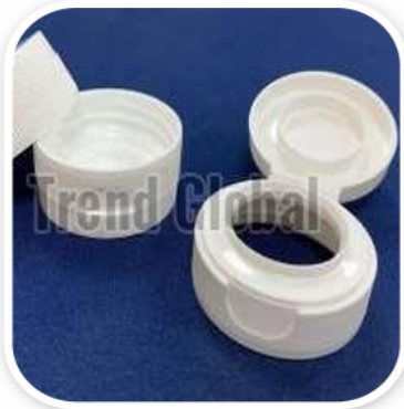
PP Flip Top Caps

TREND GLOBAL Define A New Era Of Packaging