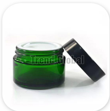
Green Glass Jar