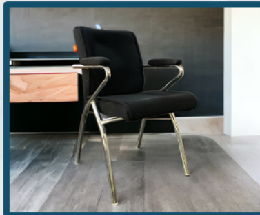
Mesh Visitor Chair