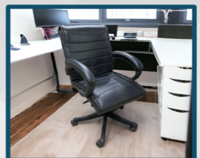
Low Back Revolving Chair