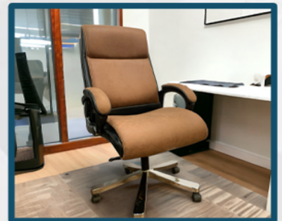
Executive Revolving Chair