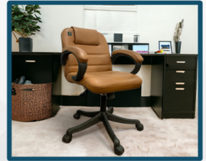
Mid Back Executive Chair