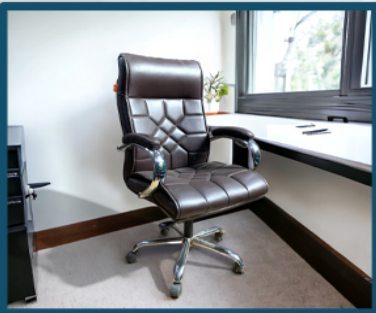
High Back Revolving Chair