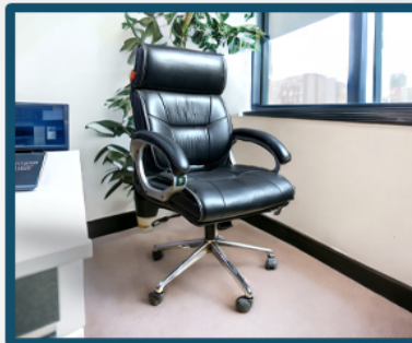
Executive Revolving Chair