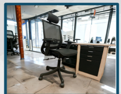
High Back Breathable Revolving Chair