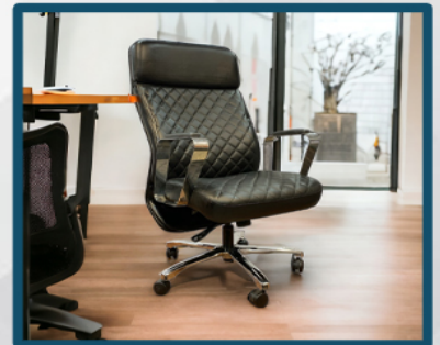
Executive Revolving Chair