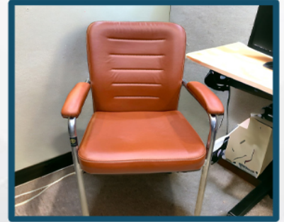
Executive Visitor Chair