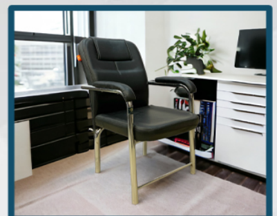
Executive Visitor Chair