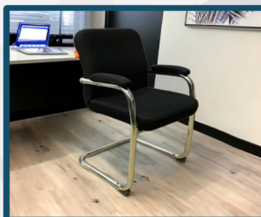
Executive Mesh Visitor Chair