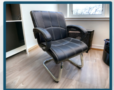
Executive Visitor Chair