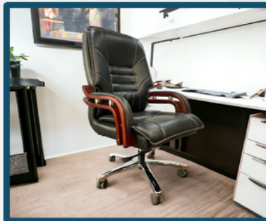
Executive Revolving Chair