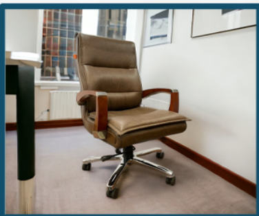
Executive Revolving Chair