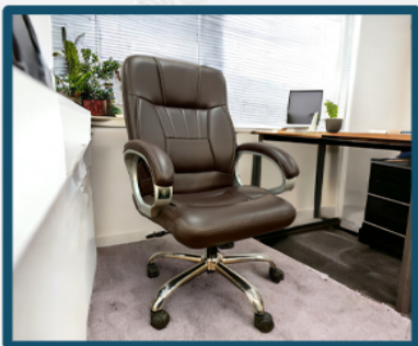
Executive Revolving Chair