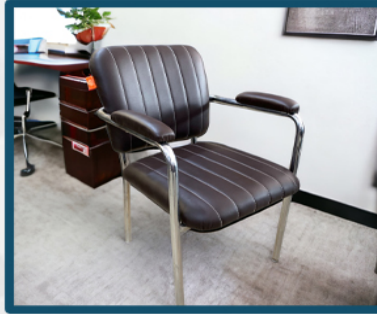
Executive Visitor Chair