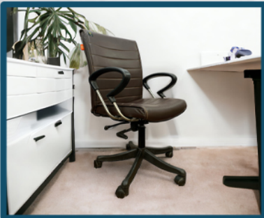
Mid Back Push Back Revolving Chair