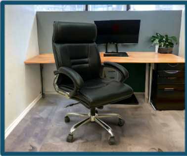
High Back Revolving Chair