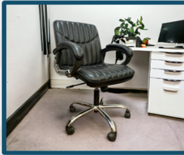
Mid Back Executive Chair