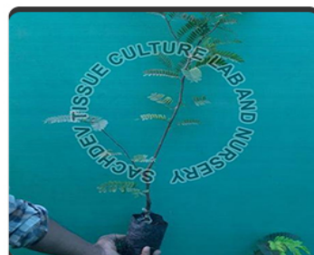
Sweet Imlı Plant