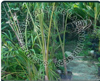
Areca Palm Plant