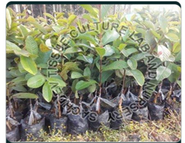
Red Diamond Guava Plant