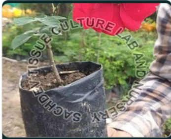
Sachdev Pusta Rose Plant