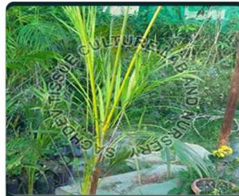
Bottle Palm Plant