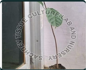
Green Mahogany Plant