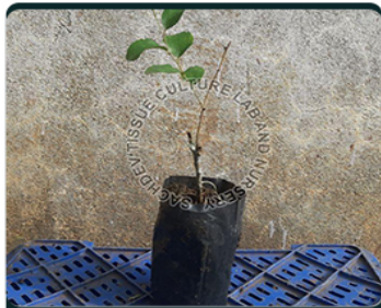
Miss India Apple Ber Plant