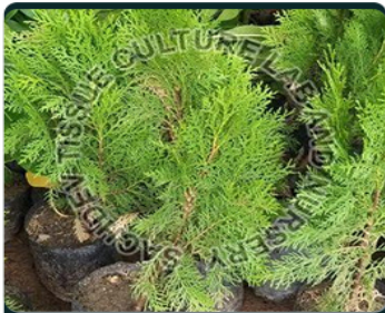
Green Mor Pankh Plant