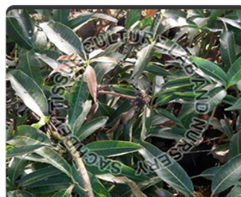
Chousa Mango Plant