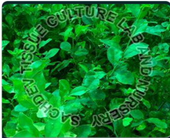
Desi Lemon Plant