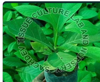
Tissue Culture Teak Plant