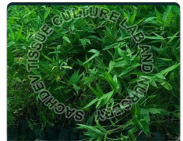
Tulda Bamboo Plant