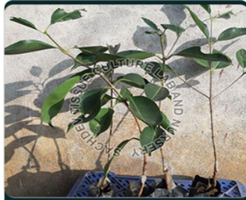
Thai Black Jamun Plant