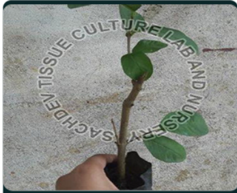
Taiwan Pink Guava Plant