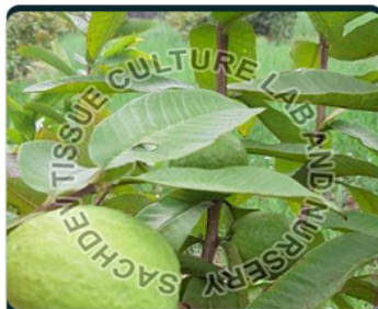
Tissue Culture Guava Plant