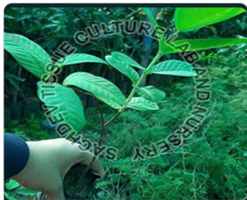
Thai Guava Plant