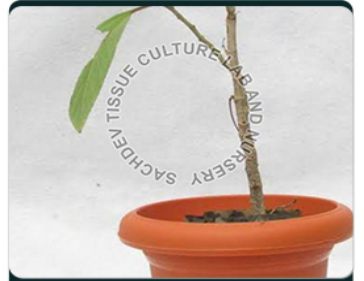
Gular Flower Plant