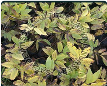
Desi Custard Apple Plant