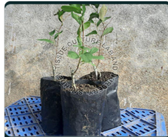
Red Apple Ber Plant