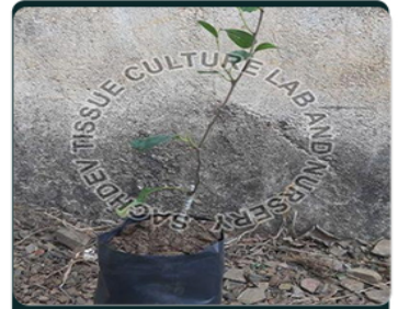
Green Apple Ber Plant