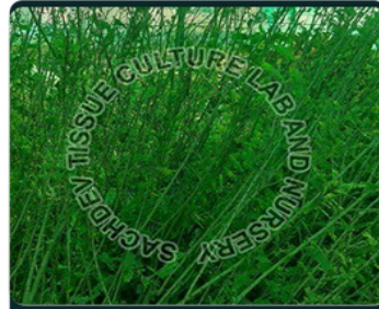
Grafted Amla Plant