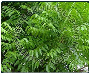
Kadvi Neem Plant