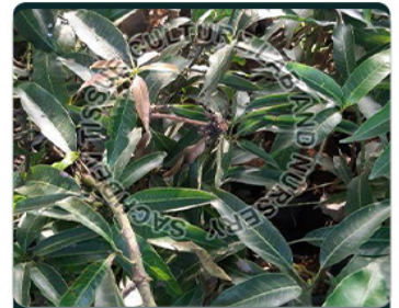
Mallika Mango Plant