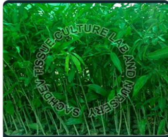
Dashahari Mango Plant