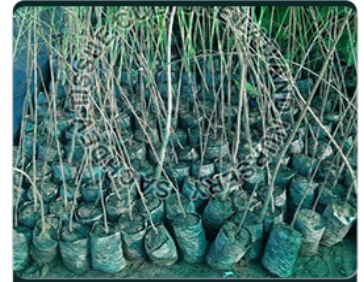
Desi Amla Plant