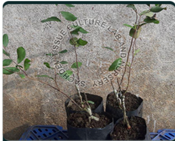
Kashmiri Apple Ber Plant