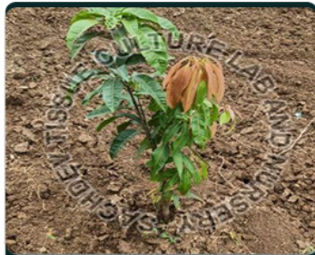
Langda Mango Plant