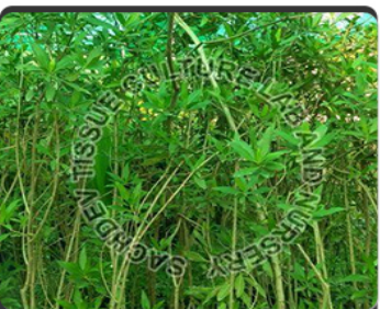
Malabar Neem Plant