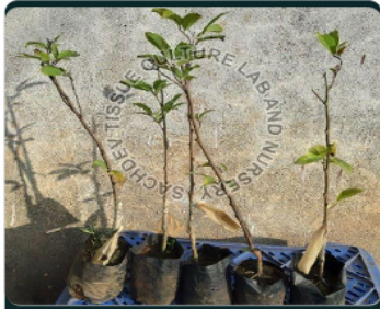
Custard Apple Plant