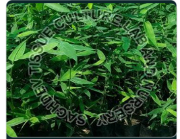
Deshi Bamboo Plant