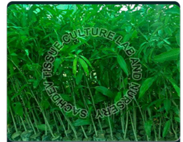
Aamrpali Mango Plant