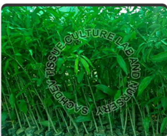
Barahmasi Mango Plant