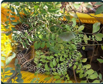
Green Meethi Neem Plant