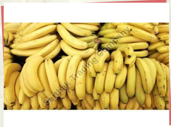
A Grade Fresh Banana