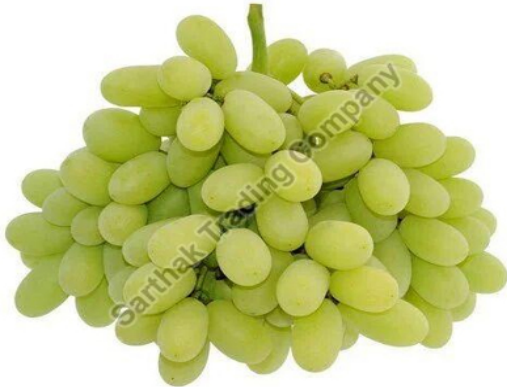
Fresh A Grade Green Grapes