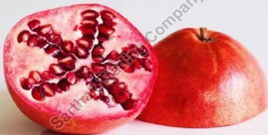
Fresh Pink Pomegranate