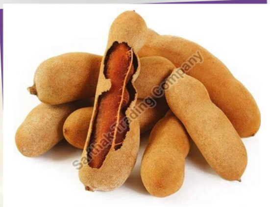
Dried Brown Tamarind