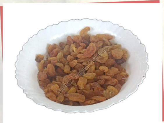
Dried Brown Raisin