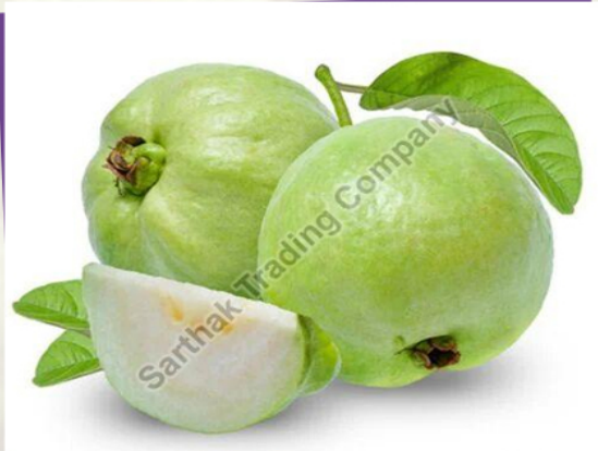
Fresh Green Guava