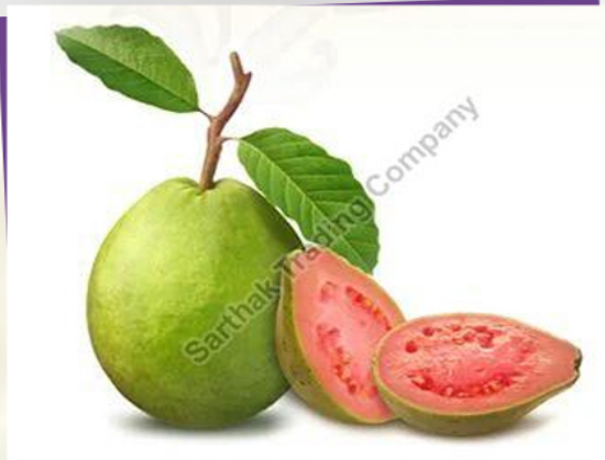
Fresh Pink Guava