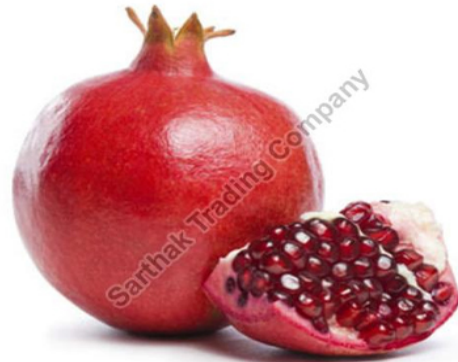
A Grade Fresh Pomegranate