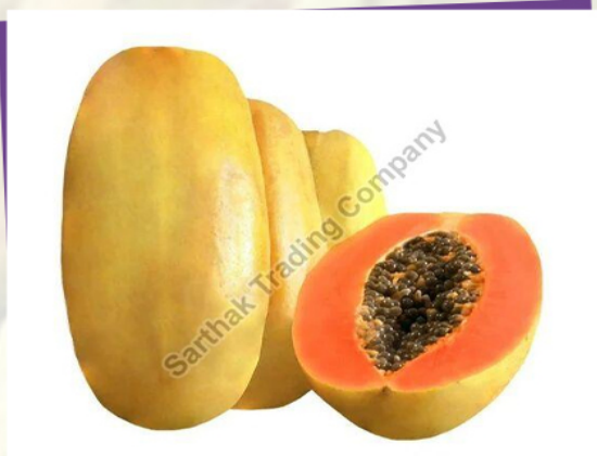
A Grade Fresh Yellow Papaya