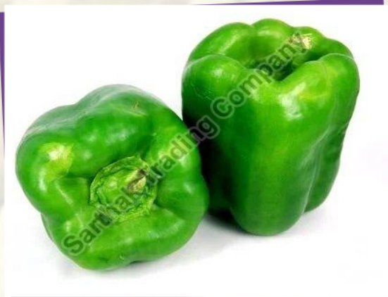
Fresh Green Capsicum