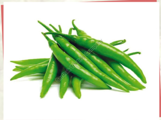
Fresh Green Chilli