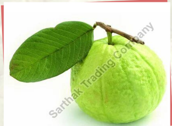
Fresh A Grade Fresh Guava