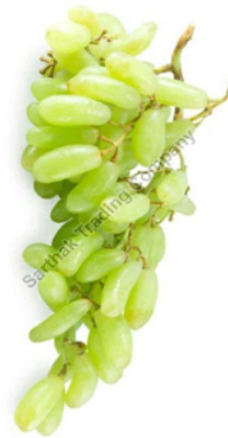
Fresh Long Green Grapes