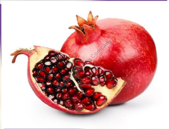
Fresh Red Pomegranate