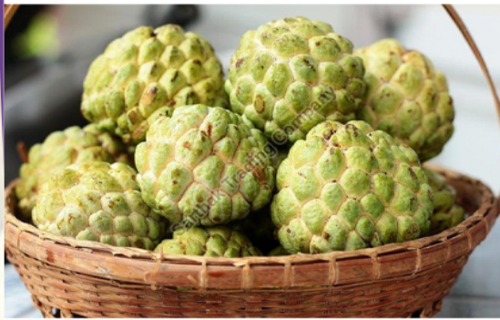
Kashmiri A Grade Fresh Custard Apple