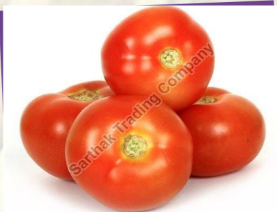
Fresh Red Tomato