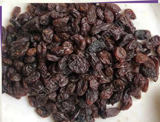
Dark Brown Dried Raisin