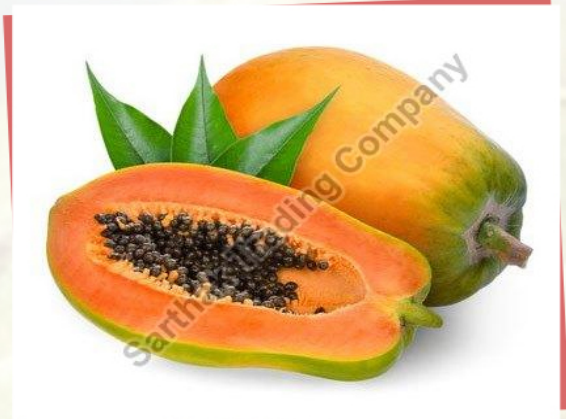
A Grade Fresh Papaya