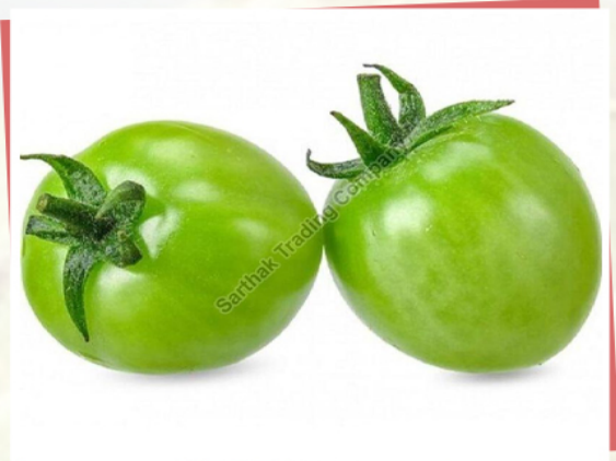
Fresh Green Tomato