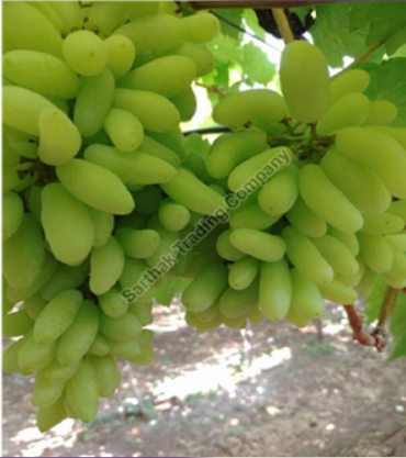
Fresh A Grade Green Grapes