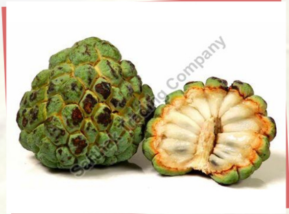
A Grade Fresh Custard Apple