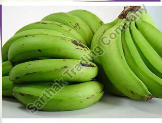
Fresh Green Banana