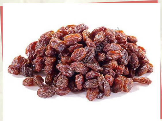
A Grade Dried Brown Raisin