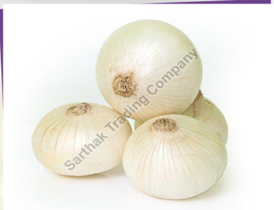
Fresh White Onion