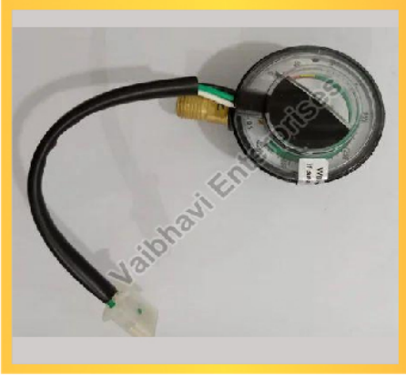
Back Mounting Pressure Gauge