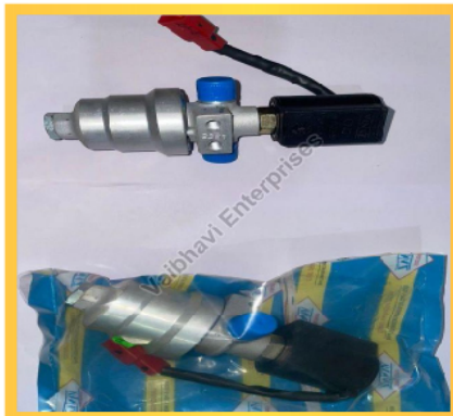
LPG Filter Solenoid Valve