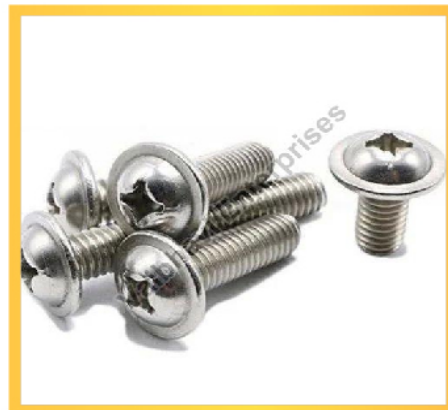
Flange Head Screw