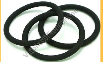
Upper O Ring