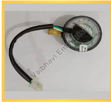
Waterproof Pressure Gauge