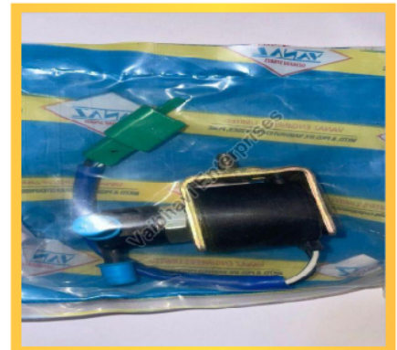
Petrol Solenoid Valve