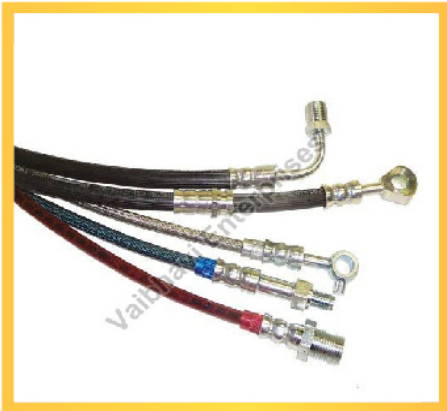
Low Pressure Hose Assemblies