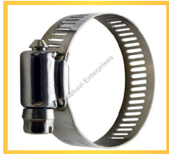
Stainless Steel Hose Clamp