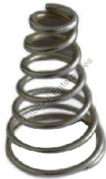
Conical Compression Spring