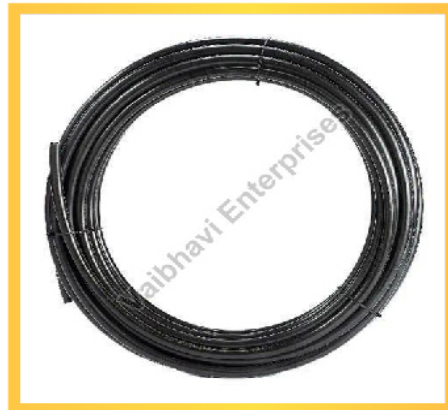
Low Pressure Hose Pipe