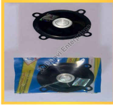
Non Magnet Vacuum Rubber Diaphragm