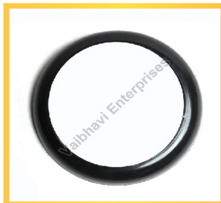
Dust Cap Ring