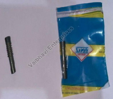
LPG Three Wheeler Piston Spring