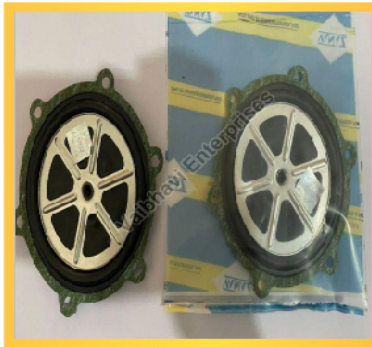
TVS Three Wheeler Diaphragm