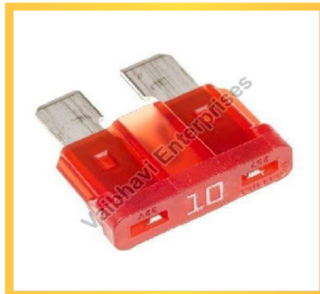
Three Wheeler Wiring Fuse