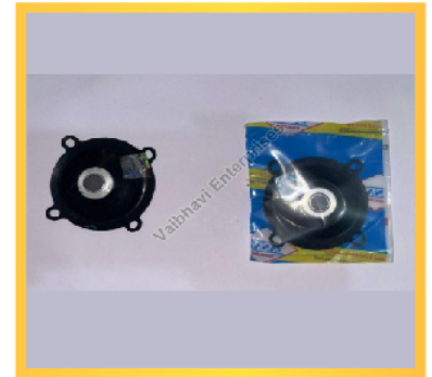
Vacuum Rubber Diaphragm