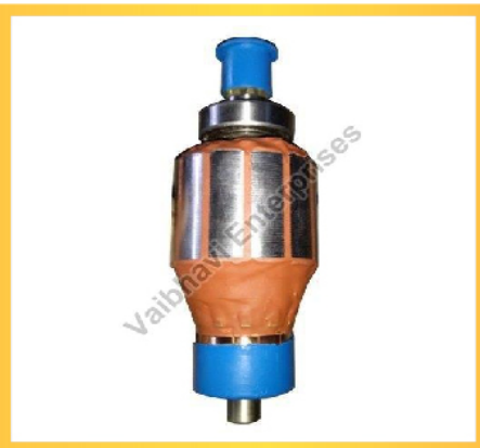
Armature Power Tool