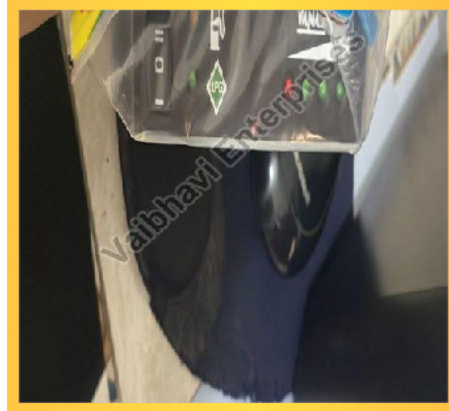
Three Wheeler LPG Kit Electronic Control Unit