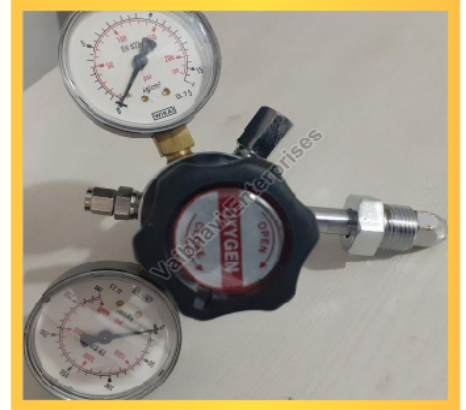
Two Stage Oxygen Gas Pressure Regulator