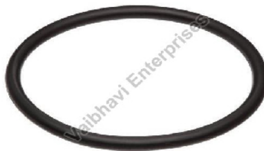
Rubber O Ring