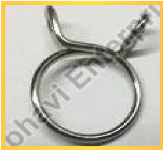
Spring Hose Clamp