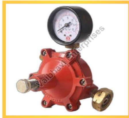
Two Stage LPG Regulator