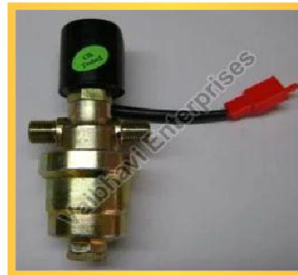
CNG Filter Solenoid Valve