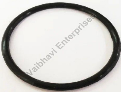
Bottom O Ring