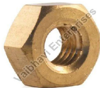
M5 Brass Nut