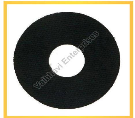
Rubber Seat Washer