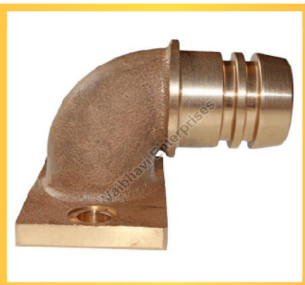
Water Outlet Elbow