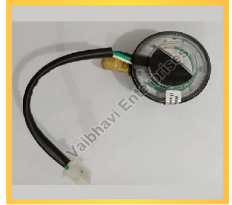
Weatherproof Pressure Gauge