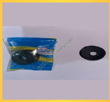
Three Wheeler Gas Filter