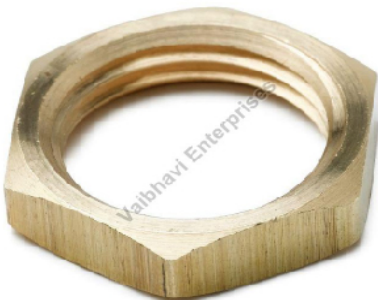
Brass Lock Nut