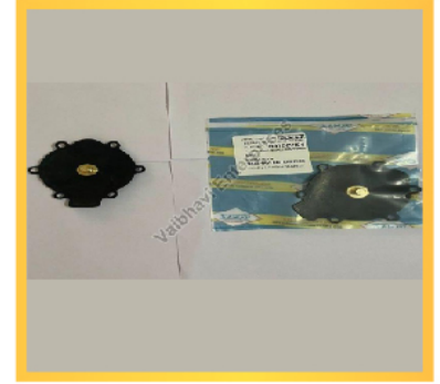
Small Rubber Diaphragm