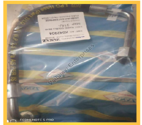
Three Wheeler Double Bend Hose