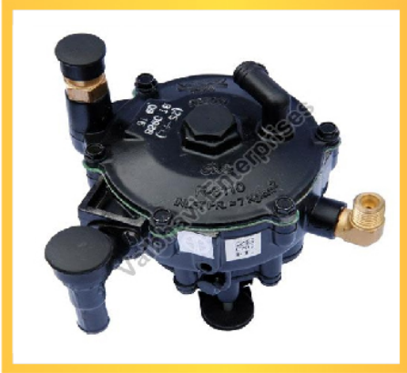
CNG Two Stage Gas Regulator