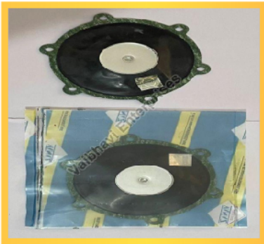
Three Wheeler Secondary Diaphragm