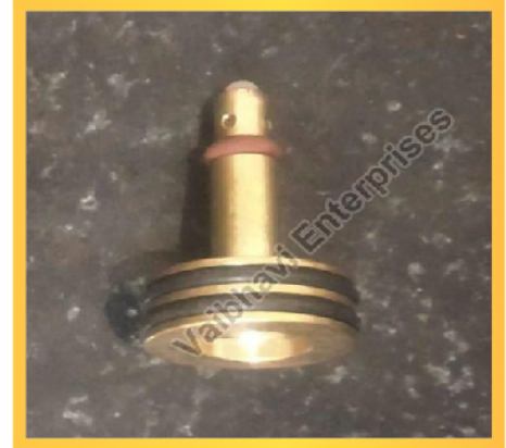
Brass Stem Differential Piston