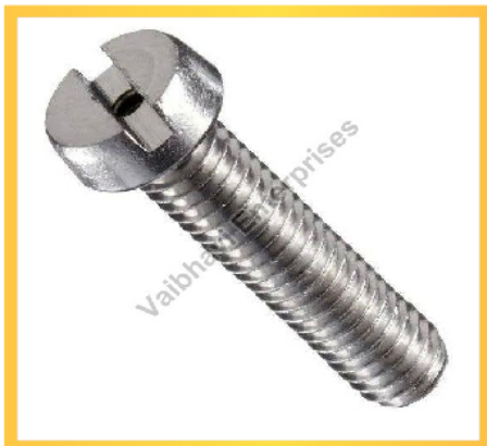
Cheese Head Screw