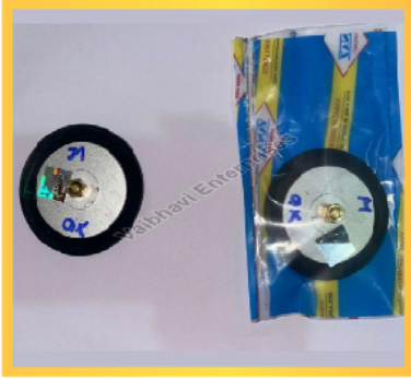
BS6 Three Wheeler Diaphragm