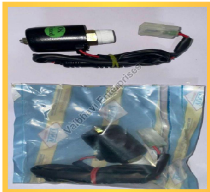
Bajaj Three Wheeler Solenoid Valve