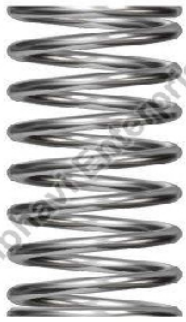
Coil Spiral Metal Spring