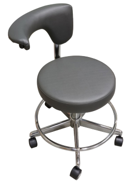
Doctor's Stool Chair