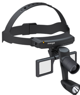
Wireless Head Light