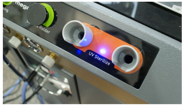
Endoscope Holder with UV Sterilizer