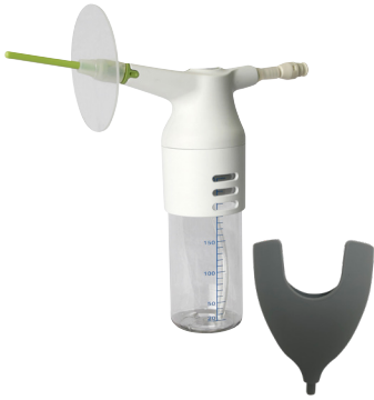
Ear Irrigation Kit