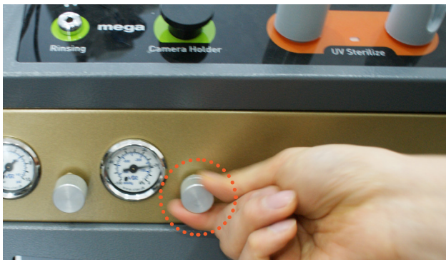
Adjustable Valve for Pressure of Suction and Spray with Gauge