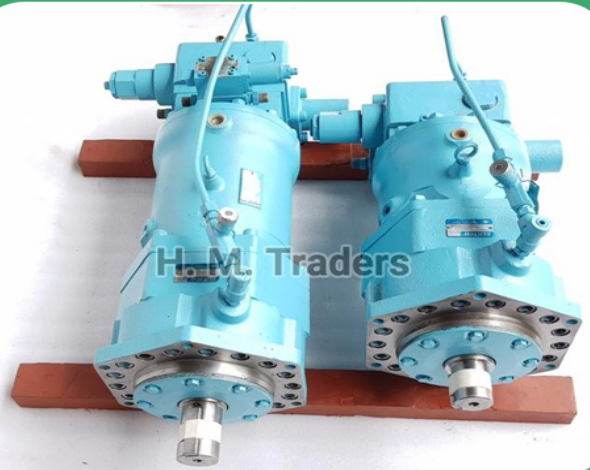
Dowmax Hydraulic Motor