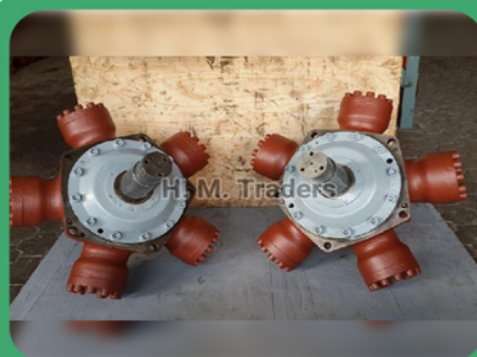
Mitsubishi Hydraulic Pump