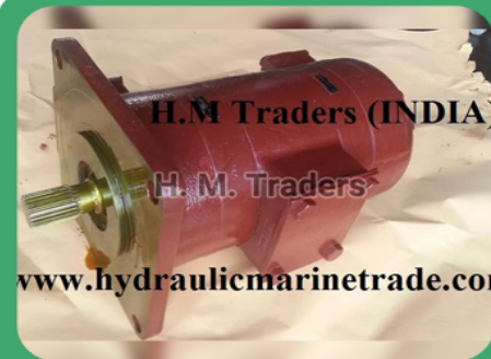
IHI Hydraulic Pump