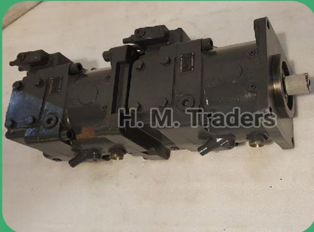
Crane Hydraulic Motor