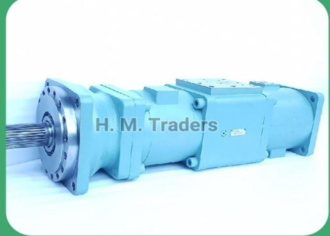
Mitsubishi Hydraulic Motor