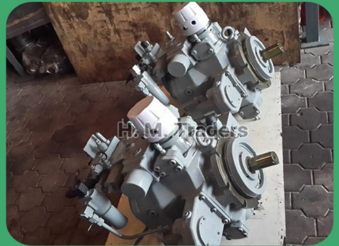
Hydraulic Steering Gear Pump