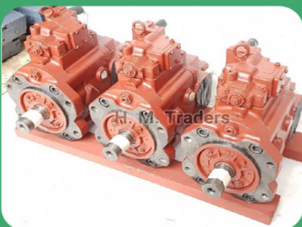
Kawasaki Hydraulic Pump