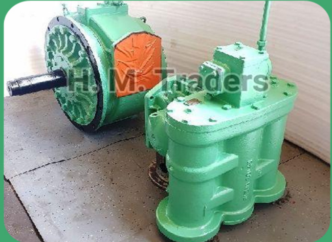
Hatlapa Hydraulic Pump