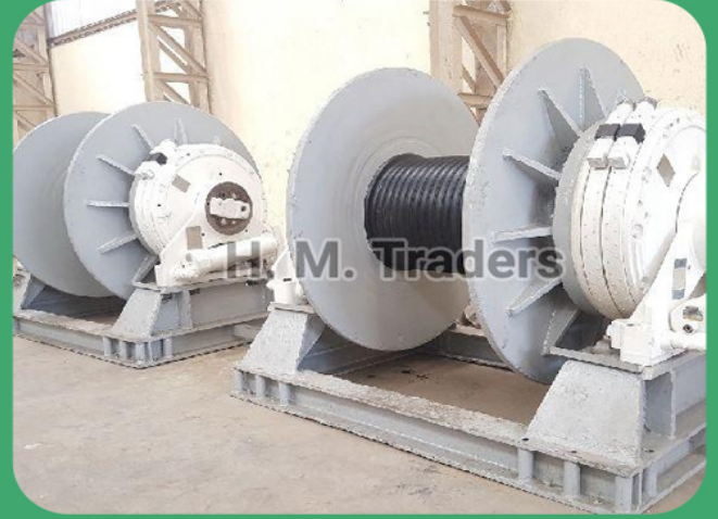
Crane Winch Drum