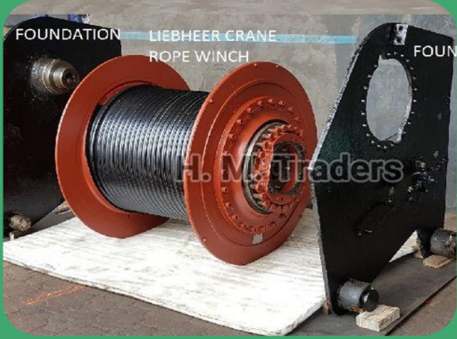
Crane Winch Cable