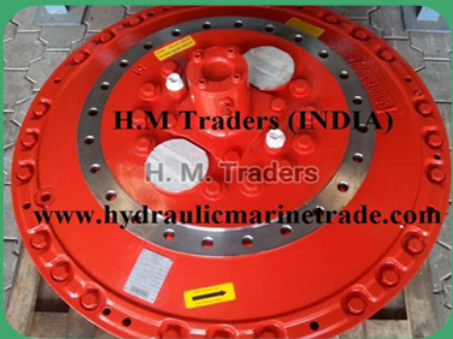
Hagglund Hydraulic Motor