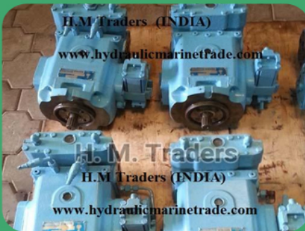
Denison Hydraulic Pump