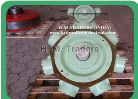
Staffa Hydraulic Motor