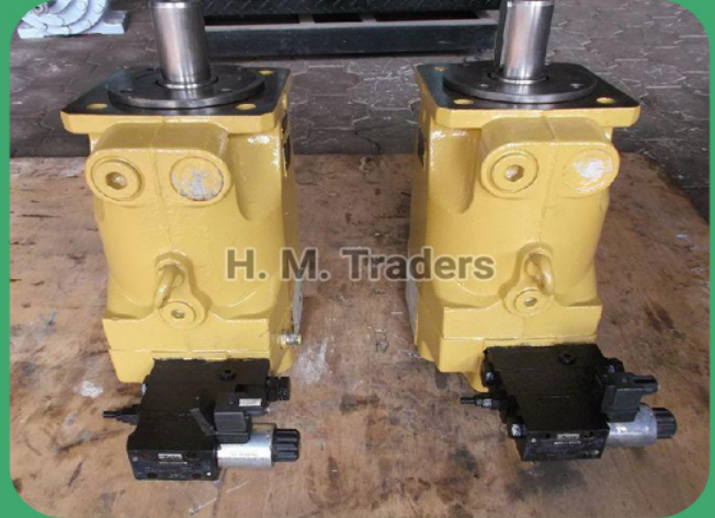
Volvo Hydraulic Pump