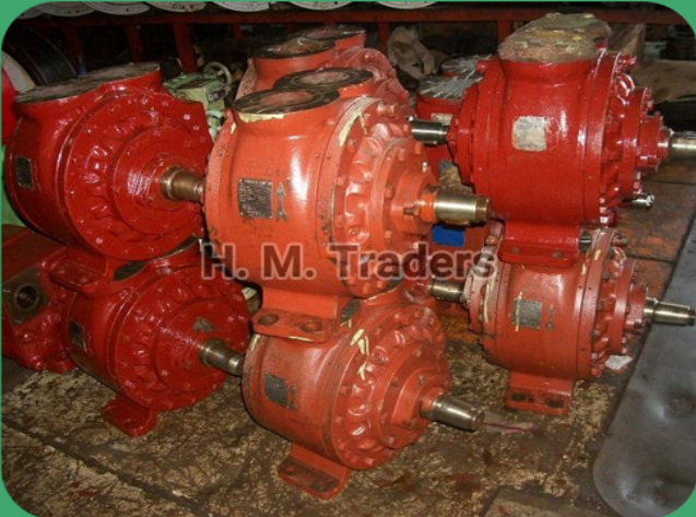
Fukushima Hydraulic Pumps