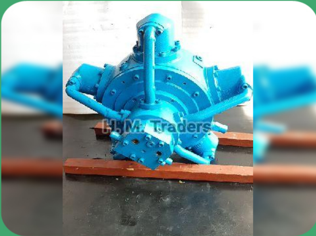
Bauer Hydraulic Motor