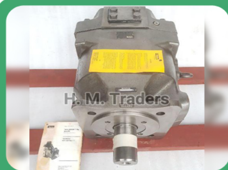
Volvo Hydraulic Motor