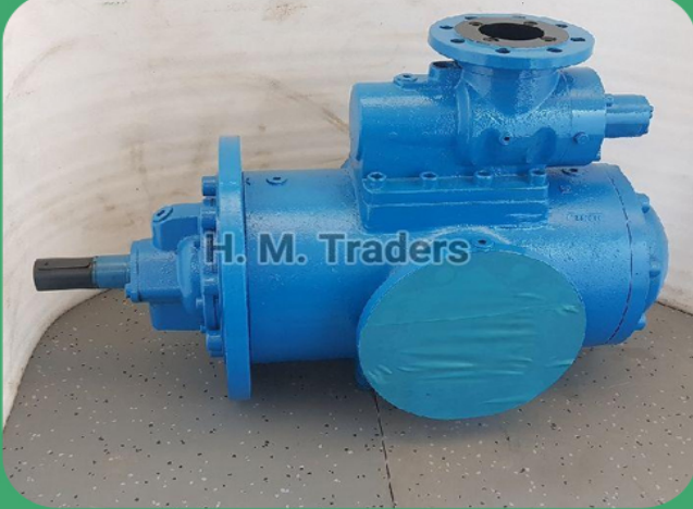
Hatlapa Hydraulic Motor