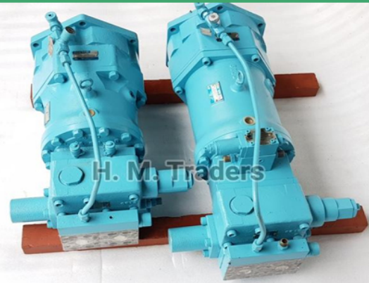
Dowmax Hydraulic Pump