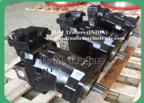
Sundstrand Sauer Danfoss Hydraulic Motor