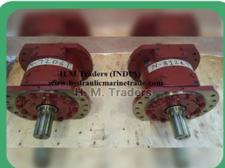
IHI Hydraulic Motor