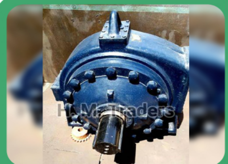
Norwinch Hydraulic Pump