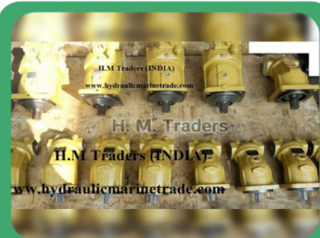
Rexroth Hydraulic Motor