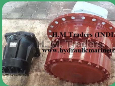
Hoisting Gear Hydraulic Motor