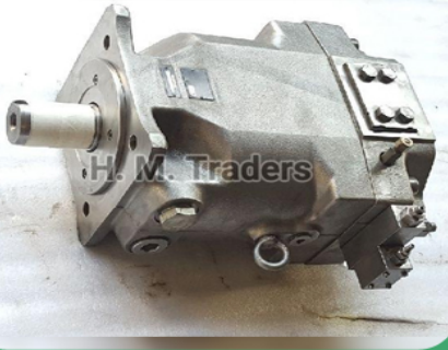
Parker Hydraulic Pump