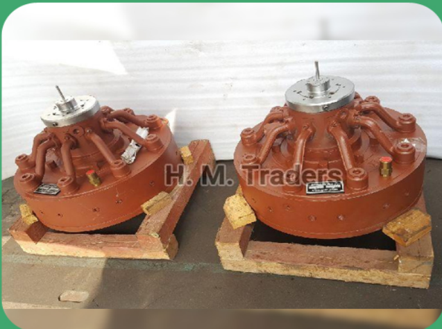
Bauer Hydraulic Pump