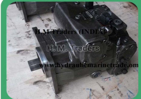
Rexroth Hydraulic Pump