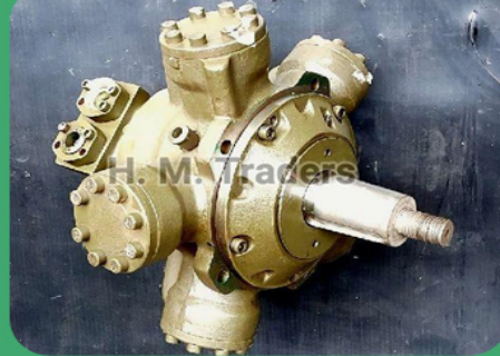
Kayaba Hydraulic Pump