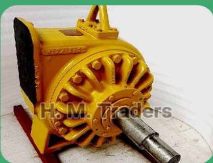
Norwinch Hydraulic Motor