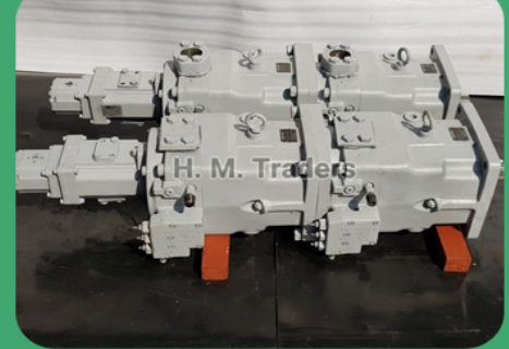
Crane Hydraulic Pump