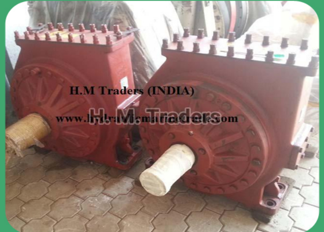
Fukushima Hydraulic Motor