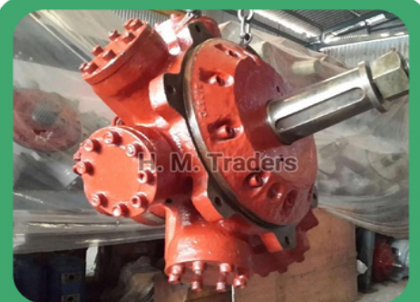
Kayaba Hydraulic Motor