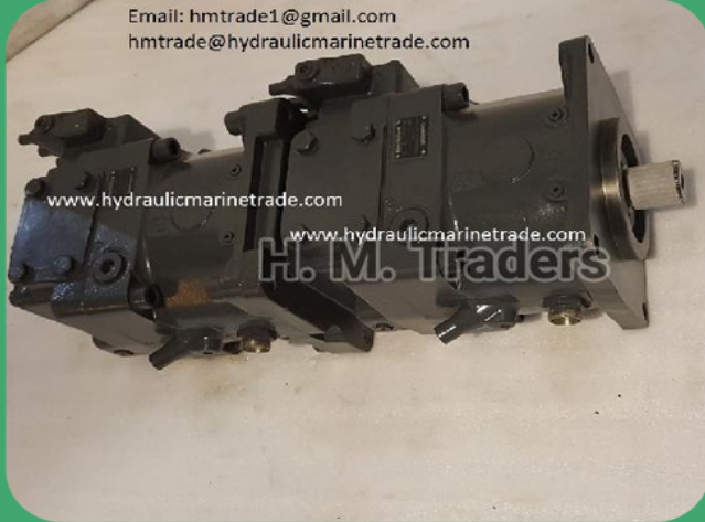
Liebherr Crane Pump