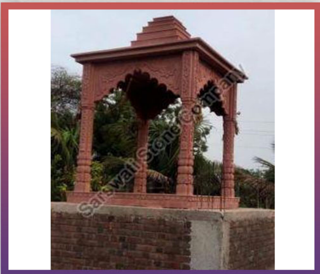
Red Sandstone Temple