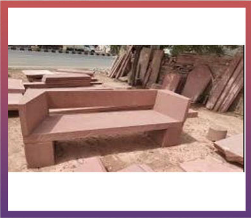
Red Sandstone Bench