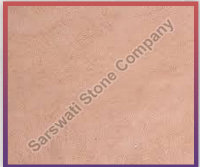
Pink Sandstone Slab