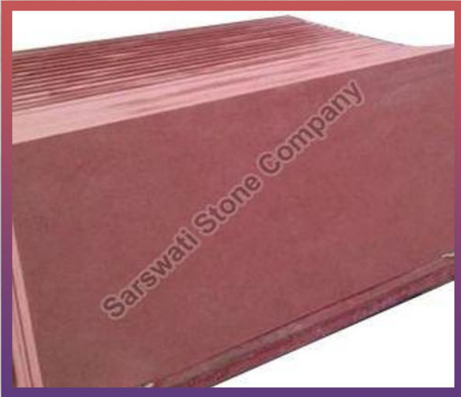
Red Sandstone Slab