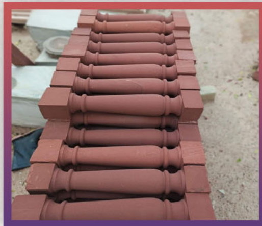
Stone Railing pillars