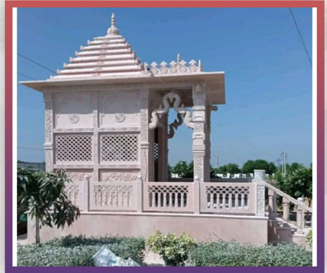
Pink Sandstone Temple 2