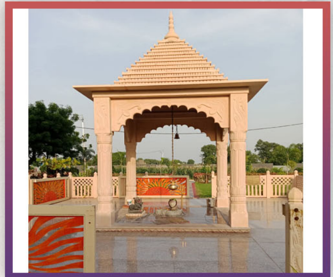
Pink Sandstone Chatri 2