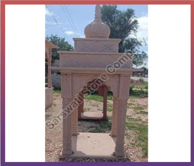
Pink Sandstone Temple