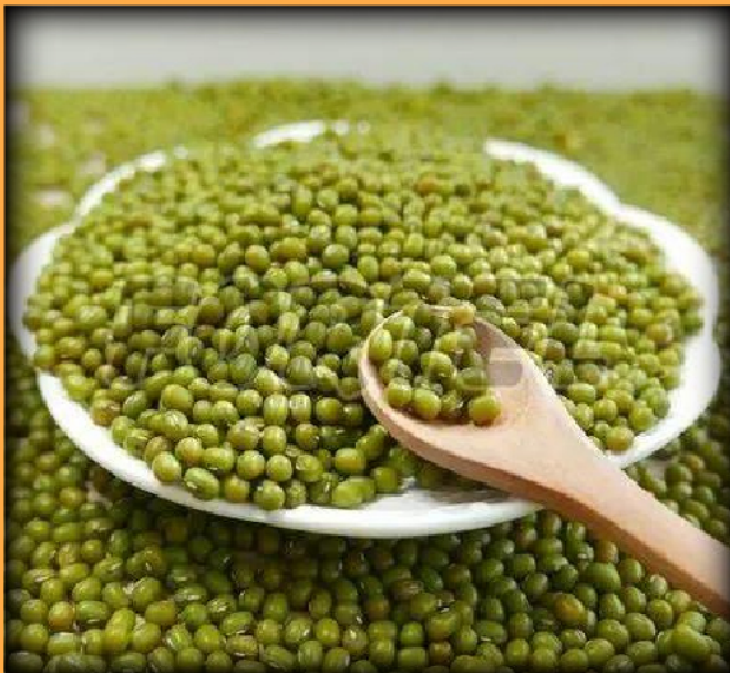
GREEN MUNG BEANS