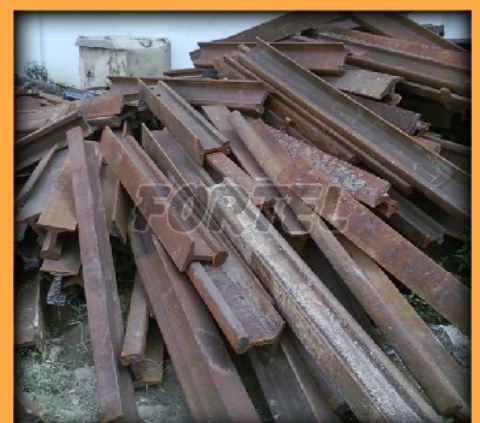
USED RAIL TRACK SCRAP