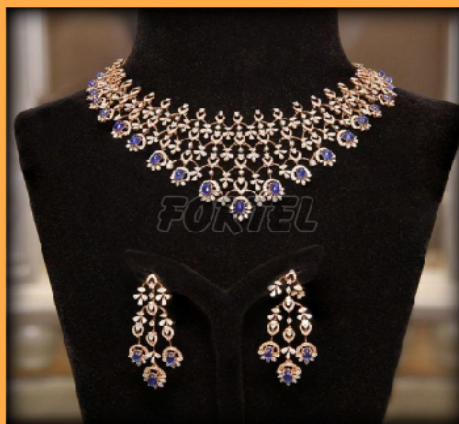
REFINED WHITE SUGAR