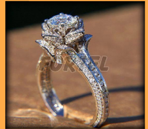
LADIES DIAMOND RING