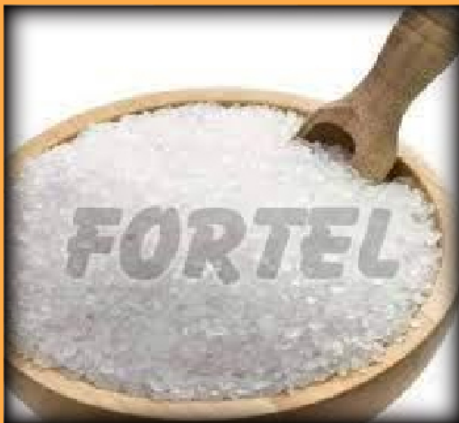
REFINED WHITE SUGAR