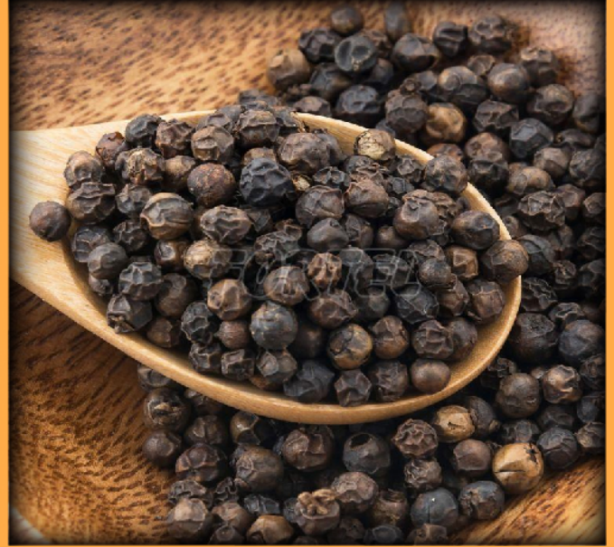
BLACK PEPPER SEEDS