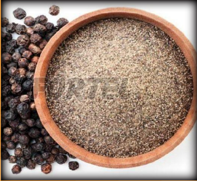
BLACK PEPPER POWDER