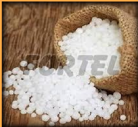
N46 UREA FERTILIZER GRANULES