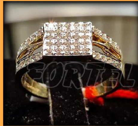
MEN DIAMOND RING