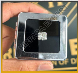
5CT CUSHION LAB GROWN DIAMOND