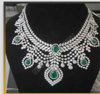
GREENSTONE DESIGNER DIAMOND NECKLACE