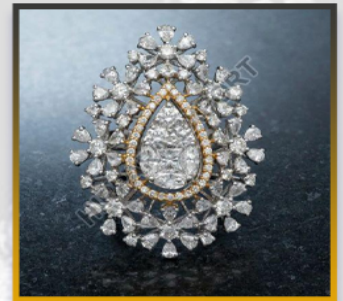
LADIES DIAMOND RING