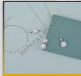
DESIGNER DIAMOND PENDANT SET