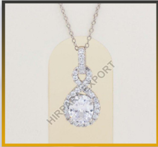
FANCY DIAMOND PENDANT