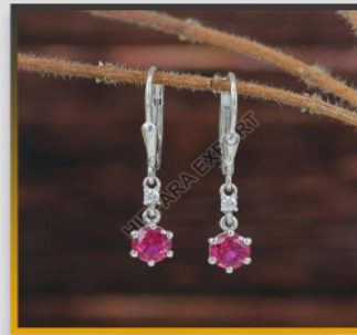
FANCY PINK DIAMOND EARRINGS