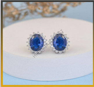
BLUE DIAMOND STUD EARRINGS