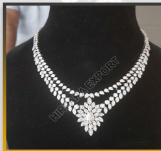
ELEGANT REAL DIAMOND NECKLACE