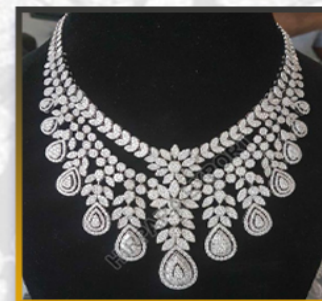
REAL DIAMOND NECKLACE