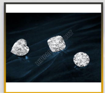
LAB GROWN DIAMONDS