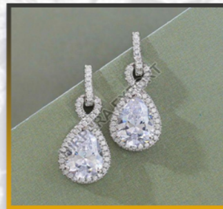
REAL DIAMOND EARRINGS