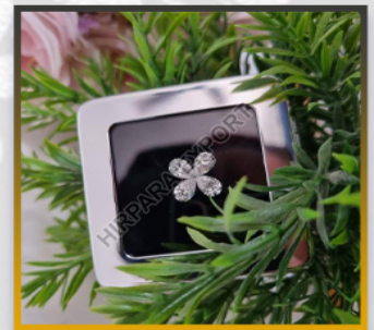
PEAR SHAPE LAB GROWN DIAMOND