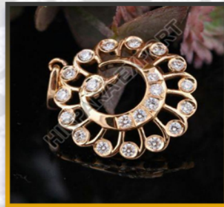
PEACOCK DESIGN DIAMOND RING