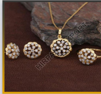
FANCY DIAMOND PENDANT SET