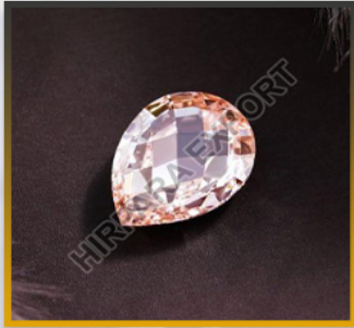
PEARL SHAPE LAB GROWN DIAMOND