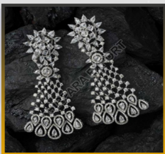
STYLISH DIAMOND EARRINGS