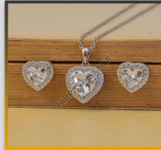
HEART SHAPE DIAMOND PENDANT SET