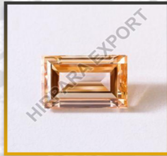
BAGUETTE SHAPE LAB GROWN DIAMOND