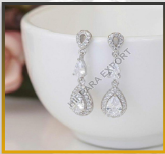
ELEGANT DIAMOND EARRINGS