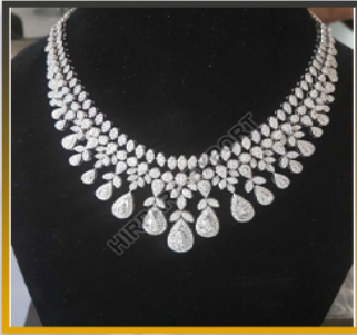
DESIGNER DIAMOND NECKLACE