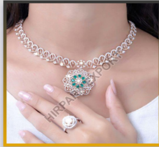
DESIGNER NATURAL DIAMOND NECKLACE