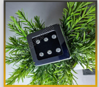
1.50CT ROUND LAB GROWN DIAMOND