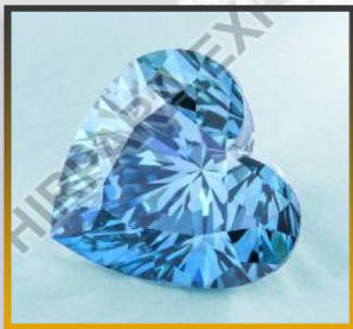
BLUE VVS1 HEART SHAPE POLISHED DIAMOND