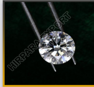
ROUND CUT LAB GROWN DIAMOND