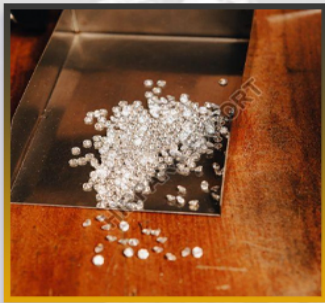
STAR MELEE LAB GROWN DIAMONDS