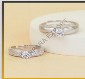
COUPLE BANDS DIAMOND RING