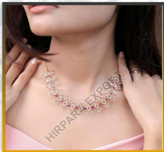
PINK STONE DIAMOND NECKLACE