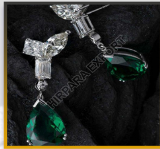
FANCY GREEN DIAMOND EARRINGS