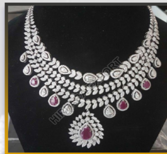
LADIES DIAMOND NECKLACE