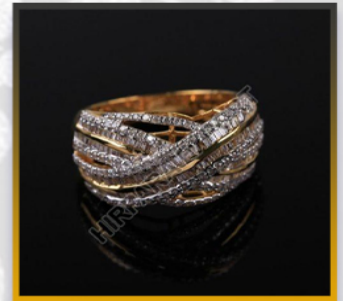
STYLISH DIAMOND RING