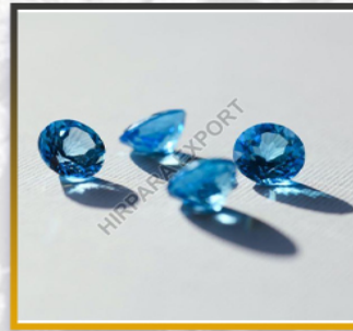
BLUE ROUND SHAPE LAB GROWN DIAMOND