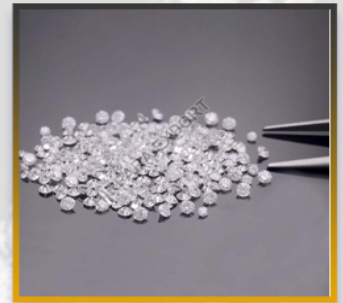
STAR MELEE LOOSE DIAMONDS