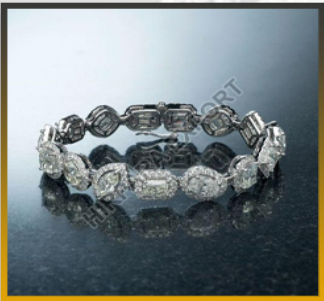
MODERN DIAMOND RING