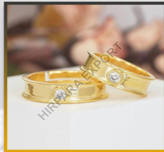
GOLDEN DIAMOND RING