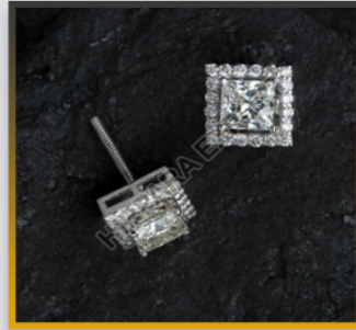
DESIGNER DIAMOND STUD EARRINGS