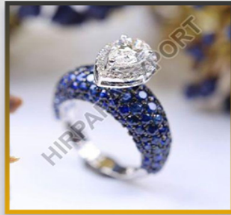
CLASSIC DIAMOND RING