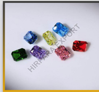
FANCY COLOR DIAMOND