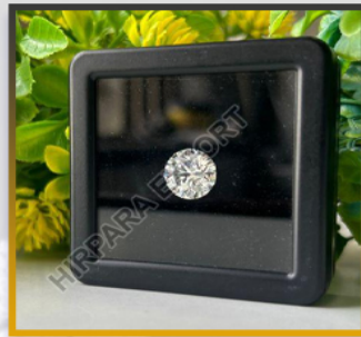
10CT ROUND SHAPE LAB GROWN DIAMOND