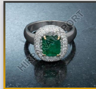
GREEN DIAMOND RING