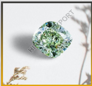
CUSHION SHAPE LAB GROWN DIAMOND