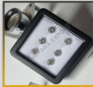
1CT ROUND CUT LAB GROWN DIAMOND