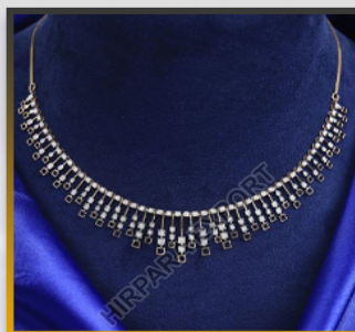
SQUARE PATTERN DIAMOND NECKLACE