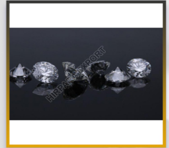
ROUND SHAPE LAB GROWN DIAMOND