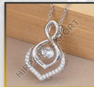
DESIGNER DIAMOND PENDANT