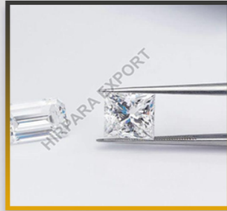
PRINCESS AND BAGUETTE LAB GROWN DIAMOND