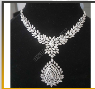
PARTY WEAR DIAMOND NECKLACE