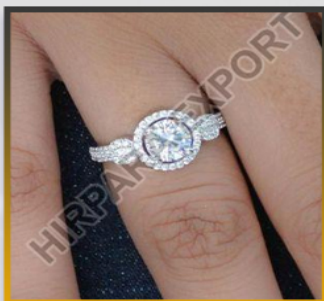
ELEGANT DIAMOND RING