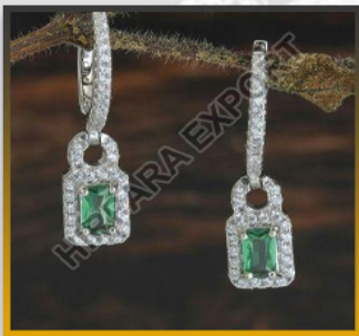
LADIES DIAMOND EARRINGS