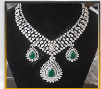
GREENSTONE REAL DIAMOND NECKLACE