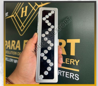
3 CT PRINCESS CUT LAB GROWN DIAMOND