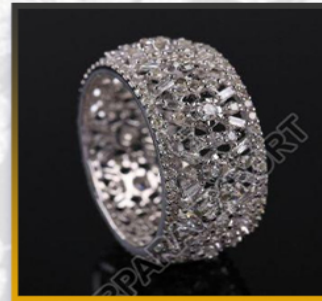
REAL DIAMOND RING