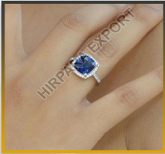
BLUE DIAMOND RING