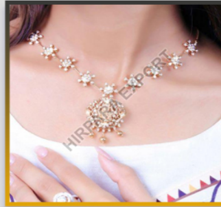
DESIGNER REAL DIAMOND NECKLACE