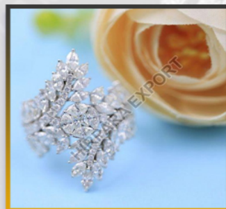
ENGAGEMENT DIAMOND RING