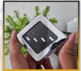
CHOKI LAB GROWN DIAMOND