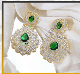
PARTY WEAR DIAMOND EARRINGS