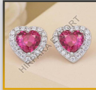
HEART SHAPE DIAMOND STUD EARRINGS