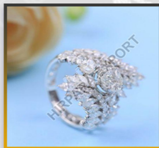
ANTIQUE DIAMOND RING