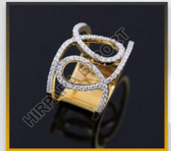
DESIGNER DIAMOND RING