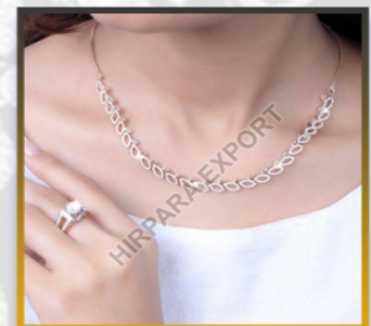
NATURAL DIAMOND NECKLACE