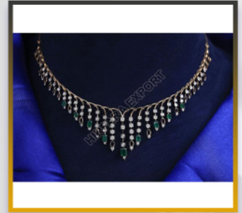
ELEGANT NATURAL DIAMOND NECKLACE