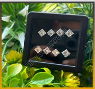
1 CT PRINCESS CUT LAB GROWN DIAMOND