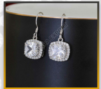
SQUARE DIAMOND EARRINGS