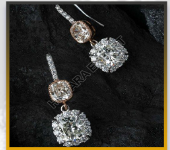
MODERN DIAMOND EARRINGS