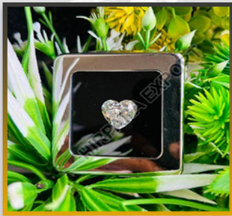
10CT HEART SHAPE LAB GROWN DIAMOND