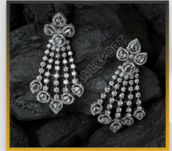
DESIGNER DIAMOND EARRINGS