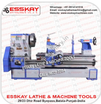
Ekl-1018 10 Feet Heavy Duty Lathe Machine