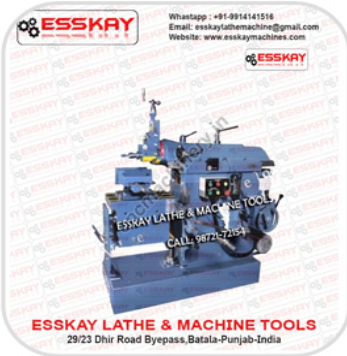
450mm Shaping Machine