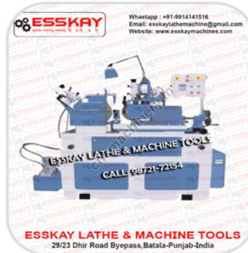
Centerless Grinder Machine