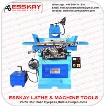
12 X 24inch Heavy Duty Surface Grinding Machine