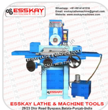
Micro Feed Surface Grinding Machine