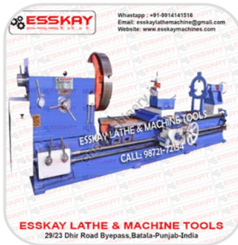
Ekl-1624 Pb 16 Feet Planner Bed Heavy Duty Lathe Machine