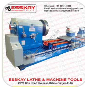
Ekl-1626 Hd 16 Feet Heavy Duty Roll Turning Lathe Machine