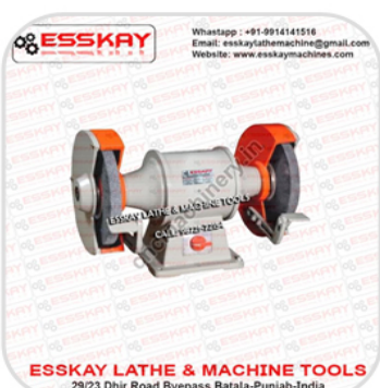
Pedestal Grinder Machine