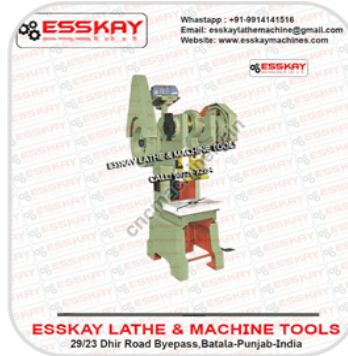
C Type Power Press Machine