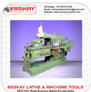
18inch Industrial Shaping Machine