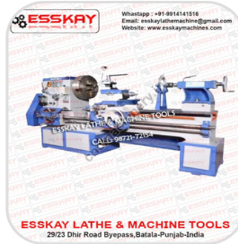
Ekl-816 At 8 Feet Heavy Duty Lathe Machine