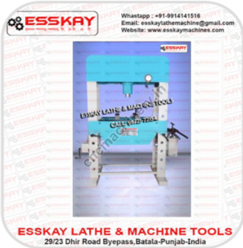
60 Ton Hand Operated Hydraulic Press Machine