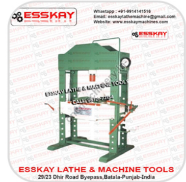
Hand Operated Hydraulic Press Machine