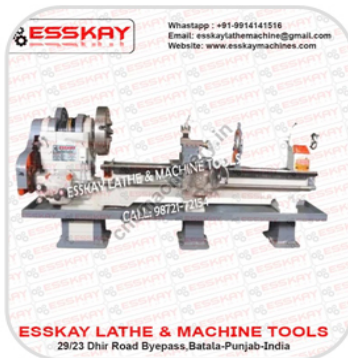
Ekl-1213 Cp 12 Feet Heavy Duty Lathe Machine