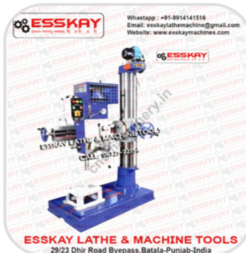
Single Column Radial Drilling Machine