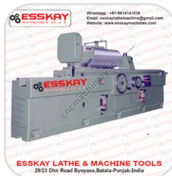
Roll Grinder Machine