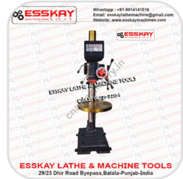
40mm Pillar Drill Machine