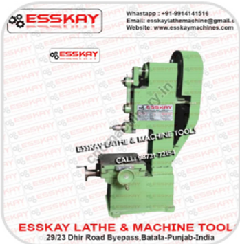
150mm Medium Duty Slotting Machine