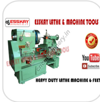
Ekl-614 Hd 6 Feet Heavy Duty Lathe Machine