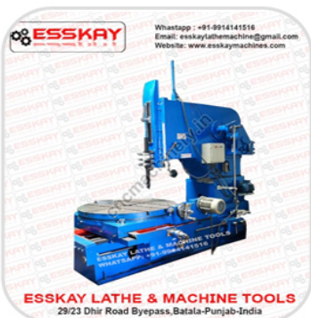
500mm Slotting Machine