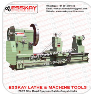
Ekl- 2026 Rt 20 Feet Heavy Duty Roll Turning Lathe Machine