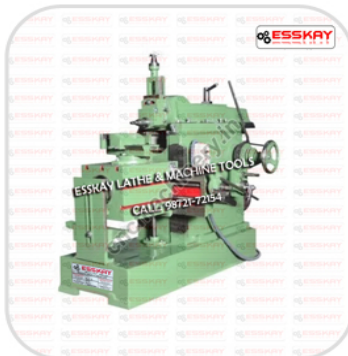
18inches Shaper Machine