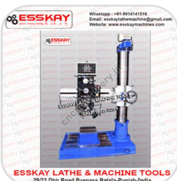
Semi-Automatic Radial Drilling Machine