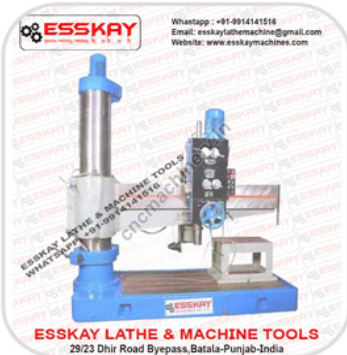
75mm Radial Drilling Machine