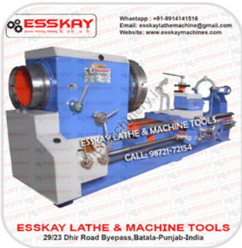
12 Feet Heavy Duty Big Bore Lathe Machine