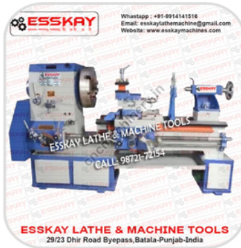
B-200 8 Feet Big Heavy Duty Bore Lathe Machine