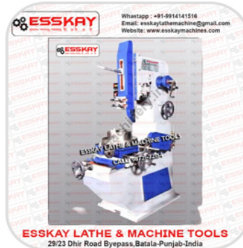
16 Inch Heavy Duty Slotting Machine