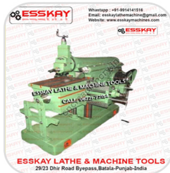
24inch Heavy Duty Shaping Machine