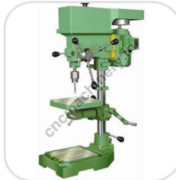
Bench Drilling Machine