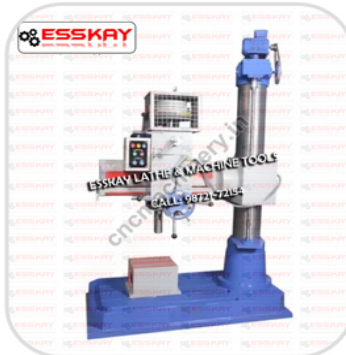
Auto Feed Heavy Duty Radial Drill Machine