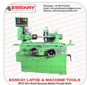
Manual Cylindrical Grinder Machine