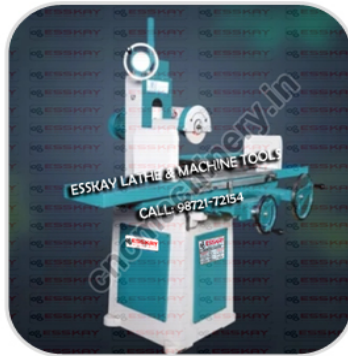
200 x 500mm Surface Grinder Machine