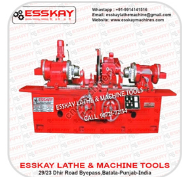
Crank Shaft Grinding Machine