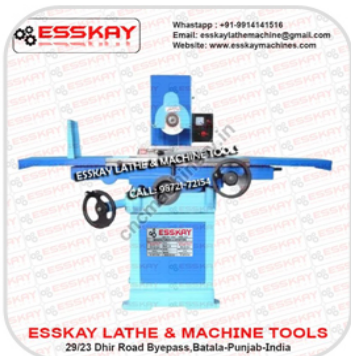
Auto Feed Surface Grinding Machine