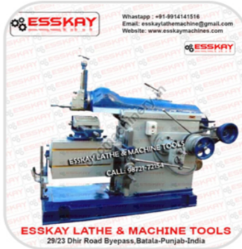
Workshop Shaping Machine