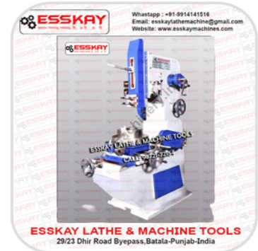
300mm Heavy Duty Slotting Machine