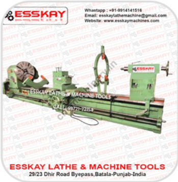
Ekl-2432 Rg 24 Feet Heavy Duty Roll Grooving Lathe Machine