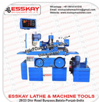
Automatic Hydraulic Cylindrical Grinder Machine