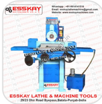
200x500mm Esskay Surface Grinder Machine