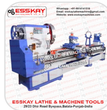
Ekl-1422 St 14 Feet Heavy Duty Shaft Turning Lathe Machine