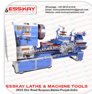
EKL-1016 10 Feet Heavy Duty Lathe Machine