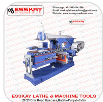
36Inche Heavy Duty Shaping Machine