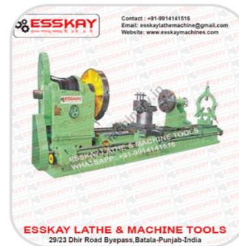
Ekl-2042 Rg Heavy Duty Roller Grooving Lathe Machine