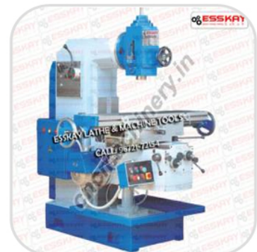
Vertical Milling Machine