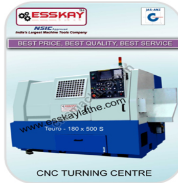
CNC Turning Lathe Machine