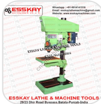
40mm Heavy Duty Pillar Drilling Machine