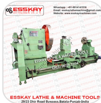
Essal-2036 Gh 20 Feet Center Lathe Machine