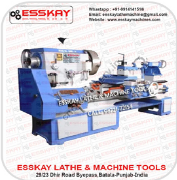
EKL-915 CP 9 Feet Heavy Duty Lathe Machine