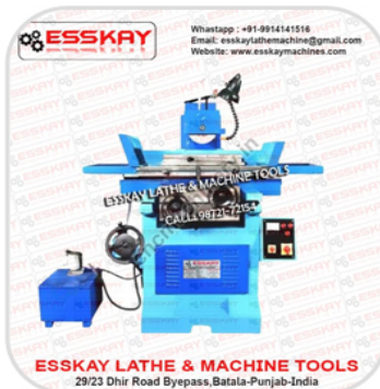
Hydraulic Surface Grinding Machine