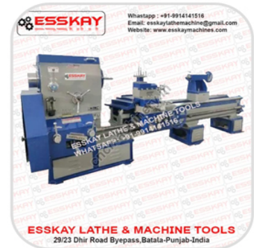
Special Purpose Lathe Machine