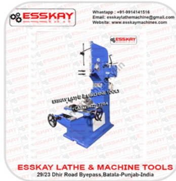
Medium Duty Slotting Machine