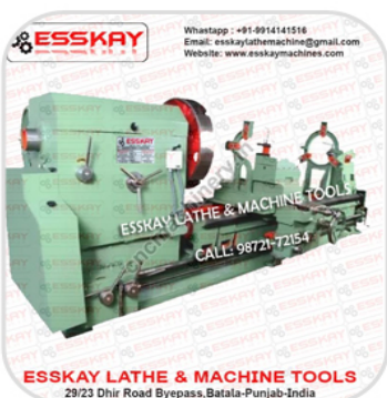
Ekl-1624 16 Feet Heavy Duty Lathe Machine