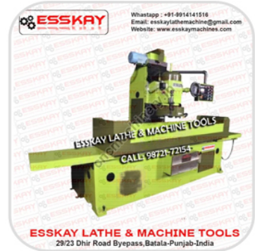
300x1500mm Hydraulic Segment Grinder Machine