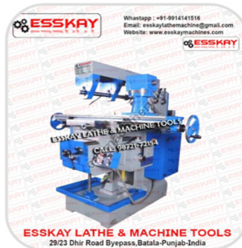
Universal Milling Machine