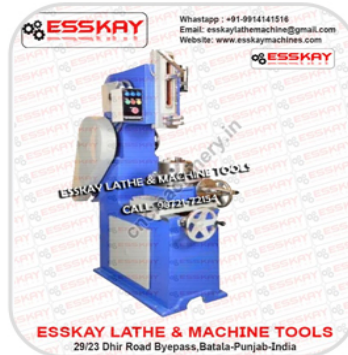
200mm Heavy Duty Slotting Machine