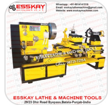
Ekl-816- Hd 8 Feet Heavy Duty Lathe Machine