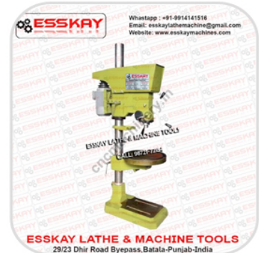
Heavy Duty Pillar Drilling Machine