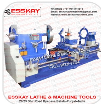
Ekl-1220 P 12 Feet Heavy Duty Precision Lathe Machine