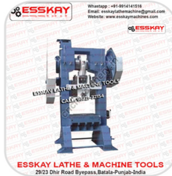
H Type Power Press Machine