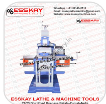
12Inch Medium Duty Shaping Machines