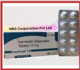
Iverheal 12 Tablets