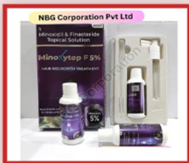
Minoxityp F5% Topical Solution