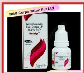
Moxisign Eye Drops