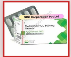
Glycoheal 500 Tablets