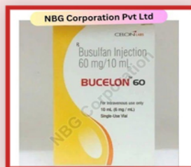
Bucelon 60 Injection