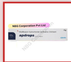
Apdrops Eye Ointment