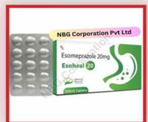
Esoheal 20 Tablets