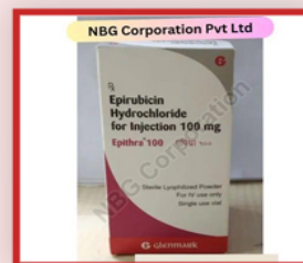
Epithra 100 Injection