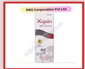
Xgain Hair Serum