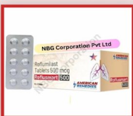
Roflumar 500 Tablets