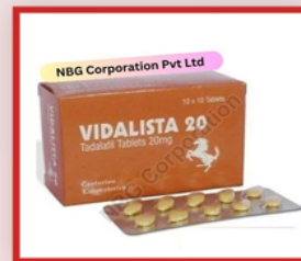
Vidalista 20 Tablets