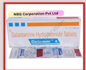
Galamer 4 Tablets