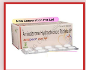
Amipace 200 Tablets