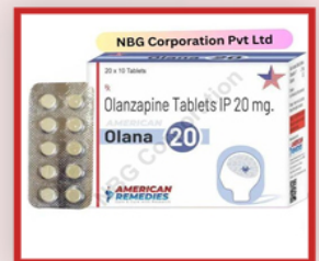
Olana 20 Tablets