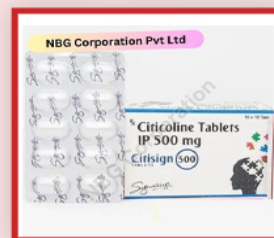
Citisign 500 Tablets