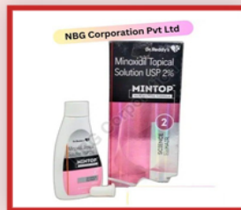
Mintop Topical Solution