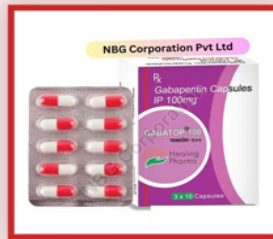
Gabatop 100 Capsules