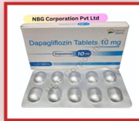
Dapasmart 10 Tablets