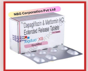
Xigduo XR Tablets