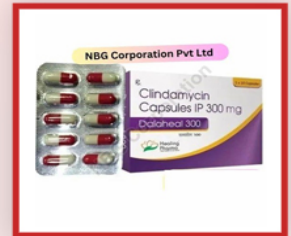
Dalaheal 300 Capsules