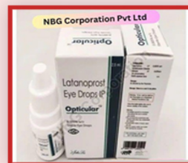
Opticular Eye Drops