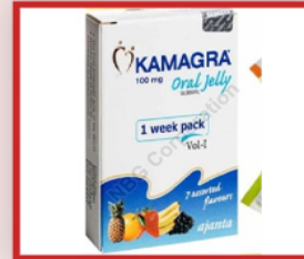
Kamagra Oral Jelly