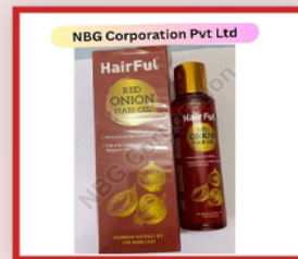
Red Onion Hair Oil