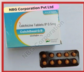
Colchiheal 0.5 Tablets