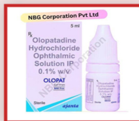
Olopat Eye Drops