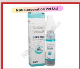
Ciplox Eye Drops