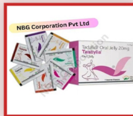
Tastytia Oral Jelly