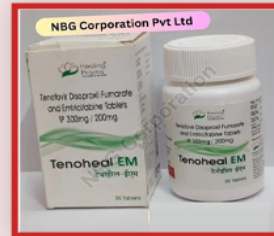
Tanoheal EM Tablets