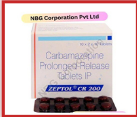
Zeptol CR 200 Tablets