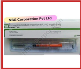
LMWX 40 Injection