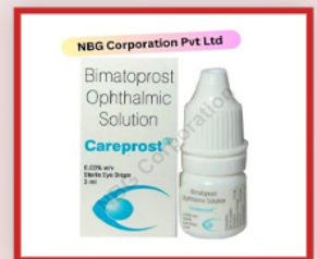
Careprost Eye Drops