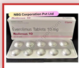
Rolimus 10 Tablets