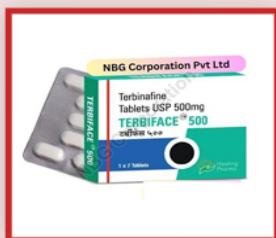
Terbiface 500 Tablets