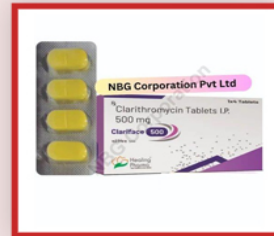
Clariface 500 Tablets