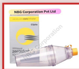
Zerostat Spacer Inhaler