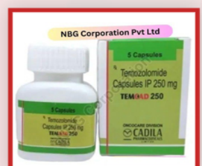
Temoad 250 Capsules