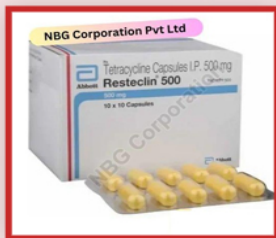
Resteclin 500 Capsules