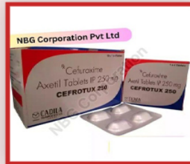
Cefrotux 250 Tablets