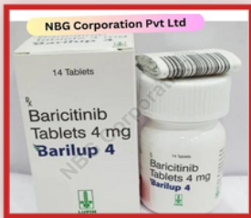
Barilup 4 Tablets