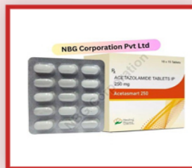
Acetasmart 250 Tablets