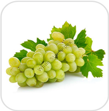
Organic Green Grapes