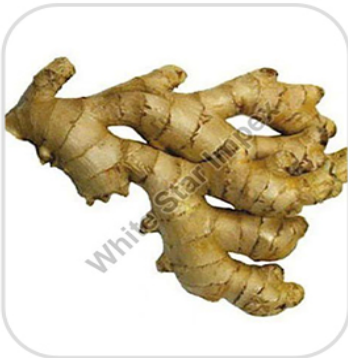
Organic Fresh Ginger