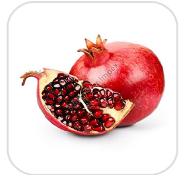
A Grade Fresh Pomegranate