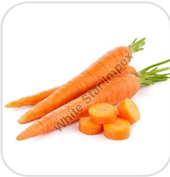
Fresh Orange Carrot