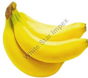
Organic Yellow Banana