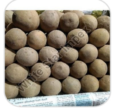
Organic Fresh Chikoo