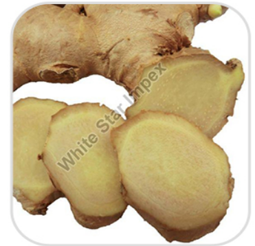
Fresh a Grade Ginger Root