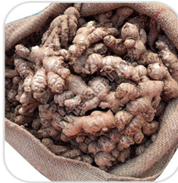
Organic Raw Ginger