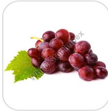
A Grade Fresh Red Grapes