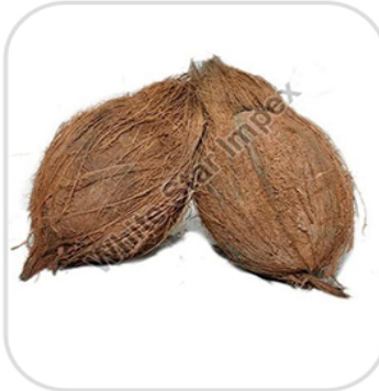
Semi Husked Coconut