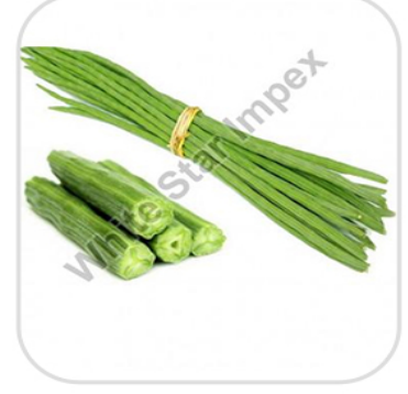
Organic Fresh Drumstick