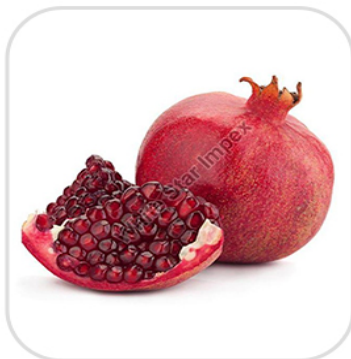
Fresh Indian Pomegranate