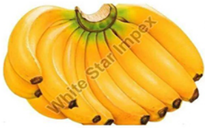
A Grade Fresh Banana