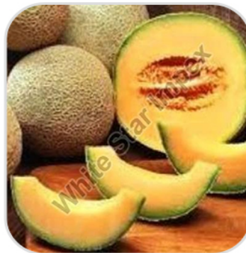
Indian Fresh Muskmelon