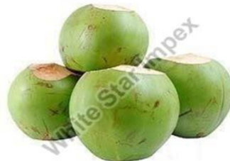
Fresh Tender Coconut