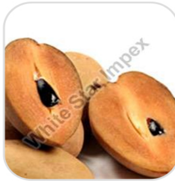
Natural Fresh Sapodilla