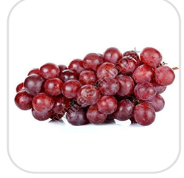
Fresh Red Seedless Grapes