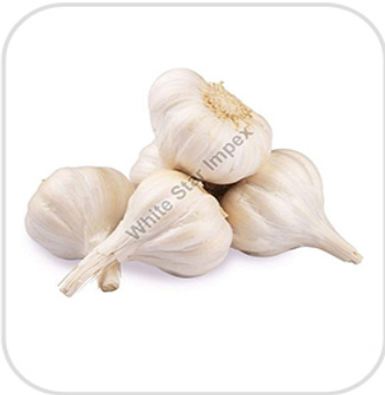
A Grade White Fresh Garlic