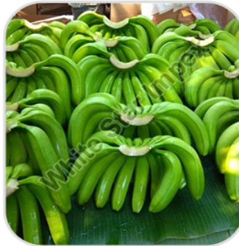
Fresh Green G9 Banana