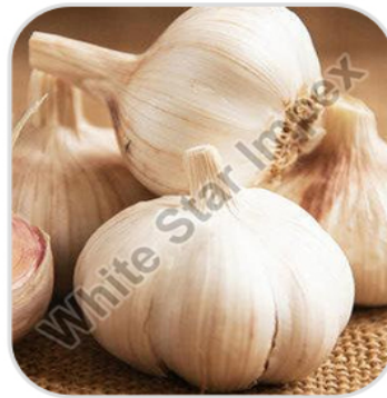
Organic Fresh Garlic