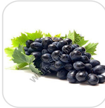
Fresh Black Grapes