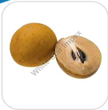
A Grade Fresh Sapodilla