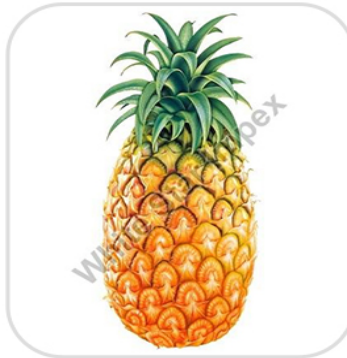
Organic Fresh Pineapple