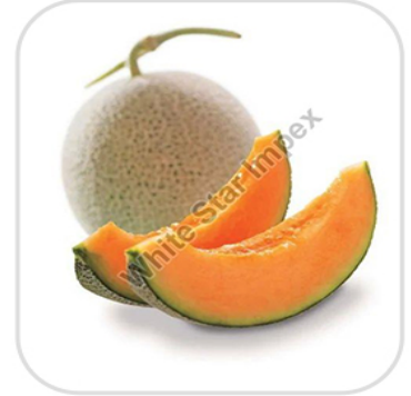
A Grade Fresh Muskmelon