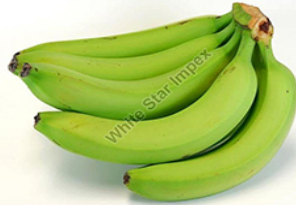
Fresh Green Bananas