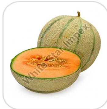
Fresh Sweet Muskmelon