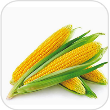
Maize seed image attached