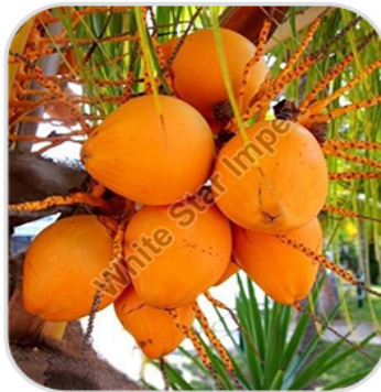
Orange Tender Coconut