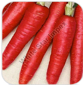
A Grade Fresh Carrot