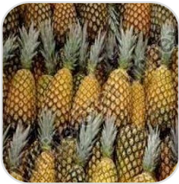
A Grade Fresh Pineapple