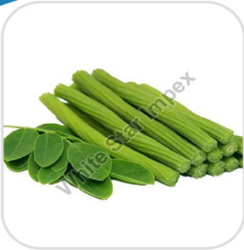
A Grade Fresh Drumstick