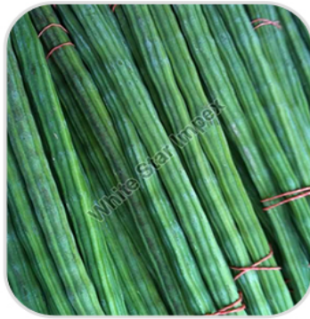
Fresh Natural Drumstick