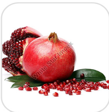
Export Quality Pomegranate