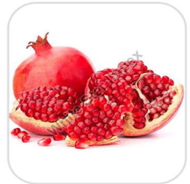
Fresh Natural Pomegranate