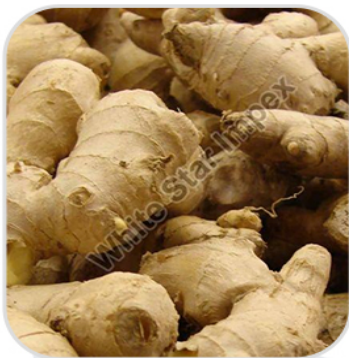
Natural Fresh Ginger