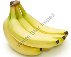
Natural Fresh Banana