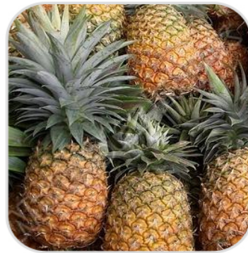
Best Quality Fresh Pineapple