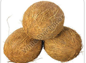
Fully Husked Coconut