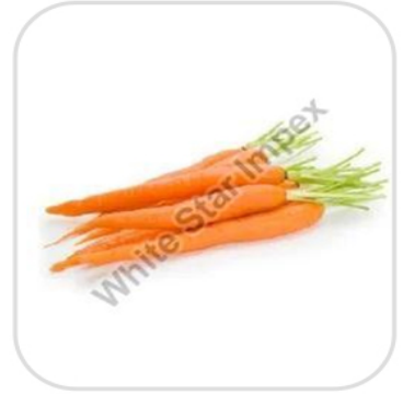
Organic Fresh Carrot