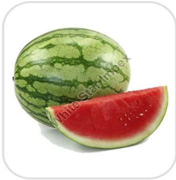
A Grade Fresh Watermelon