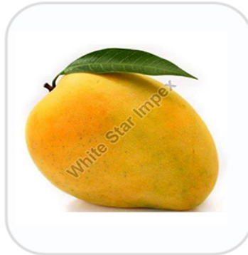
Fresh Alphonso Mango