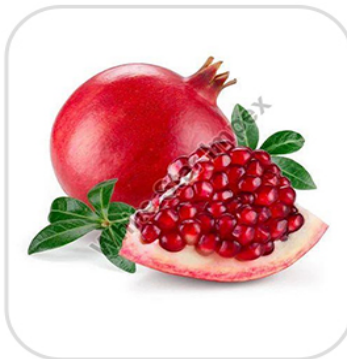
Fresh Juicy Pomegranate