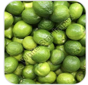
A Grade Fresh Lemon