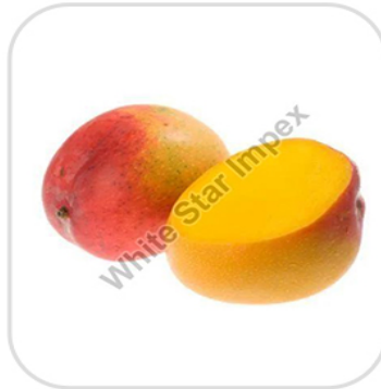
A Grade Fresh Mango