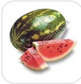
Fresh Natural Watermelon