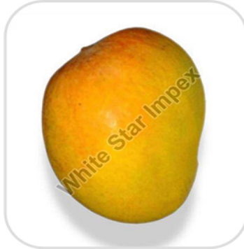
Organic Totapuri Mango