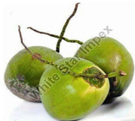
A Grade Solid Green Tender Coconut