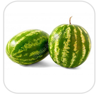
Fresh Organic Watermelon