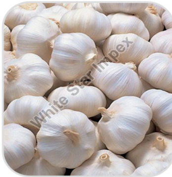
Natural Fresh Garlic