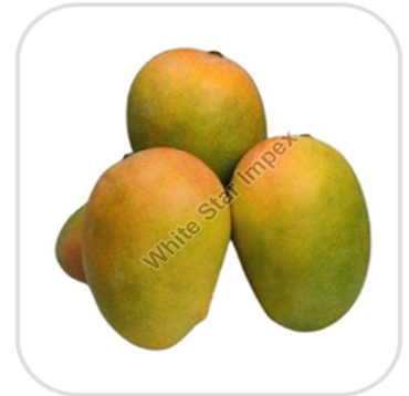
Fresh Kesar Mango