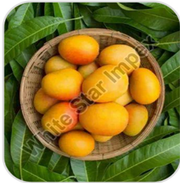
Natural Fresh Mango