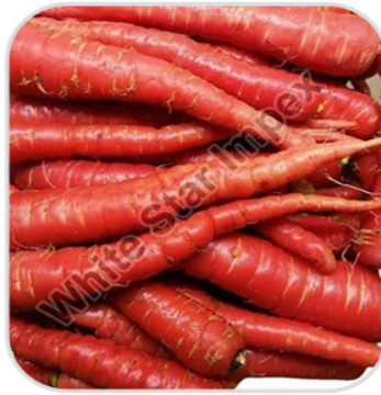
Fresh Red Carrot