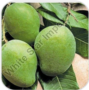
Green Organic Raw Mango