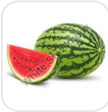
Fresh Green Watermelon