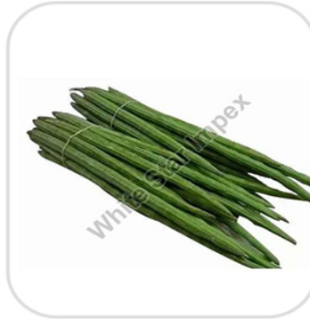
Natural Green Drumstick