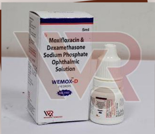
Wemox-D Eye Drops