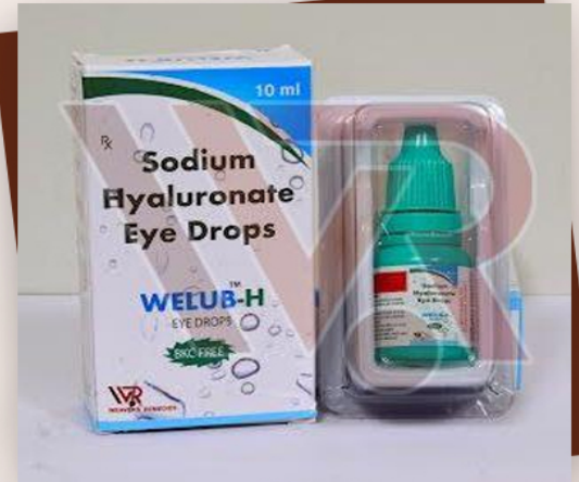
Welub-H Eye Drops