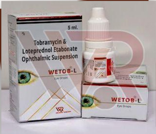
Wetob-L Eye Drops