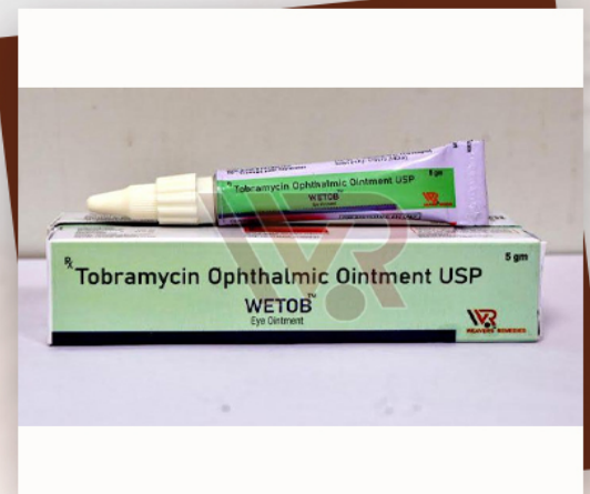
Wetob Eye Ointment