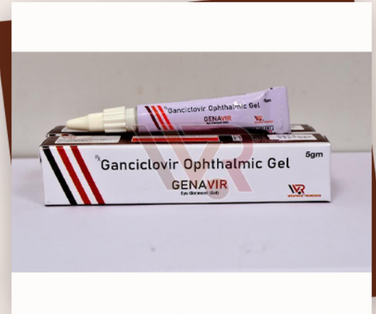
Genavir Eye Ointment