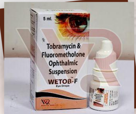
Wetob-F Eye Drops