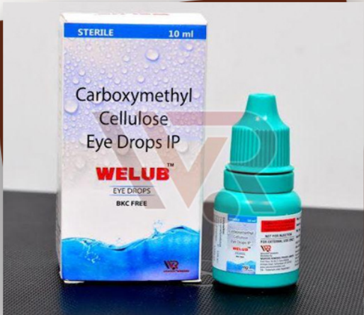
Welub Eye Drops