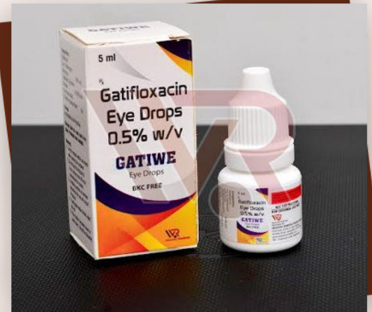
Gatiwe Eye Drops