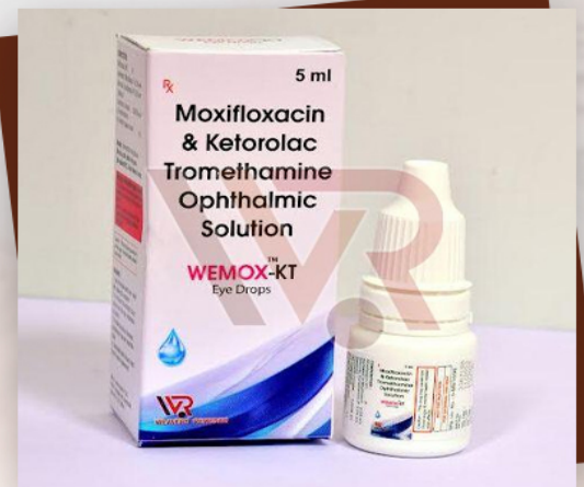
Wemox-KT Eye Drops