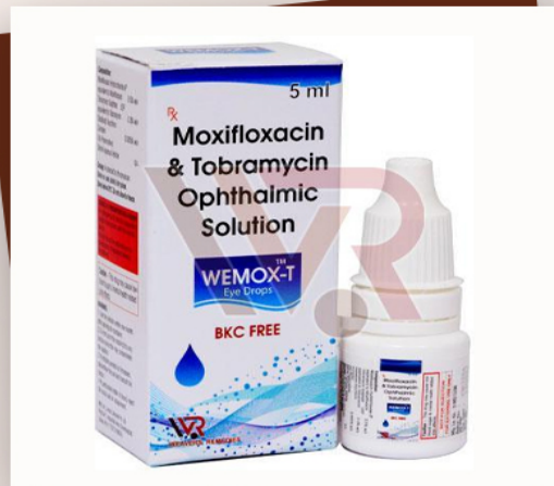
Wemox-T Eye Drops