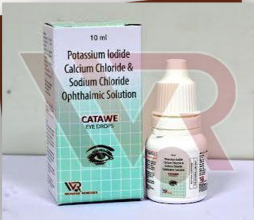
Catawe Eye Drops