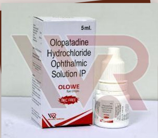
Olowe Eye Drops