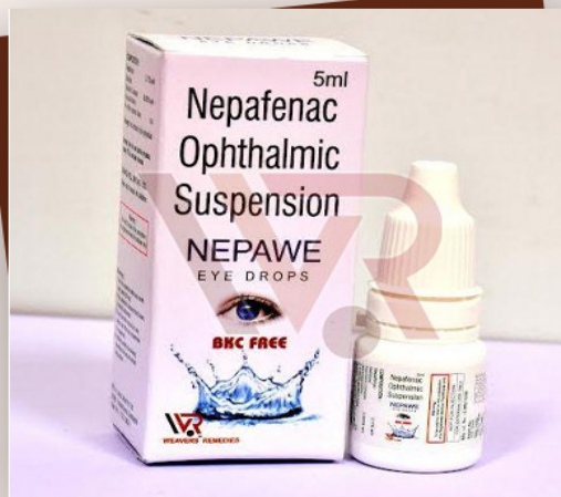
Nepawe Eye Drops