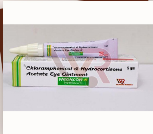
Wechlor-H Eye Ointment