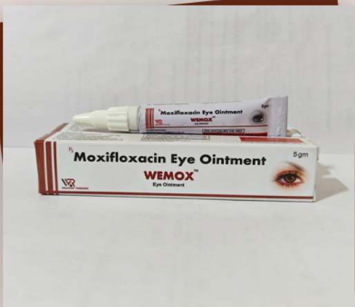
Wemox Eye Ointment