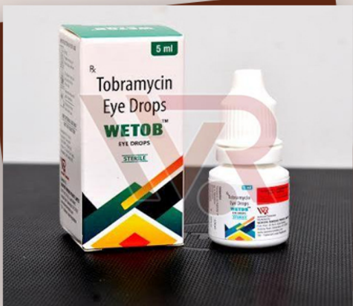
Wetob Eye Drops