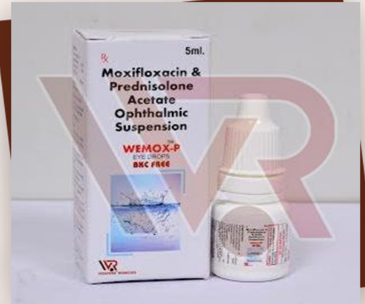
Wemox-P Eye Drops