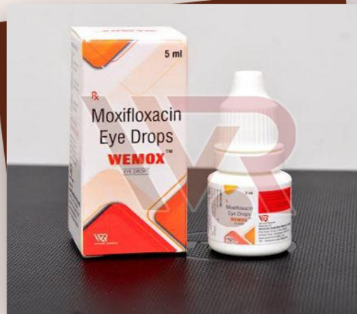
Wemox Eye Drops