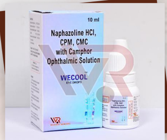
Wecool Eye Drops