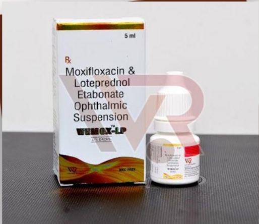
Wemox-LP Eye Drops