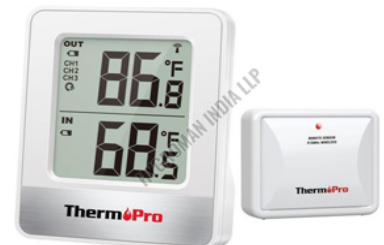
ThermoPro TP200B Indoor and Outdoor Digital Thermo Hygrometer