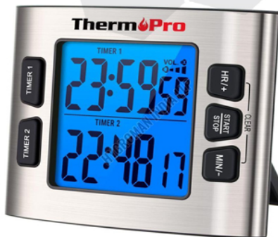
ThermoPro TM02 Multifunction Digital Kitchen Timer with Alarm