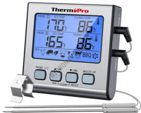
Digital Dual Wired Probe Food Thermometer