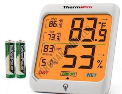
Digital thermo hygrometer