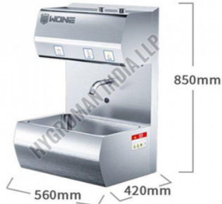
Hand Hygiene Station