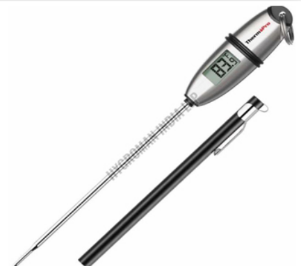
Pen Type Food Thermometer