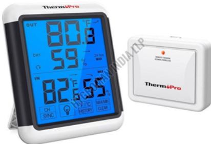
Digital Indoor Outdoor thermo hygrometer