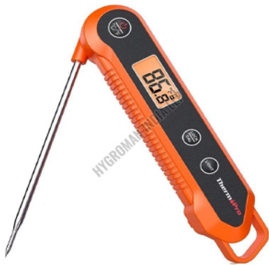
Digital Waterproof Food Thermometer