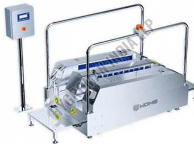
PBW-61 Boot Cleaner Station