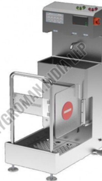
PBW-41E Personnel Hygiene Station