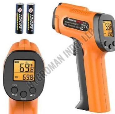
Gun Type Digital Infrared Thermometer