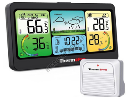
ThermoPro TP280B Digital Weather Station