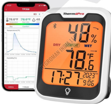
Bluetooth Digital Thermo Hygrometer