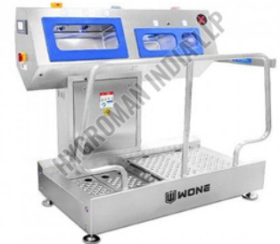
PBW-24 Personnel Hygiene Station