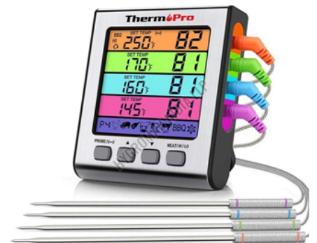
Digital Wired Probe Food Thermometer