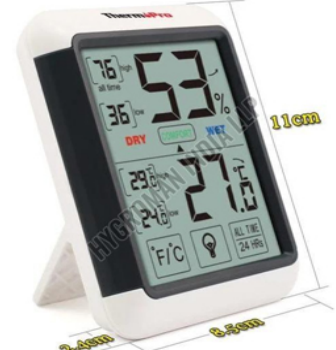
Digital humidity indicator