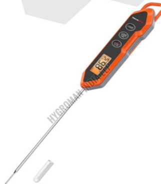
Digital Instant Read Food Thermometer