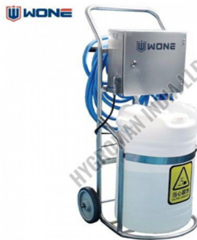
Foam cleaning machine