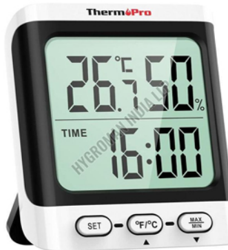
Digital Indoor Thermo Hygrometer with Clock