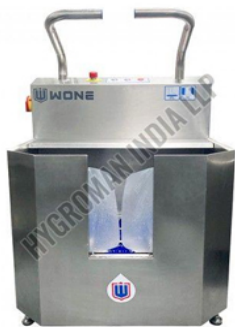
PBW-31W Automatic Boot Cleaner Station