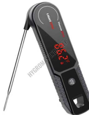
lightning foldable thermometer