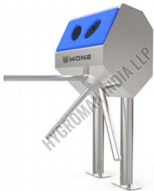
PHS-11T Hand Disinfection Turnstile Station