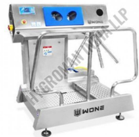
PHB-21T Hygiene Station