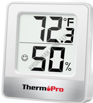
Indoor thermo hygrometer