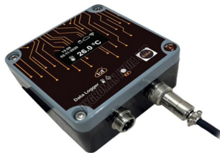
Humidity Data Logger