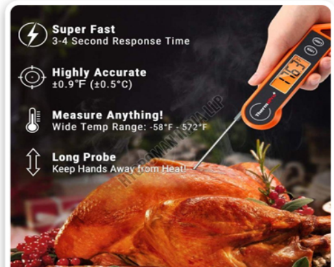
Digital Waterproof Foldable Food Thermometer