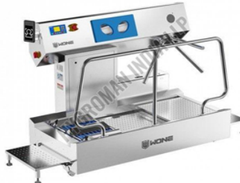
PBW-23 Personnel Hygiene Station