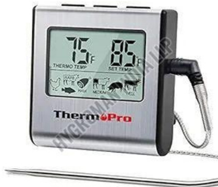
Digital Wired Probe Food Oven Thermometer