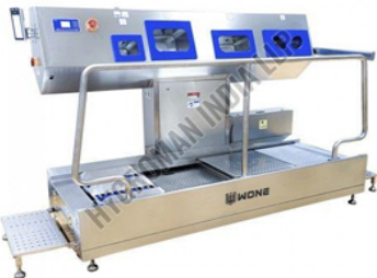
PBW-25 Personnel Hygiene Station