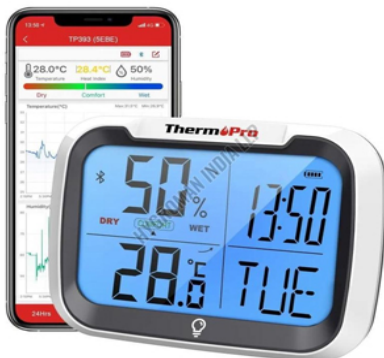
Digital Thermo Hygrometer with Bluetooth Connectivity for Mobile App