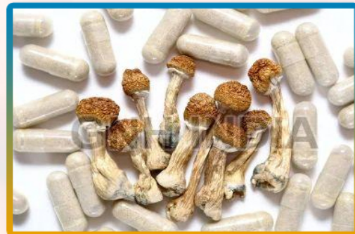
Exxua Gepirone Tablets