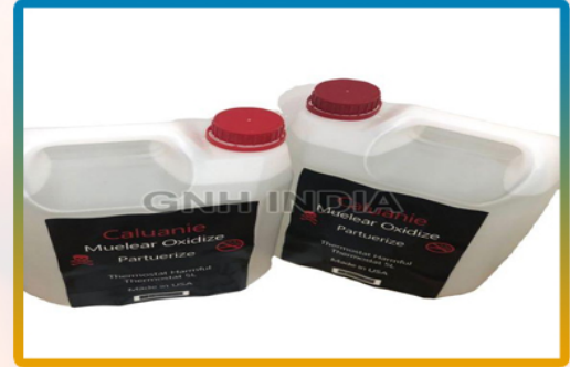
Caluanie Muelear Oxidize Liquid