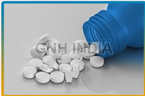
Tranylcypromine Sulfate Tablets