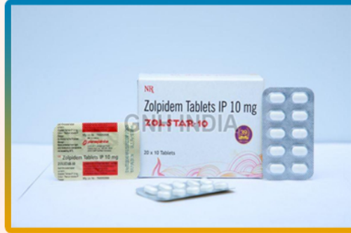
10mg Zolpidem Tartrate Tablets