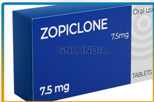
Zopiclone Imovane Tablets