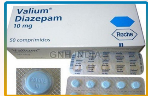
Buy Valium Diazepam 10mg