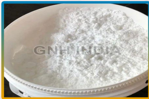
CBD Isolate Powder