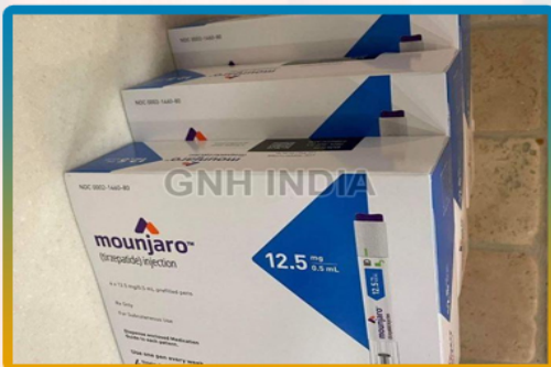
Mounjaro Tirzepatide Injection