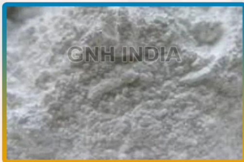
Adderall XR 30 MG Capsules