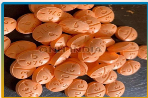
Adderall XR 30 MG Capsules