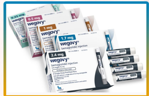
Wegovy (semaglutide) injection