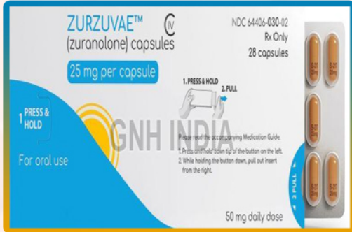
Zurzuvae Zuranolone Capsules