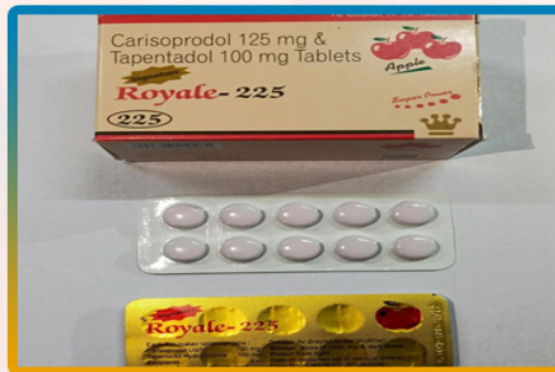
Buy Royal Tramadol Hydrochloride