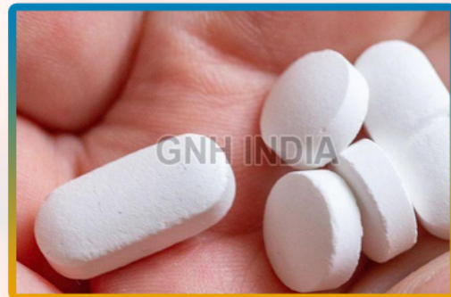
Zolpidem Tartrate Tablets