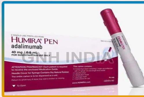
Humira Adalimumab 40mg