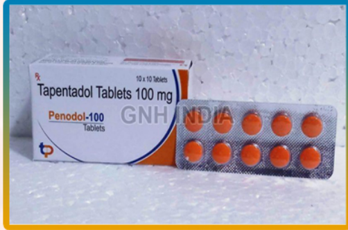
100mg Tapentadol Tablet