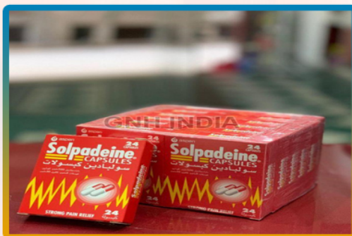
Solpadeine Soluble Tablets