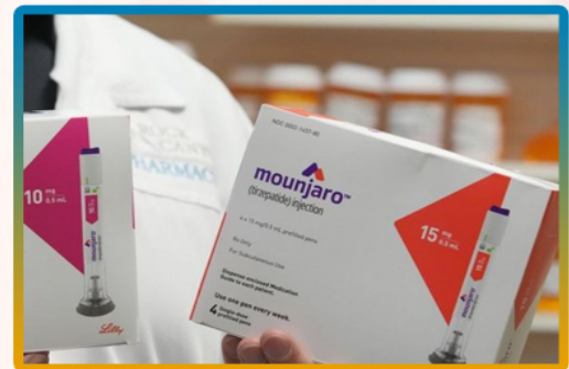
Mounjaro Tirzepatide Injection