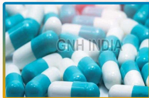
Vyvanse Lisdexamfetamine Capsule