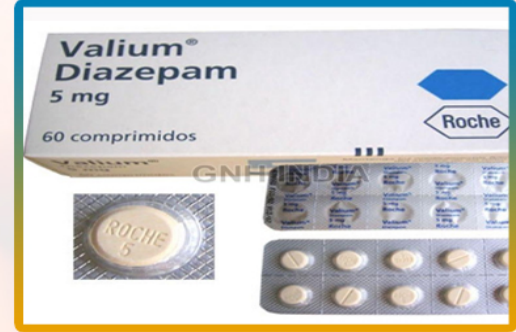
5mg Valium Diazepam Tablets