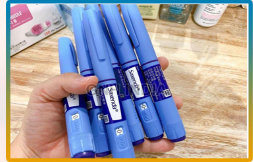
Saxenda Weight Loss Injection