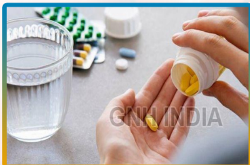
Gepirone Extended Release Tablets