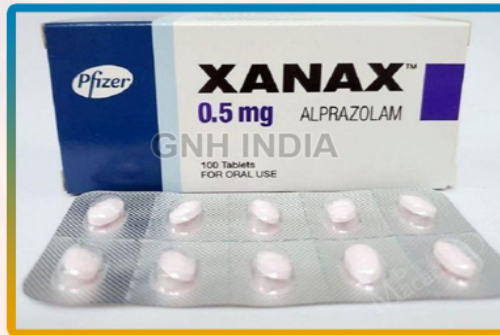
Alprazolam Xanax Tablets