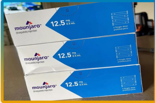
Mounjaro Tirzepatide Weight Loss