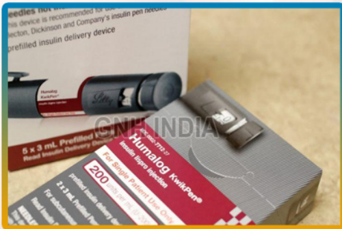
Humalog 100IU/ml Kwikpen Injection