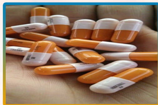
Adderall Online Without Prescription