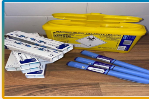
Saxenda Liraglutide Weight Loss