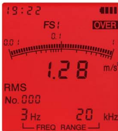
Overload indication screen