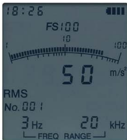
Measurement data display screen

The large LCD panel displays the bar graph meter and numeric reading at the same time, making it easy to visually evaluate any changes immediately. The display also shows the frequency range setting and other useful information. Backlighting can be turned on if required, allowing use of the unit also in dark locations. In case of overload, the indication "OVER" appears, and the entire display color changes to red.