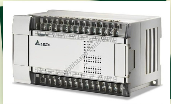
Delta DVP-EH2 Series PLC