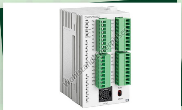
Delta DVP-SS2 Series PLC