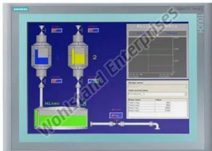
Siematic KTP1000 Basic Color PN HMI