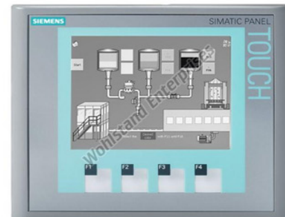
Siematic KTP400 Basic Mono PN HMI