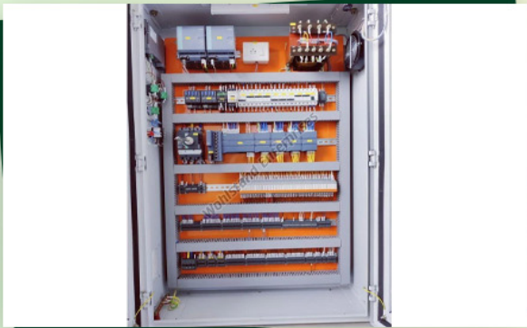
PLC Control Panel