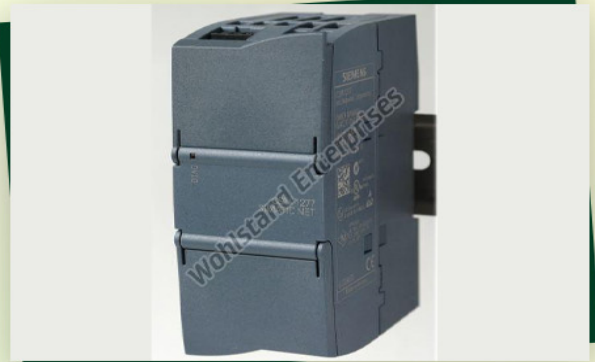
Siemens CSM 1277 Compact Switch Module