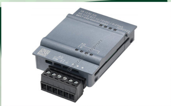
Siemens SB 1232 Signal Board