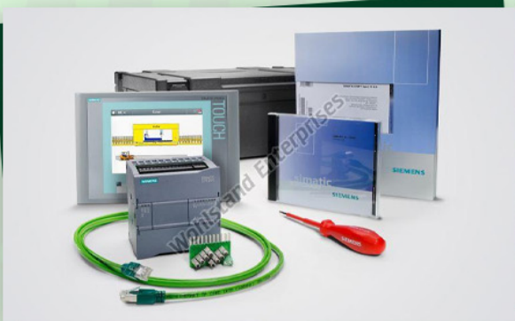
Simatic S7-1200 Starter Kit