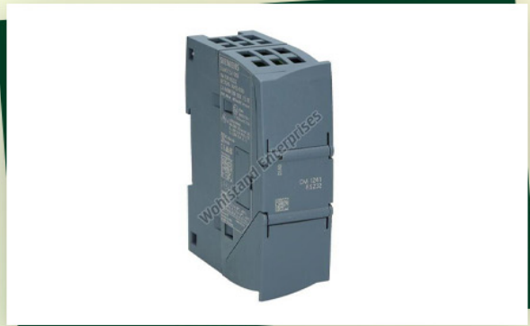
Siemens CM1241 RS232 Communication Module