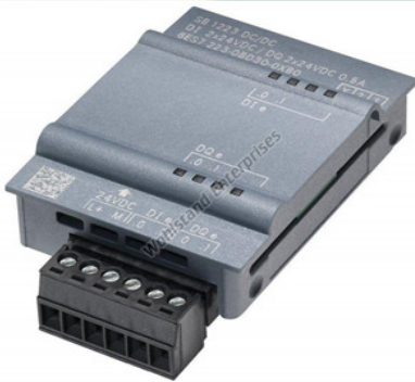
Siemens SB1223 Signal Board