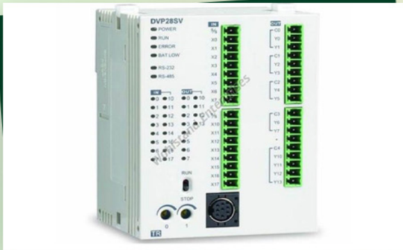
Delta DVP SV Series PLC