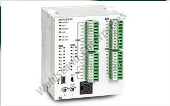
Delta DVP-SX2 Series PLC