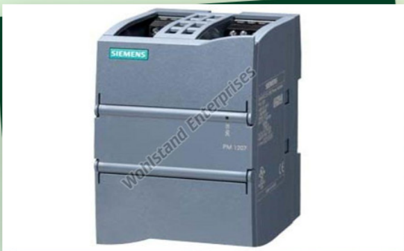
Siemens PM 1207 Power Module