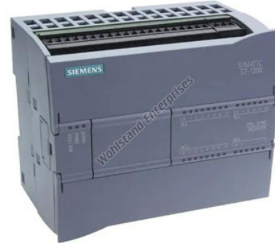
Siematic S7-1200 CPU 1214C Compact Controller