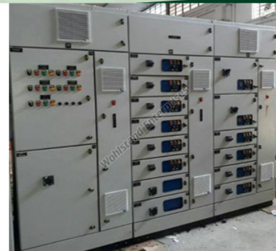
Electrical MCC Panel