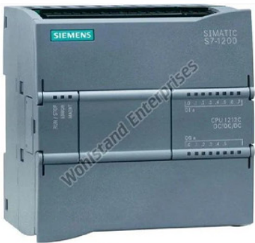
Siematic S7-1200 CPU 1212C Compact Controller