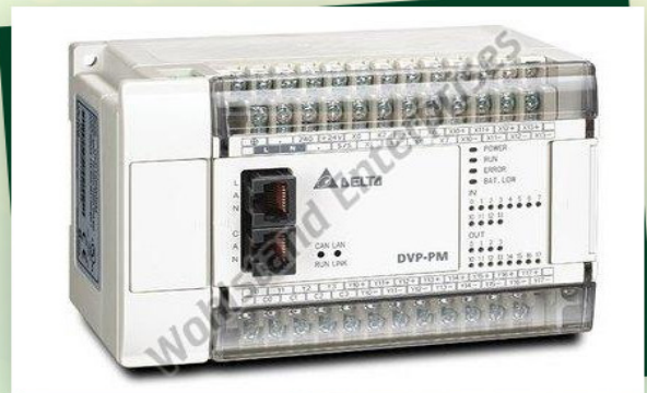
Delta DVP-PM Series PLC