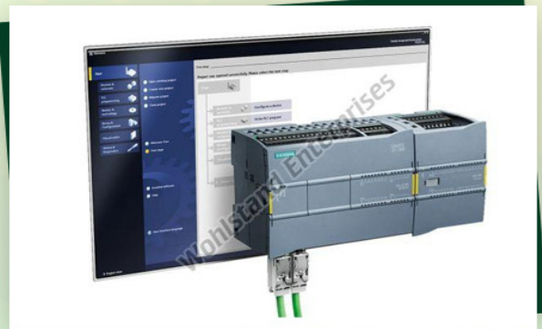
Simatic STEP 7 Basic Engineering System Software