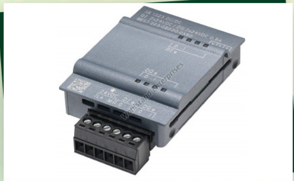
Siemens SB 1221 Signal Board