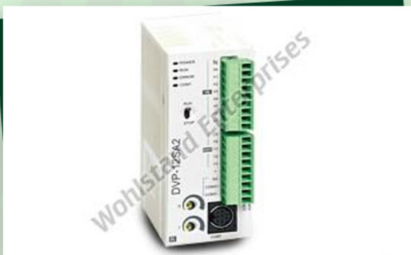
Delta DVP-SA2 Series PLC