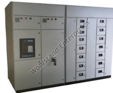
ACB Distribution Panel