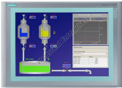
Simatic TP1500 Basic Color PN HMI