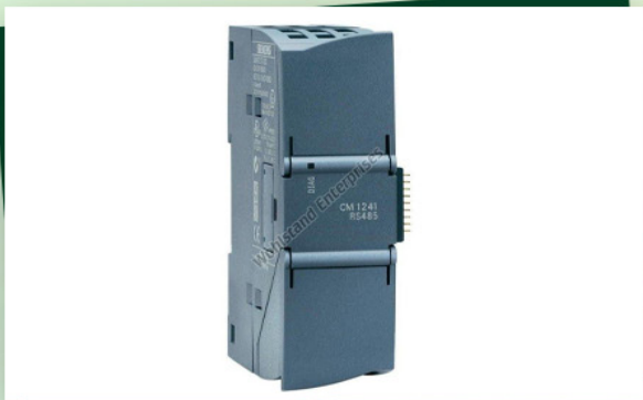
Siemens S71200 CM1241 RS485 Communication Module