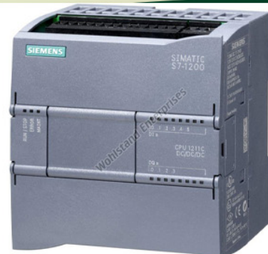
Siematic S7-1200 CPU 1211C Compact Controller