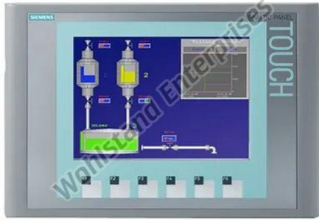
Simatic KTP600 Basic Color PN HMI