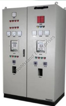
Electrical Control Panel