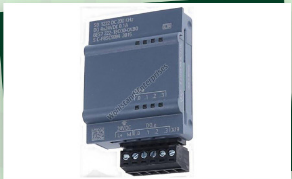
Siemens SB1222 Signal Board