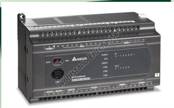
Delta DVP-ES2EX2 Series PLC