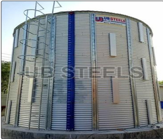
DM Water Tank