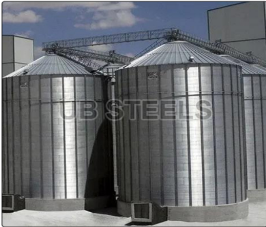
Corn Storage Silo