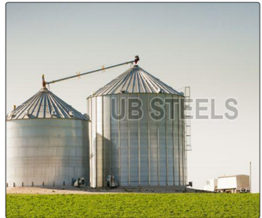
Soybean Storage Silo