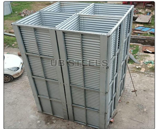
Rain Water Tank