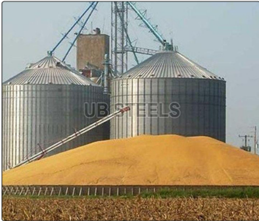
Wheat Storage Silo