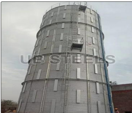
Process Water Tank