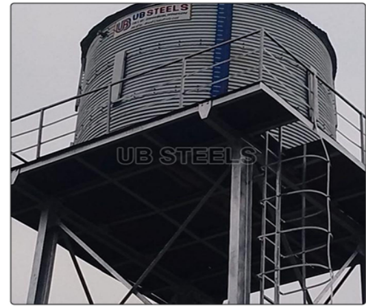
Treated Water Tank