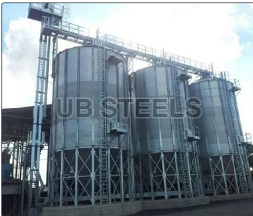
Sorghum Storage Silo