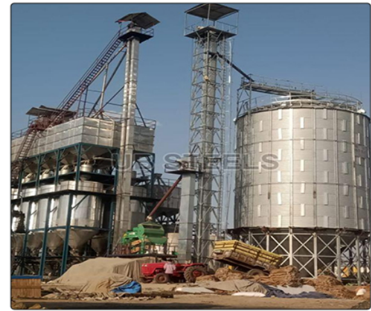
Paddy Storage Silo