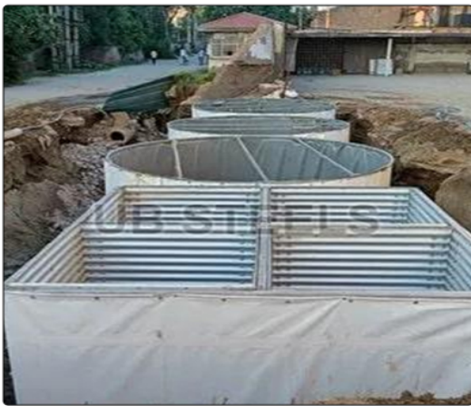
Sewage Water Tank