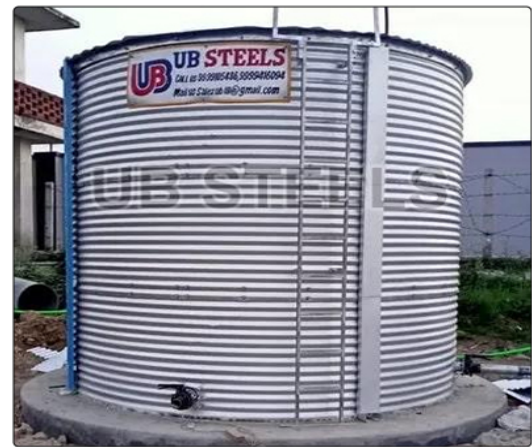
Industrial Water Tank