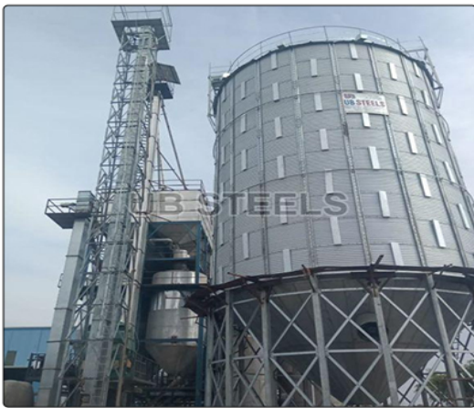
Maize Storage Silo