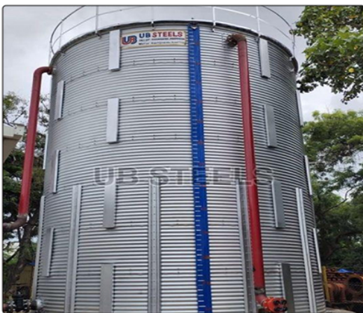
Fire Fighting Water Tank