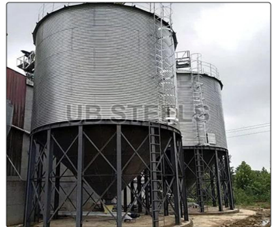
Barley Storage Silo