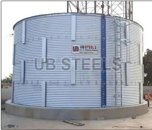
Raw Water Tank