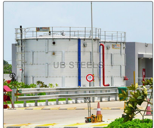
Fire Water Tanks