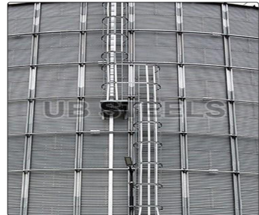
Ladder & Rest System