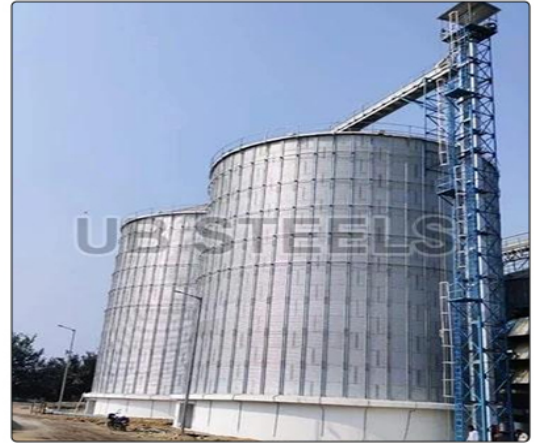
Cotton Seed Storage Silo