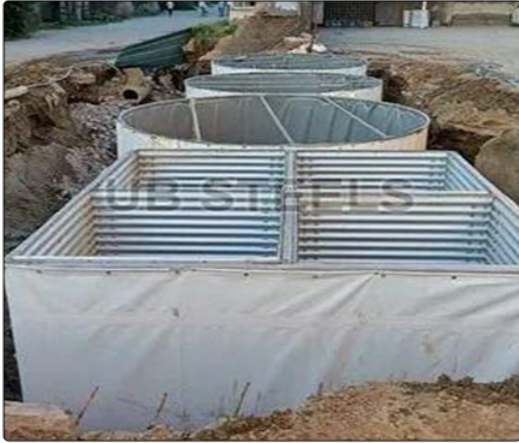
Underground Water Tanks