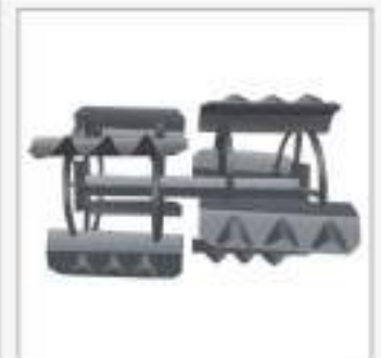
PADDY WHEEL DIESEL