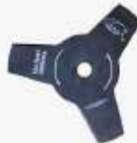
3 TEETH BLADE