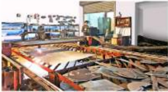
Computerised Sheet Fabrication