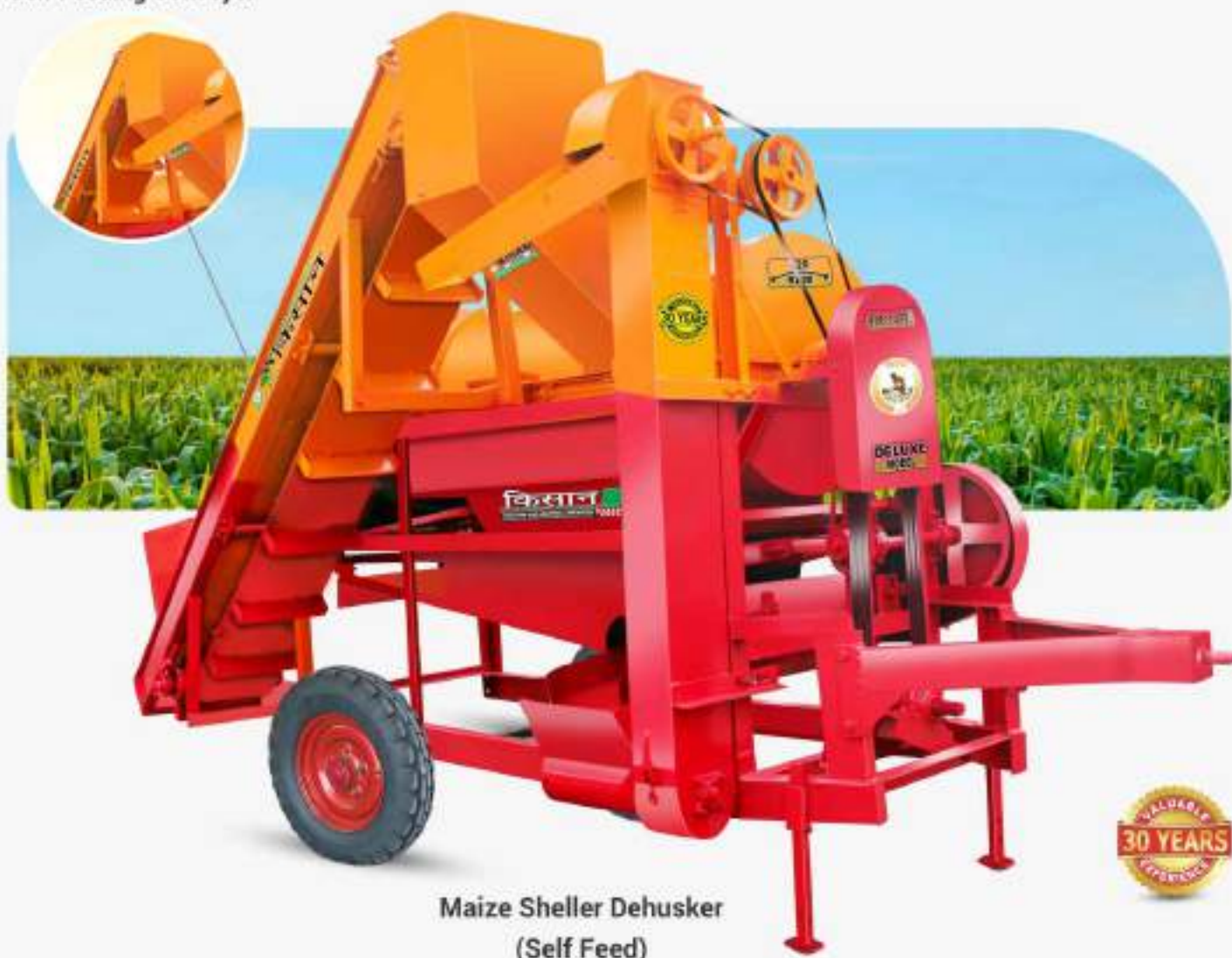
Maize Sheller Dehusker (Self Feed)