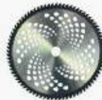
40 / 60 / 80 TEETH BLADE