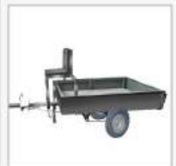
TROLLEY (with Brake System)