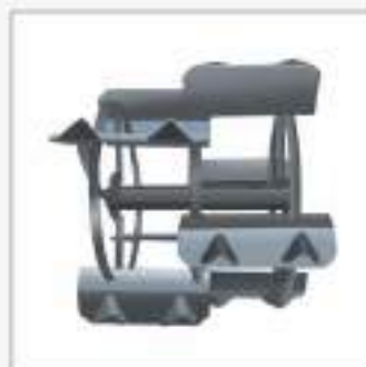
PADDY WHEEL PETROL