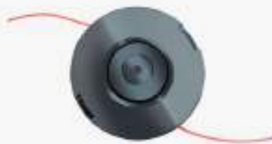
NYLON CUTTER BLADE