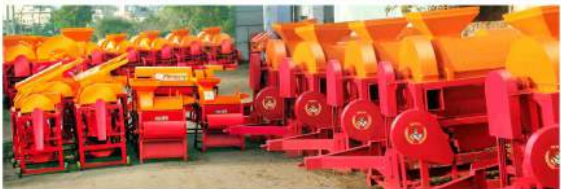
KISAN Threshers on their way to dealers