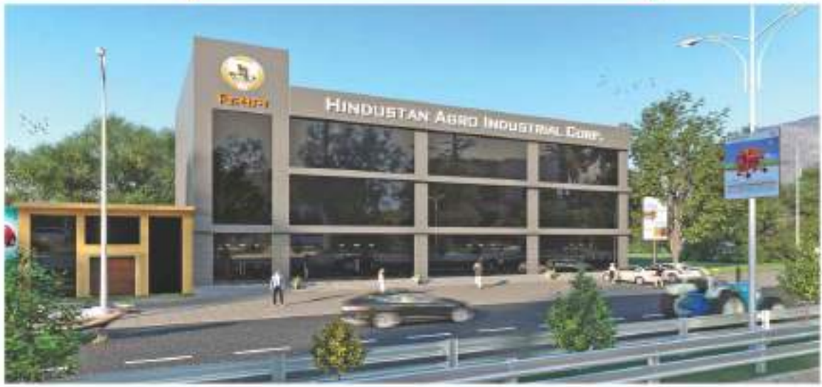
HAIC Head Office