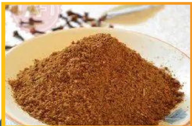
Meat Masala Powder