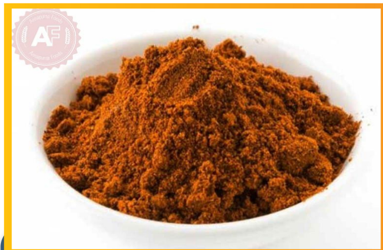
Chicken Masala Powder