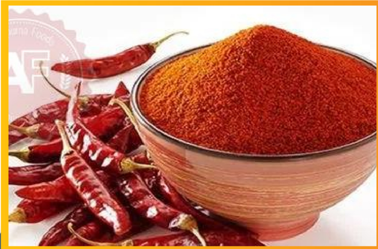
Red Chilli Powder