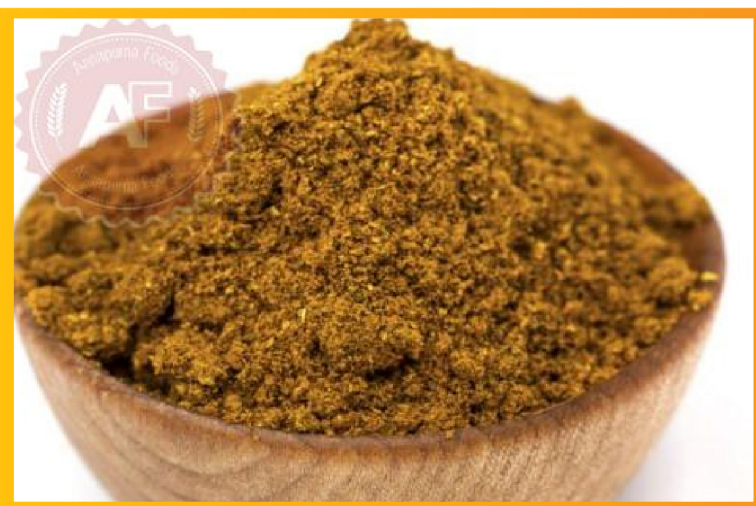
Garam Masala Powder