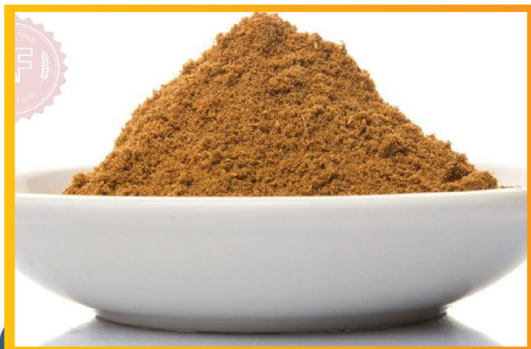
Marwadi Garam Masala Powder