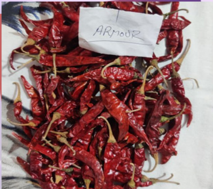
Armour Red Chilli