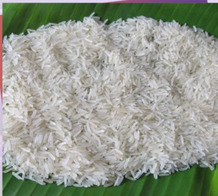
White Sella Basmati Rice