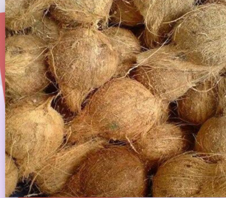
semi husked coconut