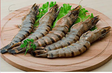
Frozen Tiger Prawns