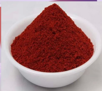
Organic Red Chilli Powder