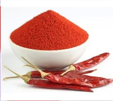
Byadgi Red Chilli Powder