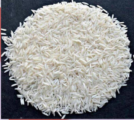
1121 Steam Basmati Rice