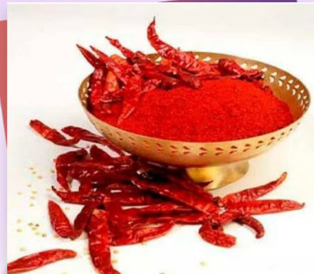
Natural Red Chilli Powder