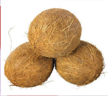
Fully Husked Coconut