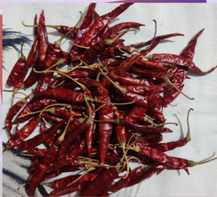
S17 Teja Red Chilli