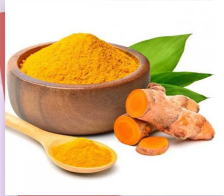
Natural Turmeric Powder