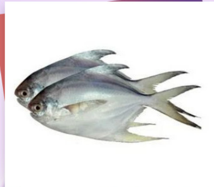
Frozen Pomfret Fish