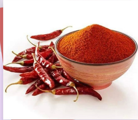
Guntur Red Chilli Powder