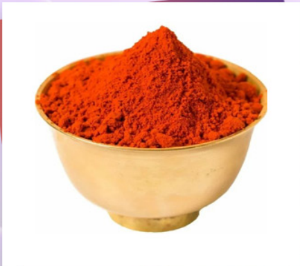
Kashmiri Red Chilli Powder