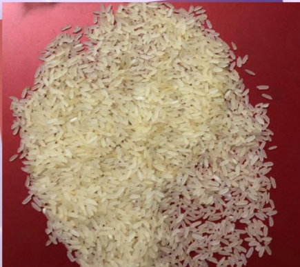
Ir64 Basmati Rice