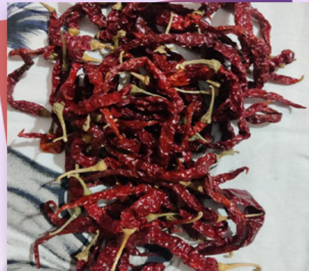
Byadgi 531/668 Red Chilli