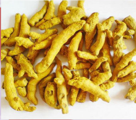
Natural Turmeric Finger