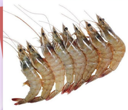
Frozen Vannamei Shrimps