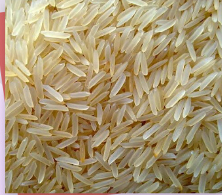
Golden Sella Basmati Rice