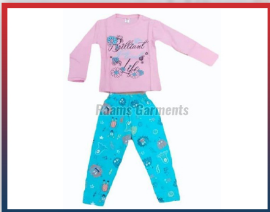
Kids Casual Cotton T Shirt and Lower Set