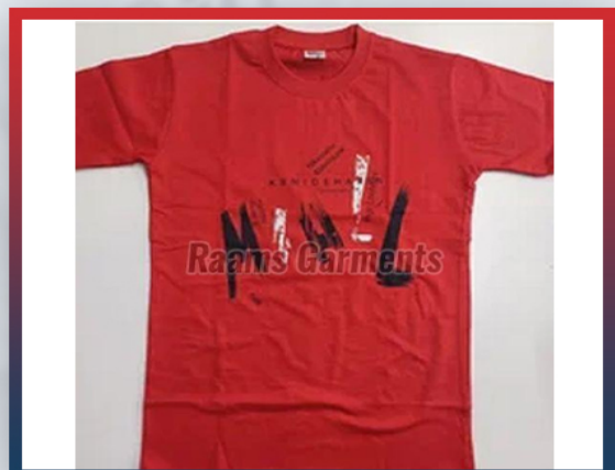
Kids Round Neck Cotton T Shirt and Lower Set