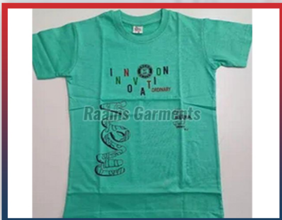
Kids Green Round Neck Cotton T Shirt