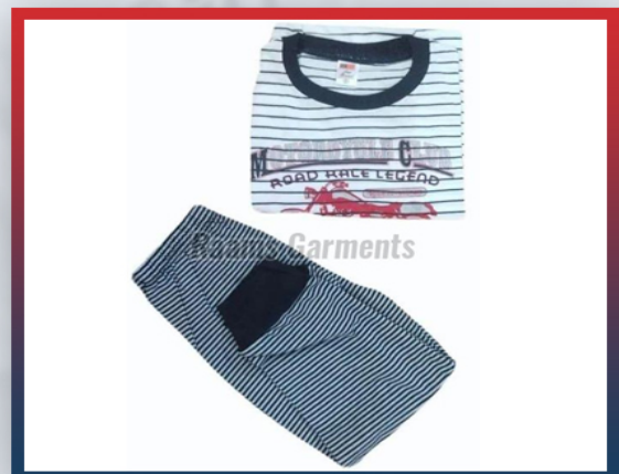
Kids Round Neck Cotton T Shirt and Lower Set