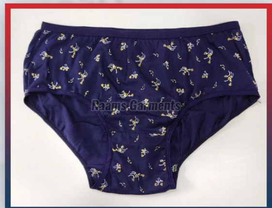
Ladies Navy Blue Printed Cotton Panties