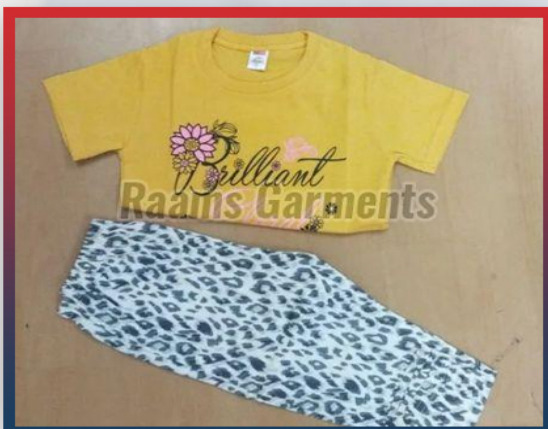
Kids Printed Cotton T Shirt and Lower Set