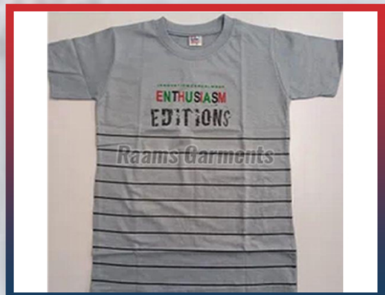
Kids Grey Round Neck Cotton T Shirt