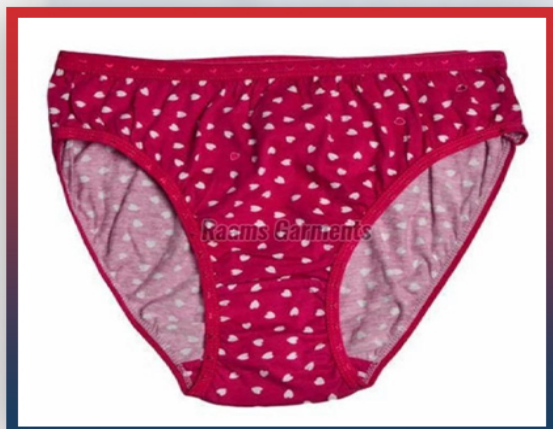
Ladies Red Printed Cotton Panties