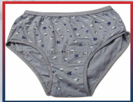
Ladies Grey Printed Cotton Panties