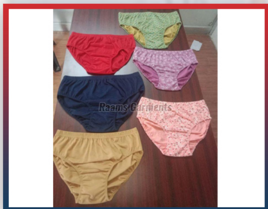
Ladies Premium Quality Cotton Panty