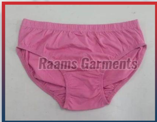
Ladies Pink Plain Cotton Panties