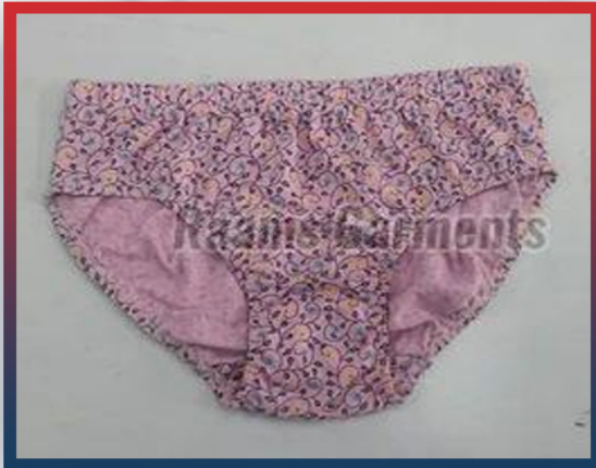
High Rise Printed Cotton Panties