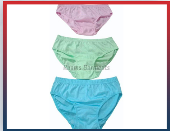
Ladies Medium Quality Cotton Panty