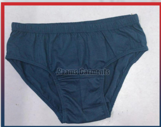
Ladies Navy Blue Cotton Panties