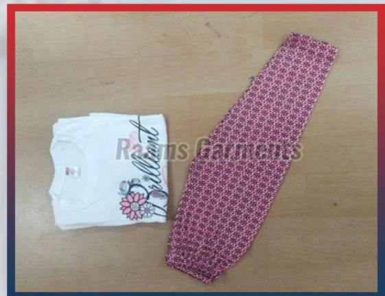
Kids Half Sleeves Cotton T Shirt and Lower Set