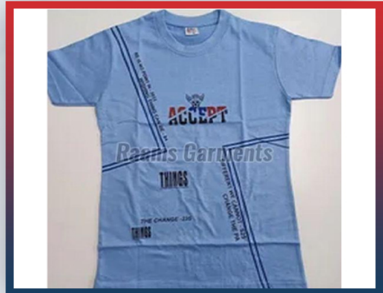
Kids Blue Round Neck Cotton T Shirt