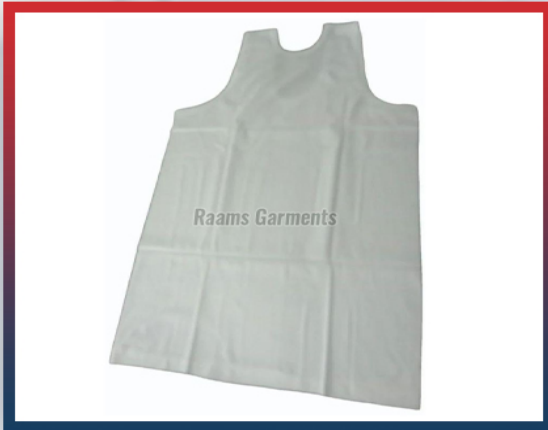
Mens Cotton Vest