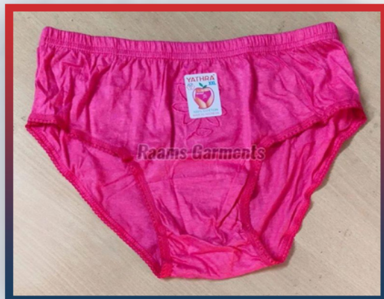
Ladies Pink Women Cotton Panties