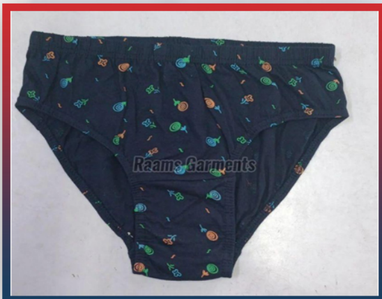
Ladies High Rise Navy Blue Printed Cotton Panties