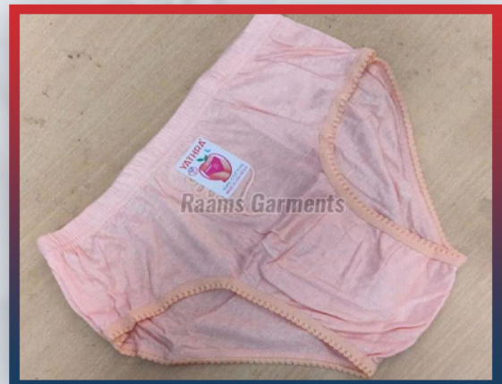
Ladies Inner Elastic Peach Cotton Panties