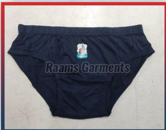
Ladies Navy Blue Plain Cotton Panties