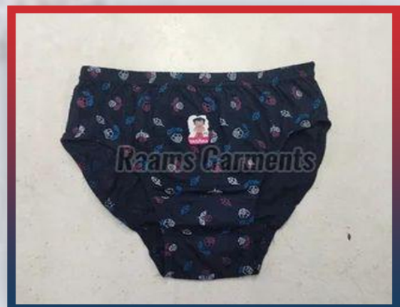
Ladies Navy Blue Inner Elastic Printed Cotton Panties