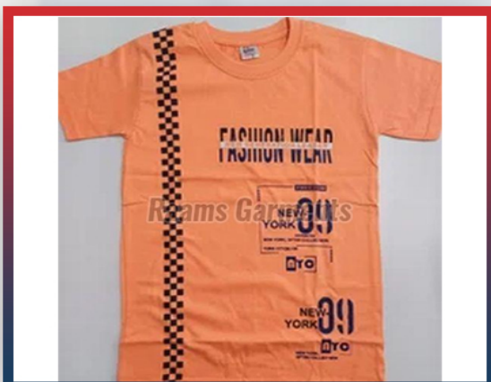
Kids Orange Round Neck Cotton T Shirt