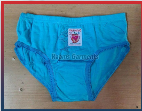
Ladies Inner Elastic Pure Cotton Panties