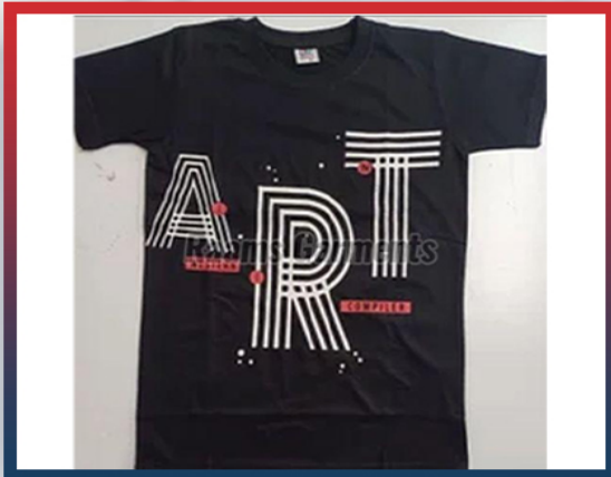
Kids Black Round Neck Cotton T Shirt