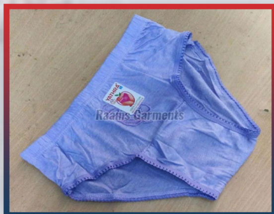
Ladies Purple Pure Cotton Panties