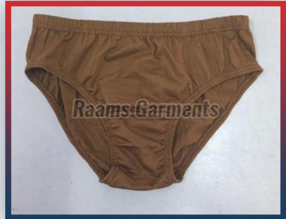
Ladies Brown Plain Cotton Panties