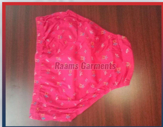
Ladis Printed Cotton Panties