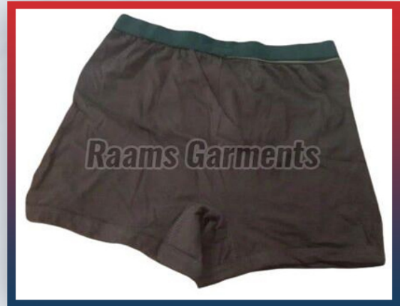
Mens Pocket Trunks