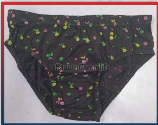
Ladies Brown Printed Cotton Panties