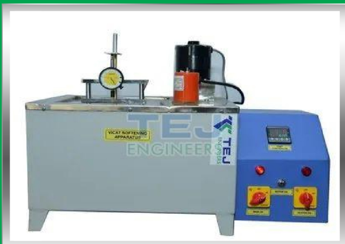
Automatic Melt Flow Index Tester