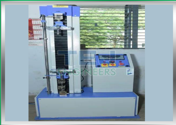
Mild Steel Tensile Tester