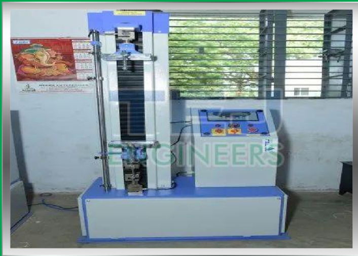
230 V Plastic Testing Apparatus Machine