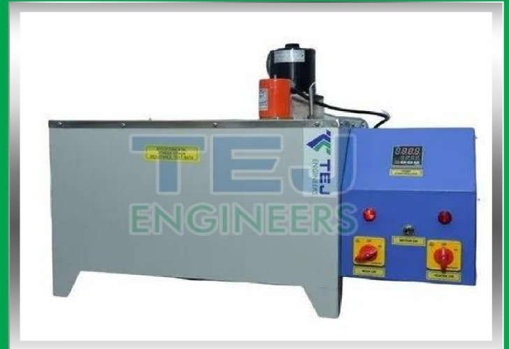
ESCR Test Apparatus