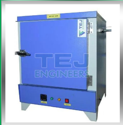
Digital Hot Air Oven