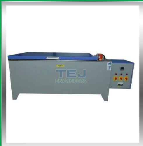
Hot Water Bath