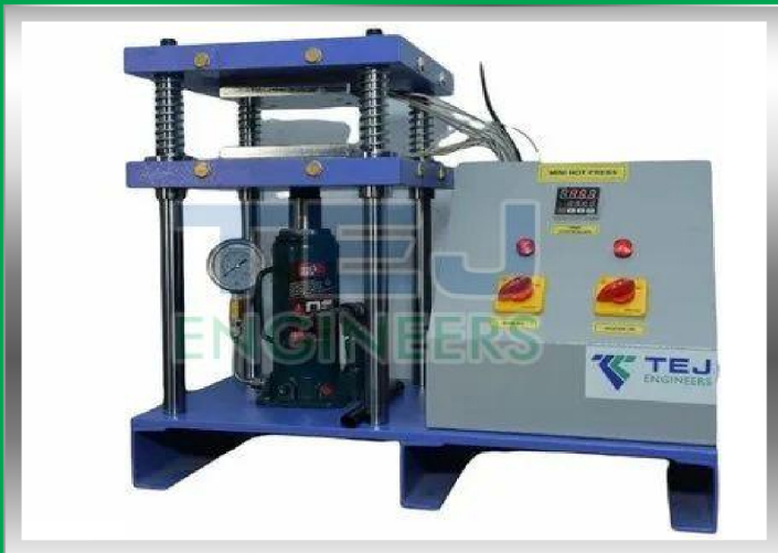
Sheet Molding Hydraulic Power Press