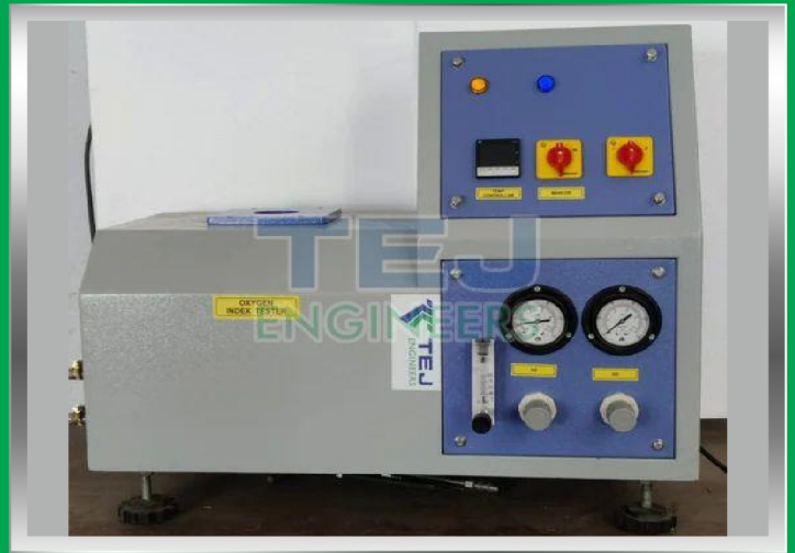
Oxidation Induction Tester