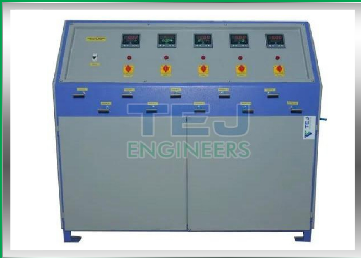
5 Station Hydro Static Pressure Tester