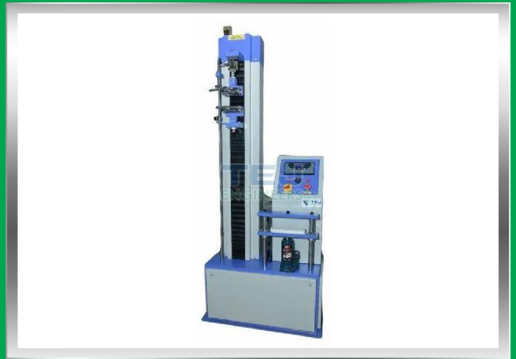
Bursting Strength Tester