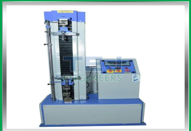
Fabric Universal Tensile Testing Machine