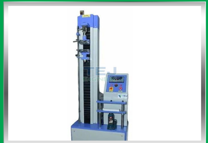
Mild Steel Plastic Testing Apparatus Machine