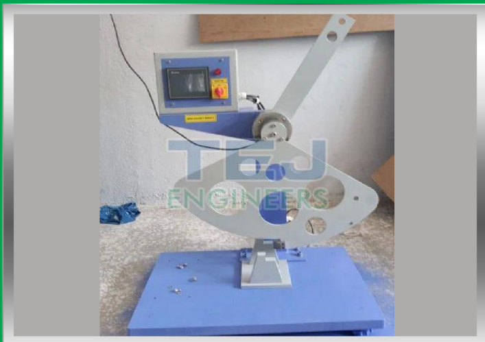
Charpy Impact Testing Machine