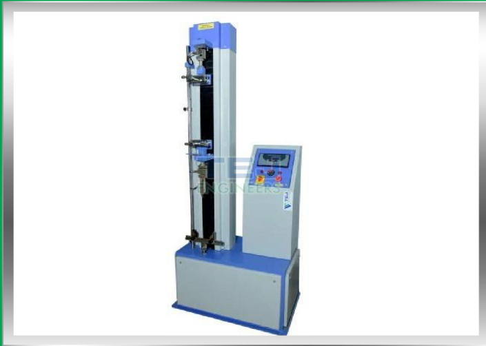
Digital Universal Testing Machine