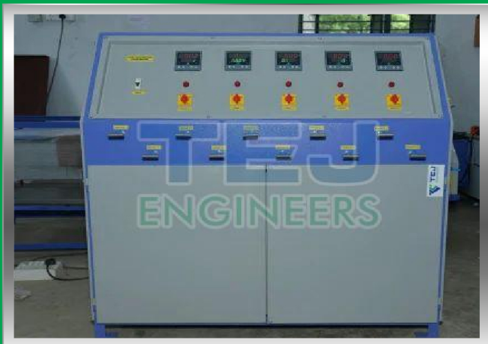
Hydro Pressure Testing Machine