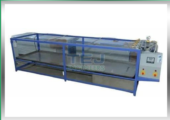
Plastic Pipe Testing Machine