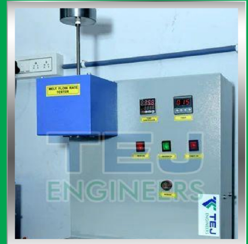
Digital Melt Flow Index Tester