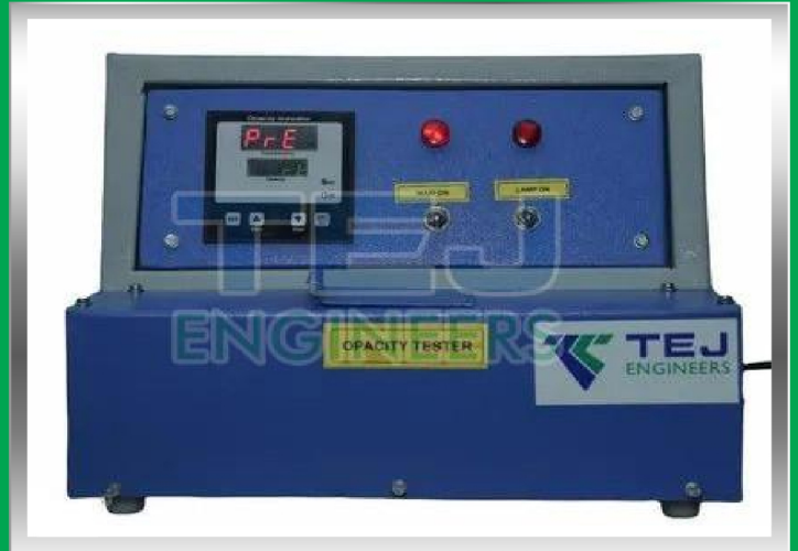
PVC Pipe Opacity Tester Meter