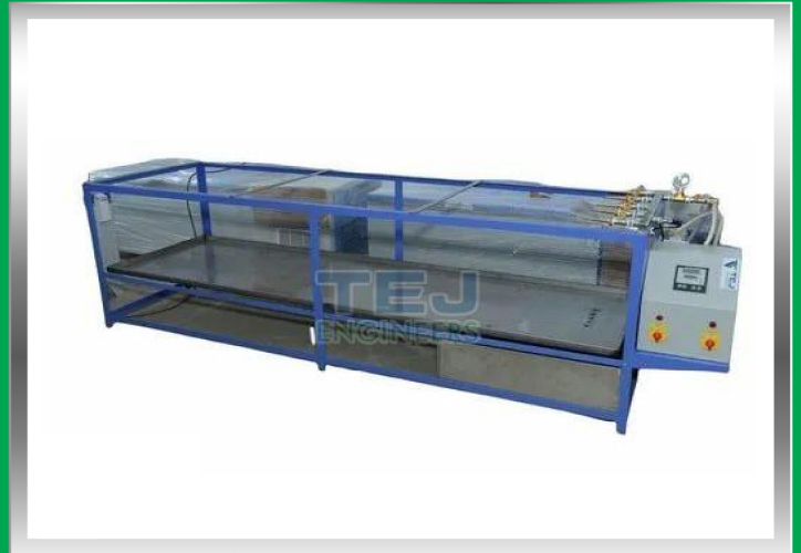
Emitter Flow Rate Tester