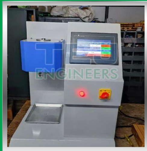
Automatic Melt Flow Index Tester