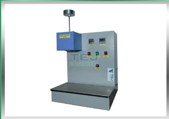
Melt Flow Index Test Apparatus