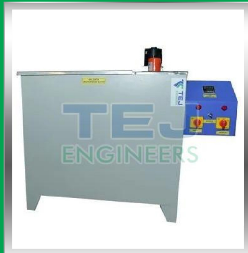
High Temperature Oil Bath