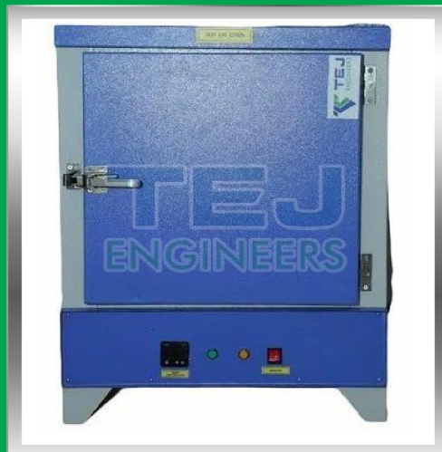
Laboratory Hot Air Oven