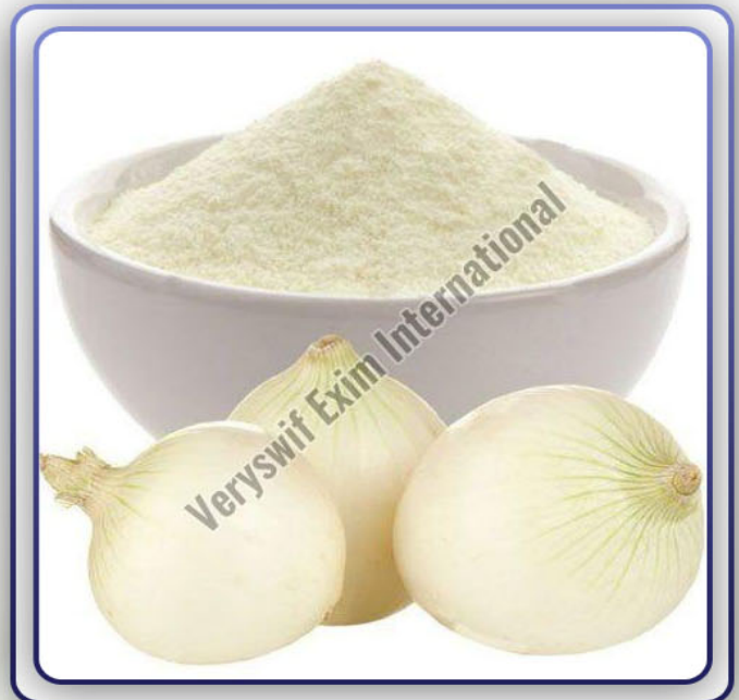
Dehydrated White Onion Powder