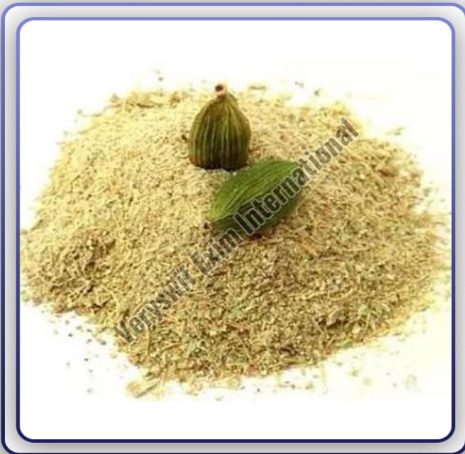
Green Cardamom Powder