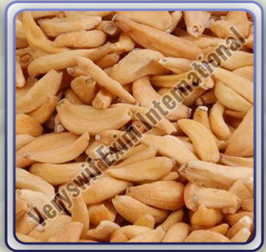
Dehydrated Garlic Flakes