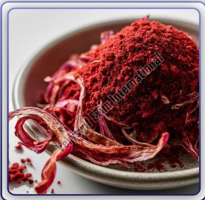
Dehydrated Red Onion Powder