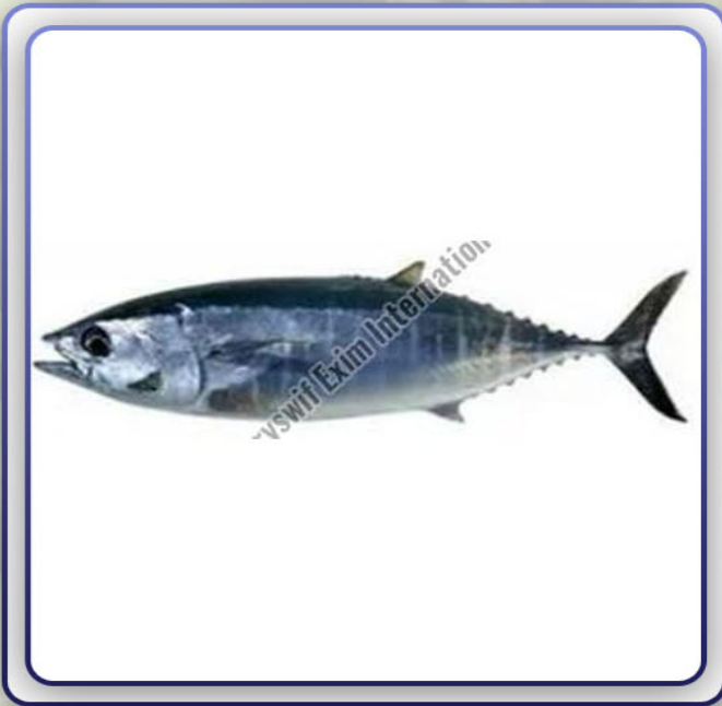
Skip Jack Tuna Fish