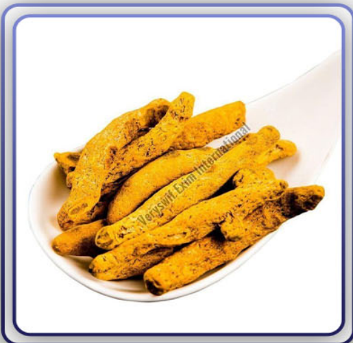
Yellow Turmeric Finger