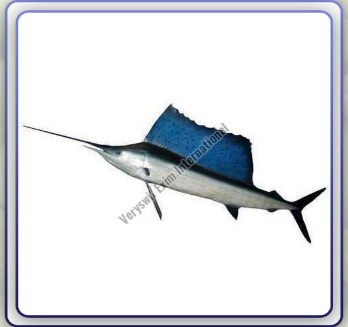
Frozen Sail Fish