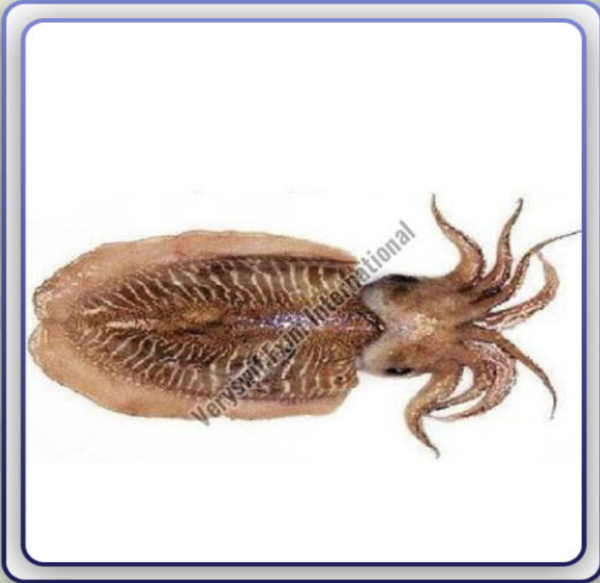
Frozen Cuttle Fish