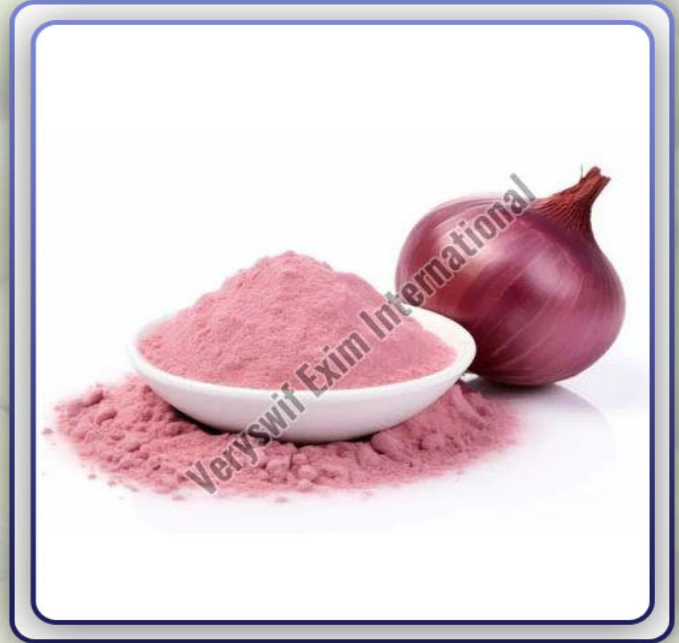
Dehydrated Pink Onion Powder