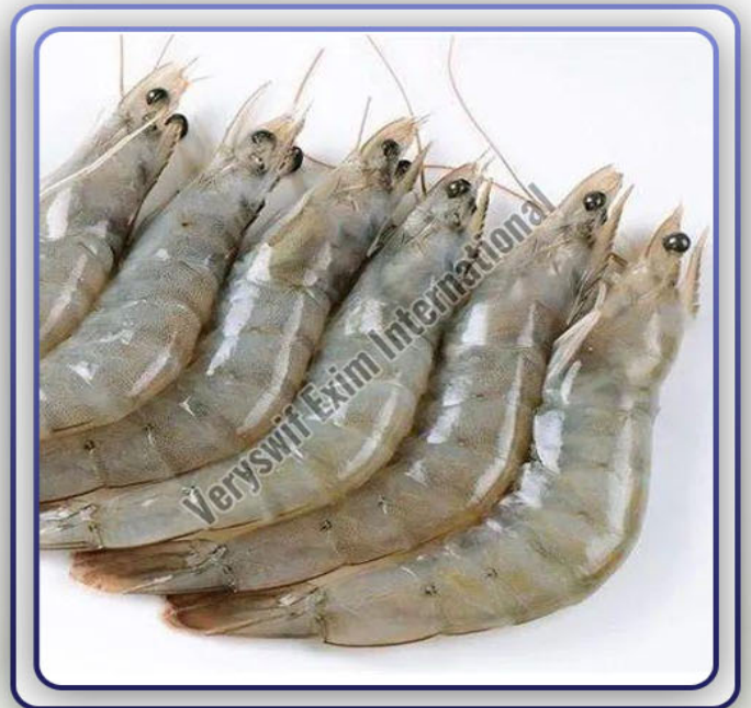
Frozen Whole Shrimp