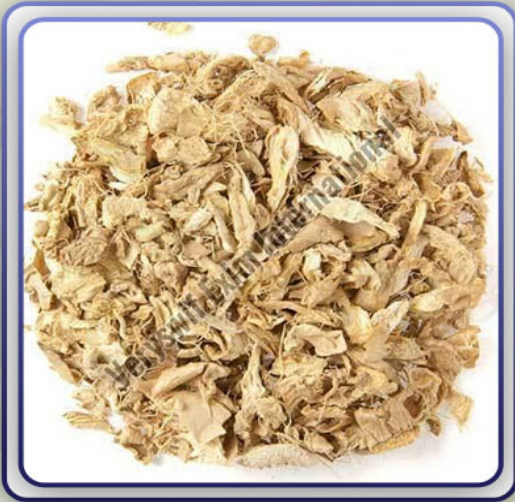
Dehydrated Ginger Flakes