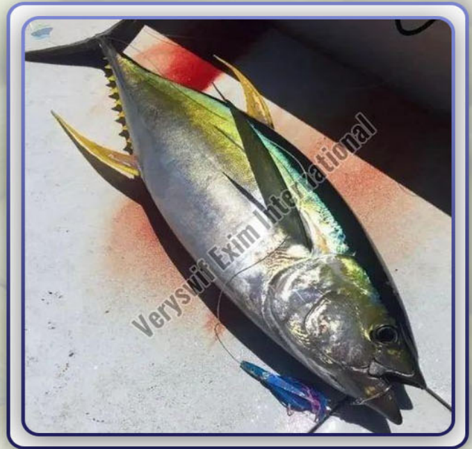
Yellowfin Tuna Fish