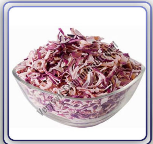
Dehydrated Red Onion Flakes