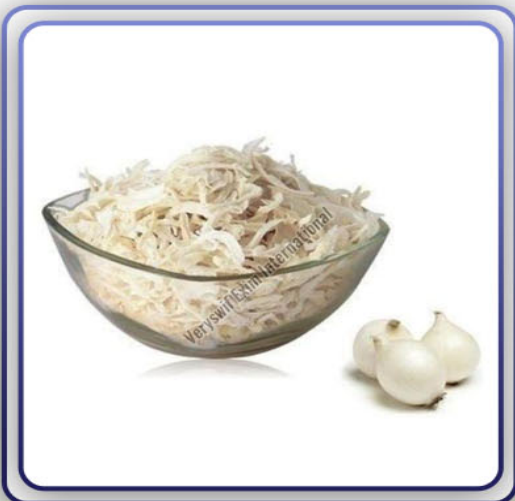
Dehydrated White Onion Flakes