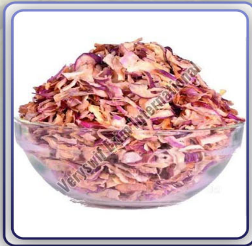
Dehydrated Pink Onion Flakes