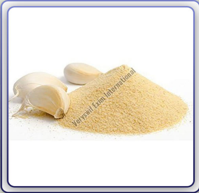
Dehydrated Garlic Powder