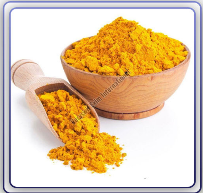
Yellow Turmeric Powder