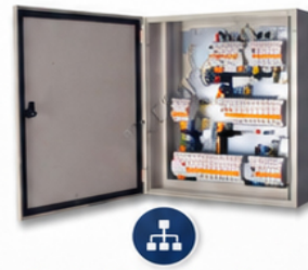
Sub Distribution Panel