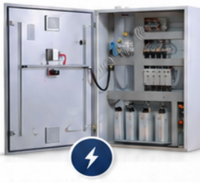
Automatic Power Factor Controller Panel