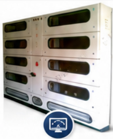
Automatic Meter Panel