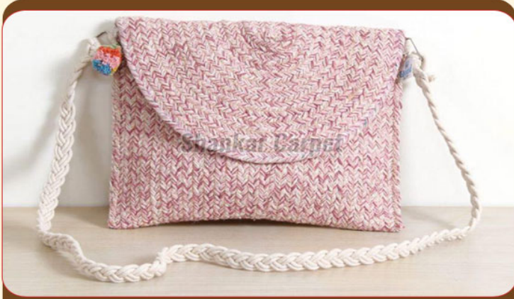
Jute Clutch Bags