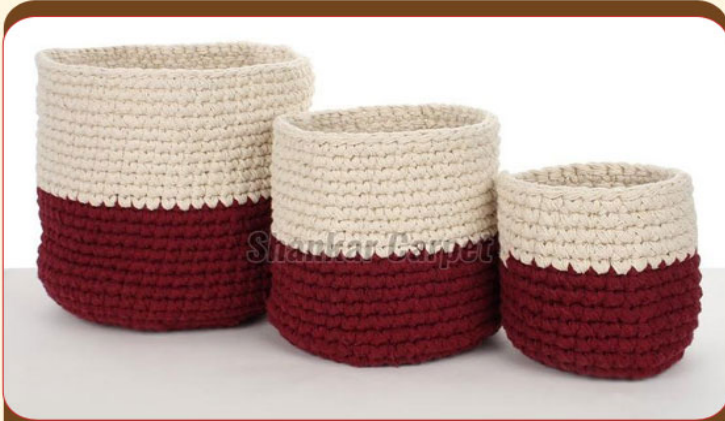
Fancy Jute Baskets