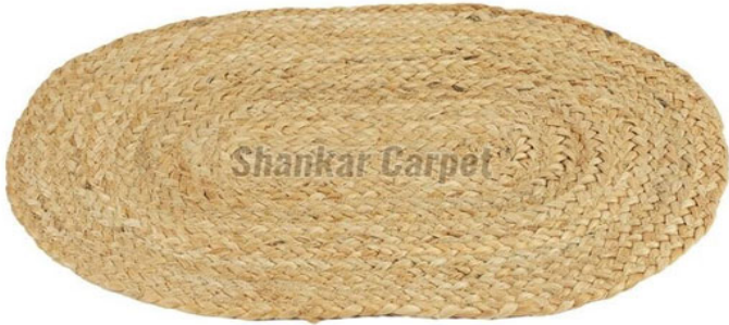
Oval Floor Rugs