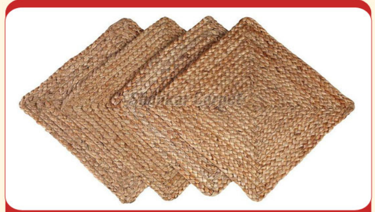
Square Jute Placemats