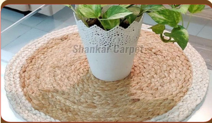
Round Jute Placemats