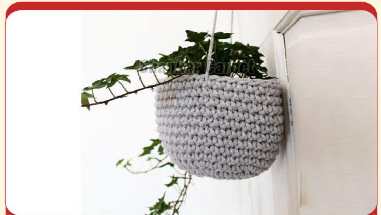
Hanging Jute Baskets