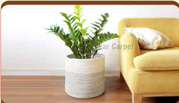
Flower Jute Baskets