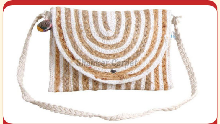
Jute Shoulder Bags