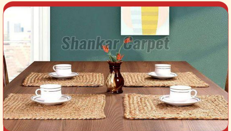
Dining Jute Placemats