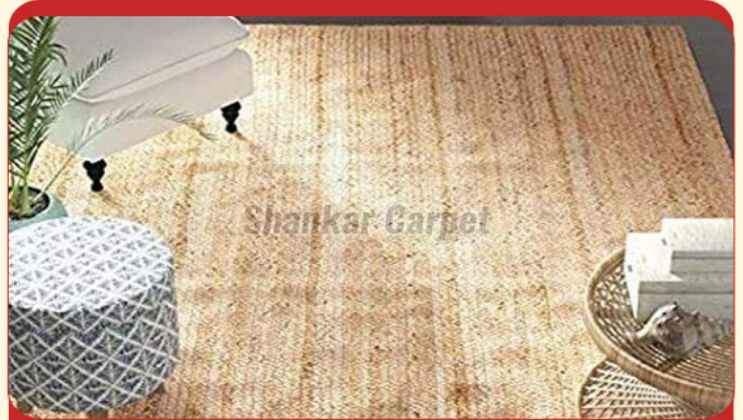
Rectangle Floor Rugs