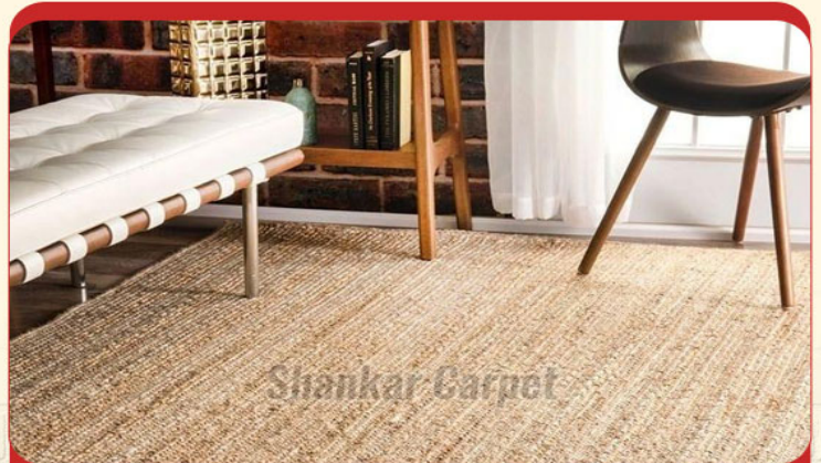
Square Floor Rugs