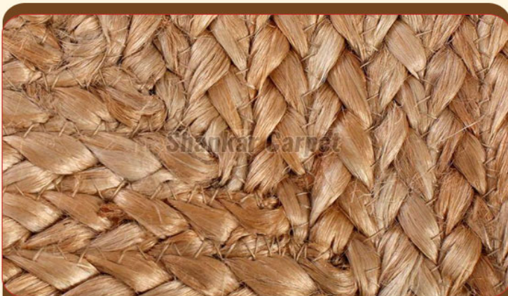
Braided Jute Placemats