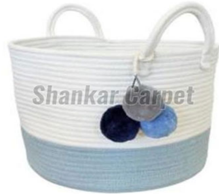
Modern Jute Baskets