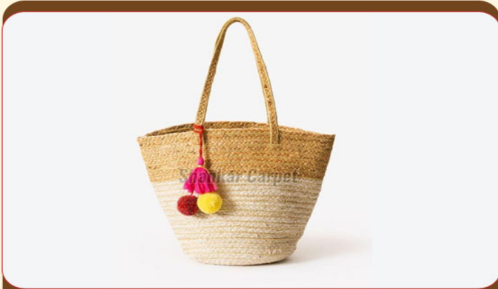
Jute Shopping Bags