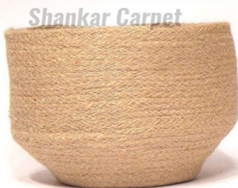
Round Jute Baskets