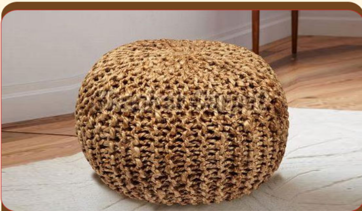
Brown Jute Puffs