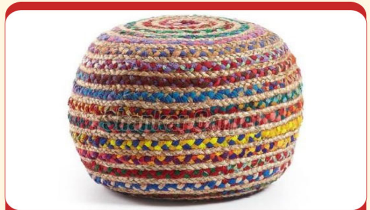
Living Room Jute Puffs