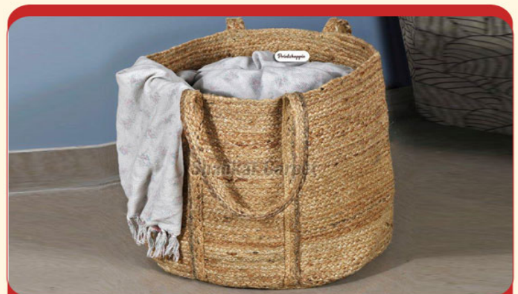
Laundry Jute Baskets