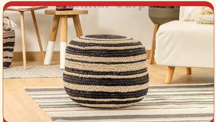
Striped Jute Puffs