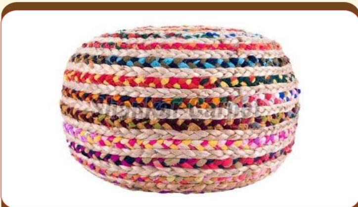
Multicolor Jute Puffs