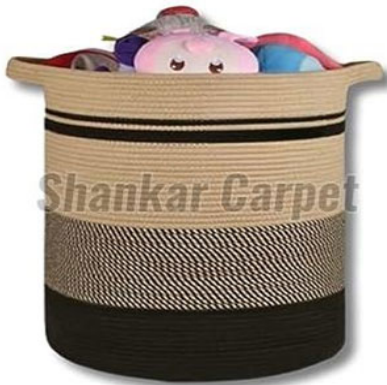
Multipurpose Jute Baskets