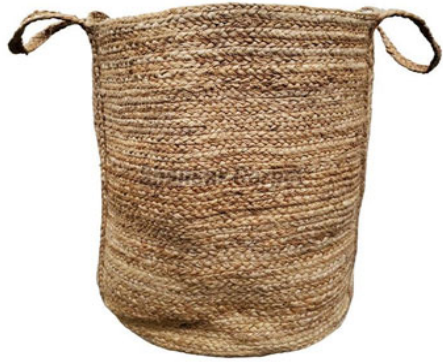
Loop Handle Jute Baskets