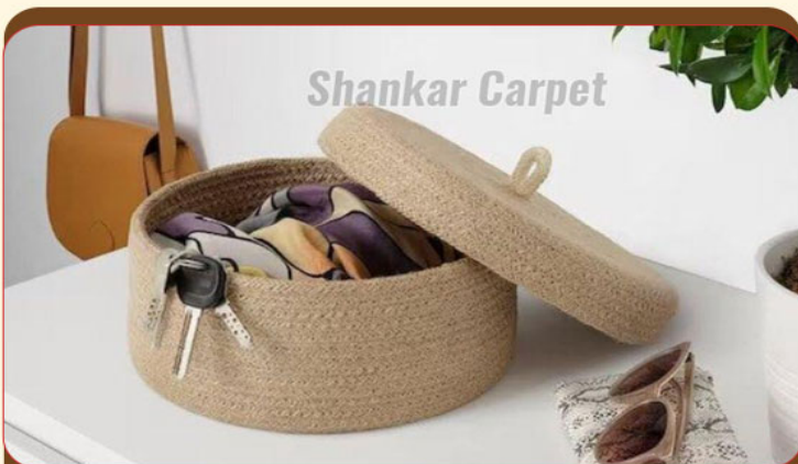
Jute Basket With Lid