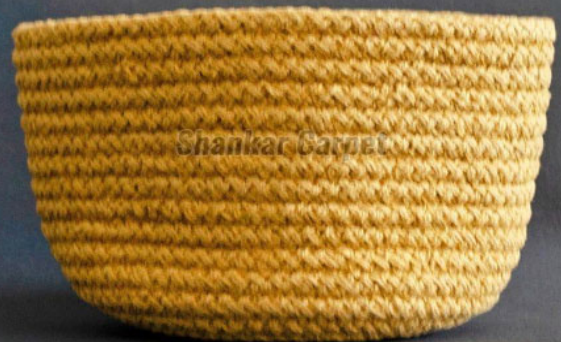
Stylish Jute Baskets