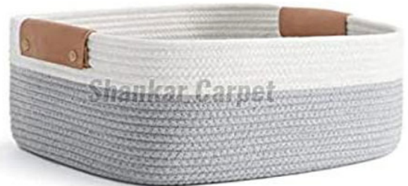
Rectangle Jute Baskets