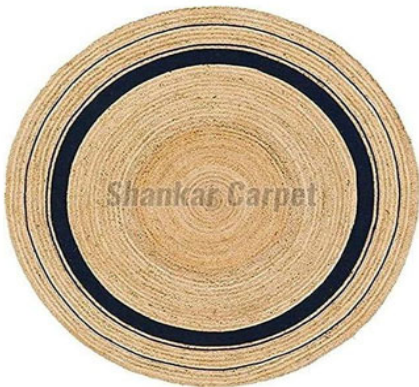
Round Floor Rugs