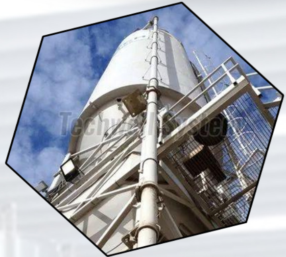
Industrial Storage Silos