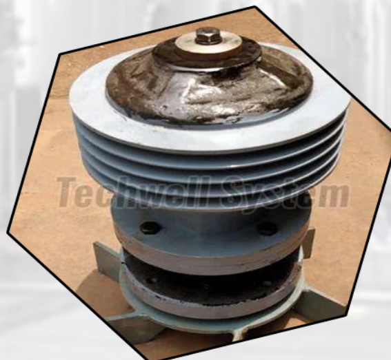
Wheel Shaft Assembly