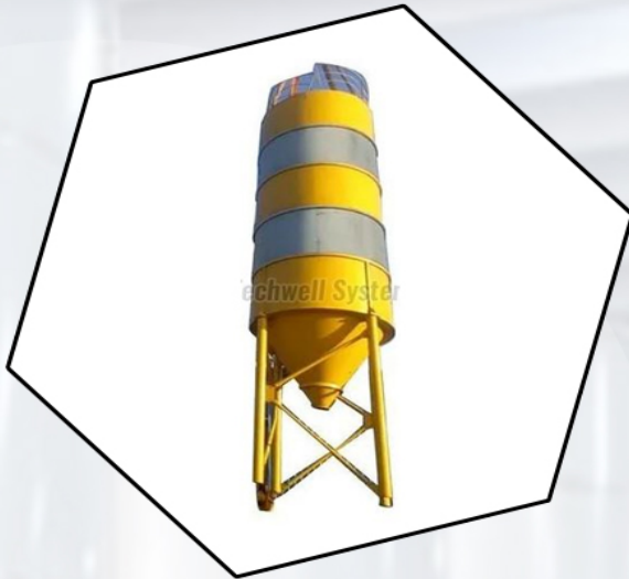
80 Tons Cement Storage Silo