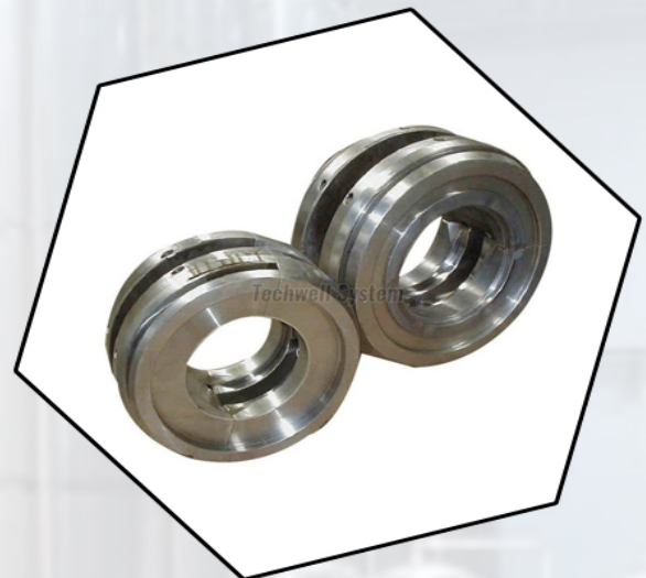
White Metal Bearing