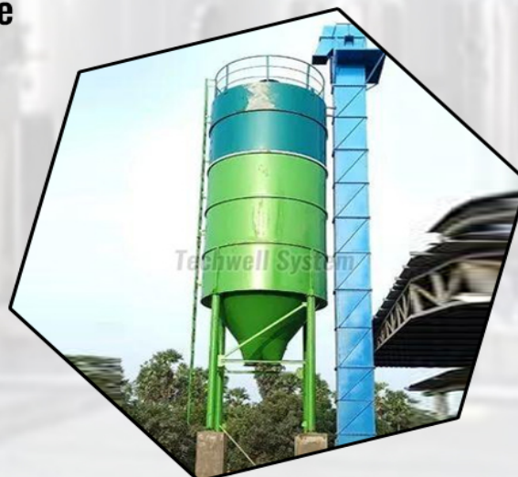
70 Tons Cement Storage Silo