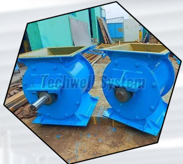
Rotary Air Lock Feeder