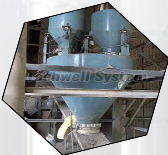
Concrete Batching Plant