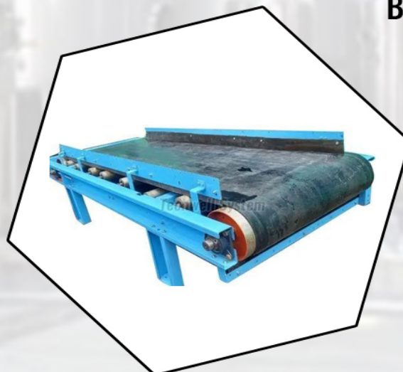
Automated Weigh Feeder