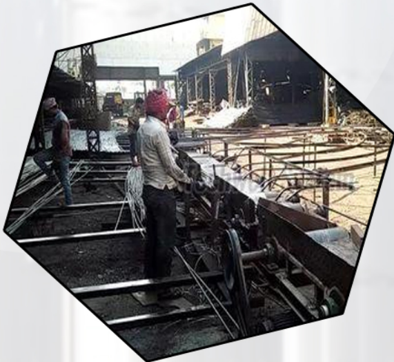
TMT Bar Bending Machine