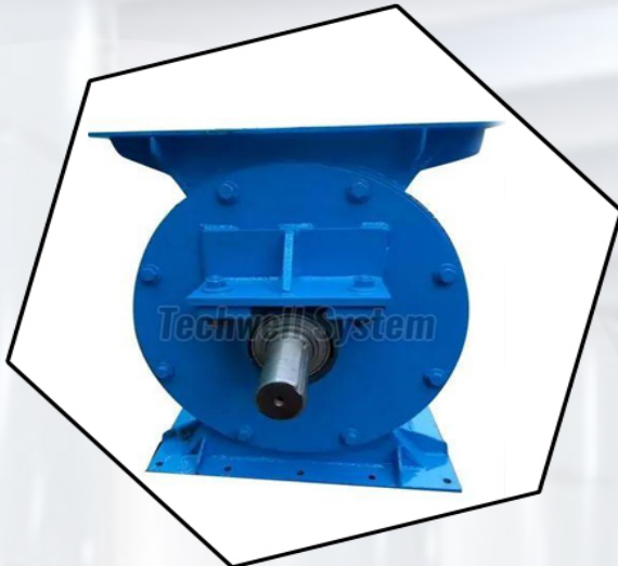
Mild Steel Rotary Feeder