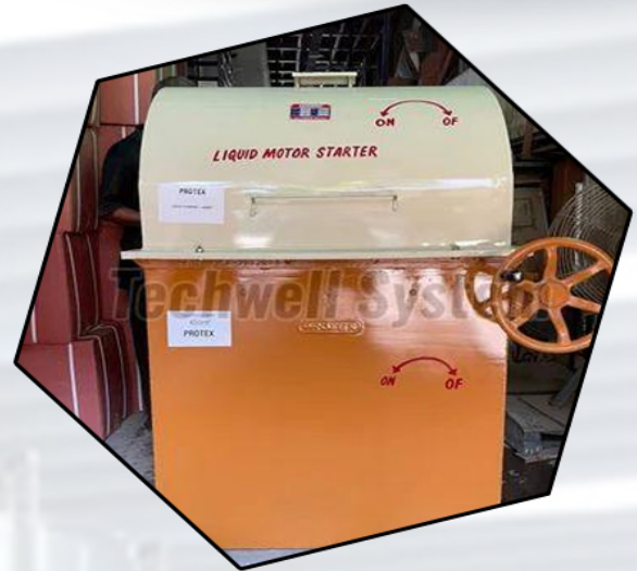
Liquid Resistance Starter