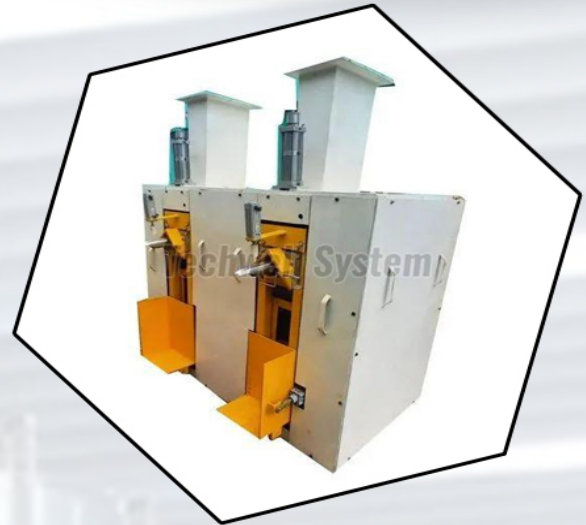
Mild Steel Cement Packing Machine