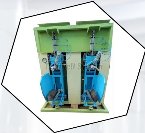
Automatic Cement Packing Machine