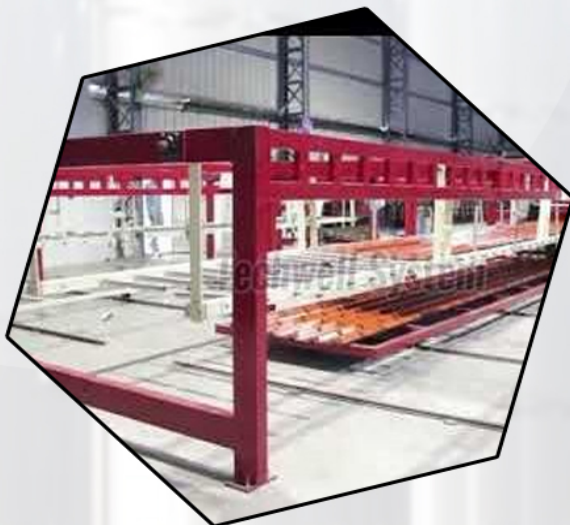
Roofing Sheet Making Machine