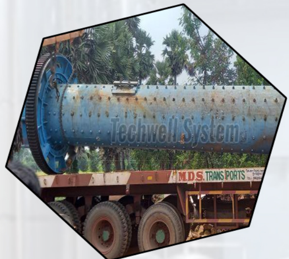
Cement Ball Grinding Mill