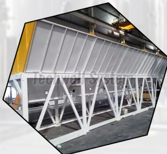
Concrete Batch Hopper