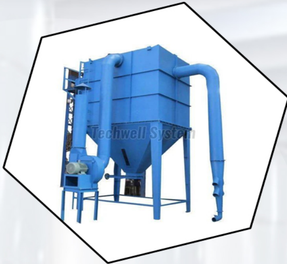
Dry Dust Collector