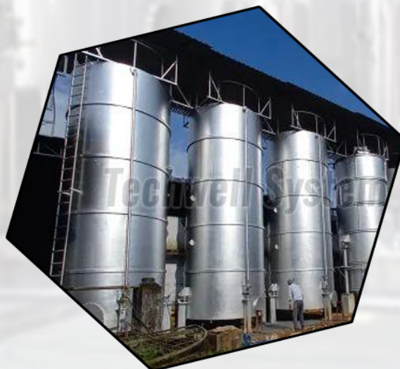
Hopper Tank Weighing System