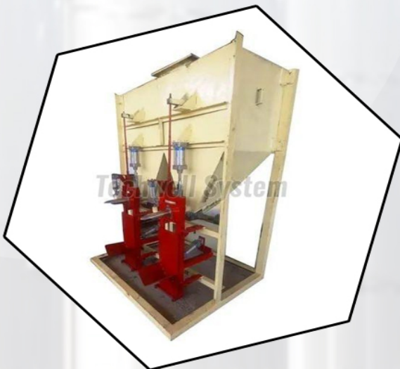
Semi Automatic Cement Packing Machine