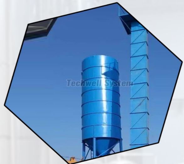
100 Tons Cement Storage Silo