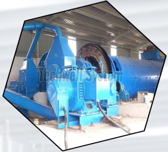
Mini Cement Plant