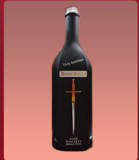
Brave Sword Single Malt