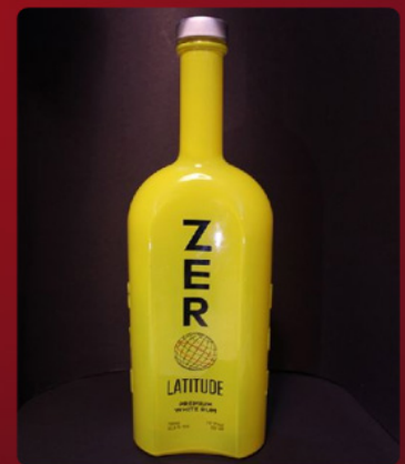
Zero Lat Cane Rum