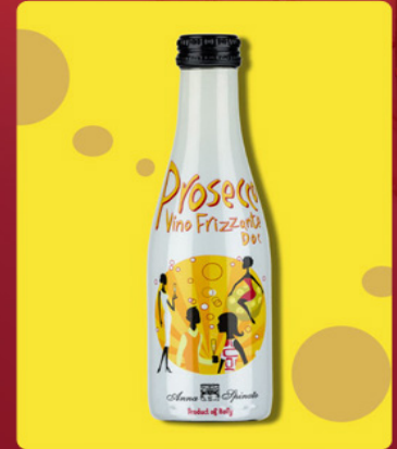
Mini Prosecco Wine