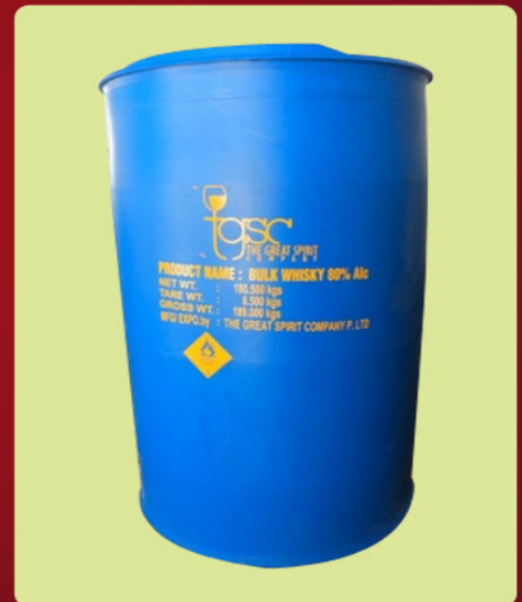
Bulk Single Malt Single Grain Whisky