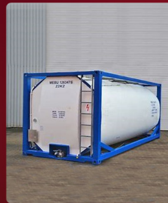
Ethanol in ISO tanker 25KL HS 2207-1090