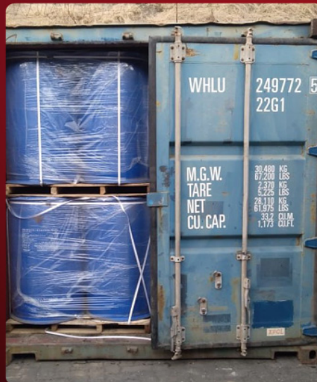
Special Denatured Spirit(SDS)