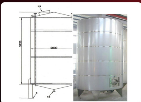
Vodka Birch Filtration