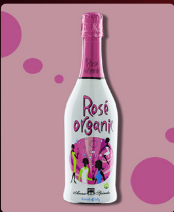
Organic Rose Wine