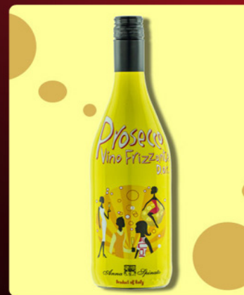
Prosecco Frizzante Wine