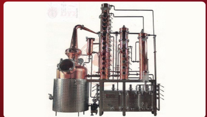
Malt & Pot Still Whisky Making Machine Installation