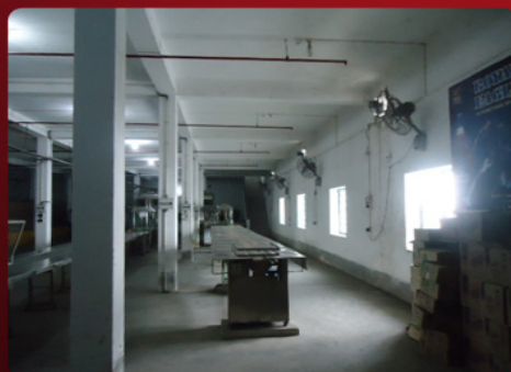
Alcohol Beverage Unit Buying Agent