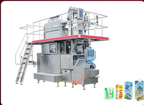
Aseptic Brick Carton Juice Filling Machine Installation