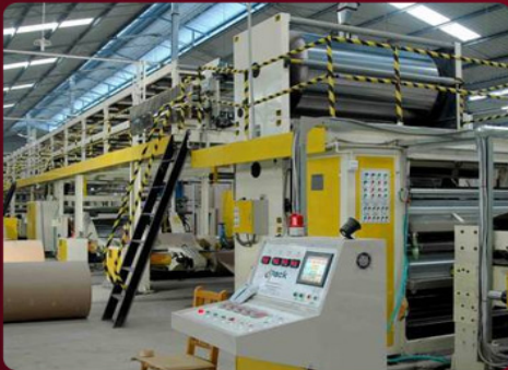
Automatic 3-5-7 Ply Corrugation Plant Installation