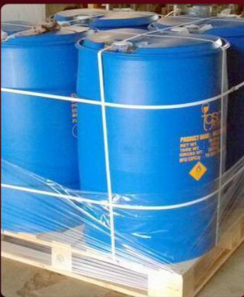
Ethanol 99.8% HS 2207-2000