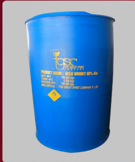
Bulk Single Malt Whisky