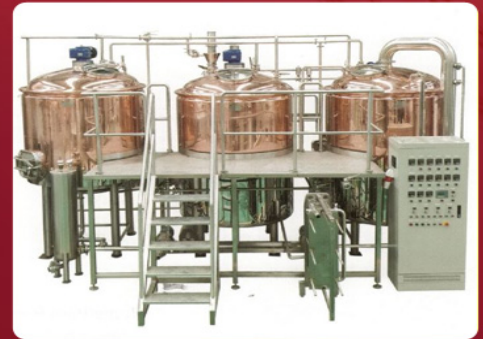
Microbrewery System Installation