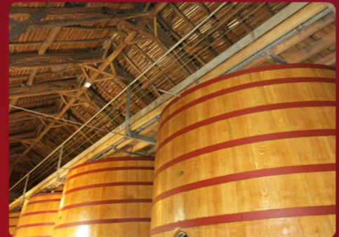
Rapid Spirits Maturation