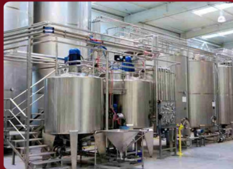
Liquor bottling Automation