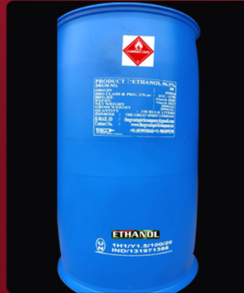
Ethanol 96% HS 2207-2000