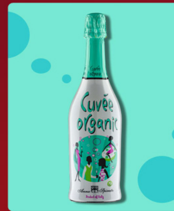
Organic Cuvée Wine