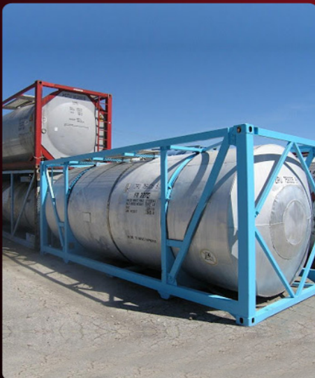
Single Grain Whiskey Tank