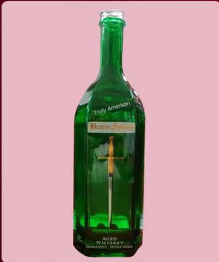
Brave Sword Single Malt Single Grain