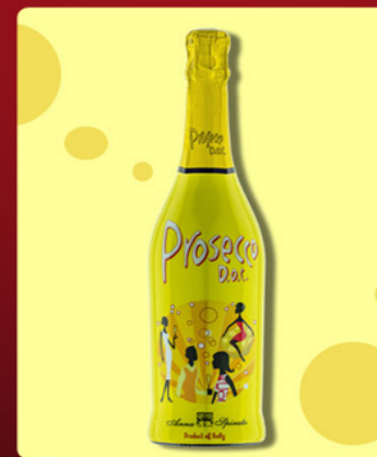
Prosecco Spumante Wine