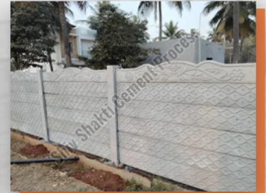
Prefab Compound Wall