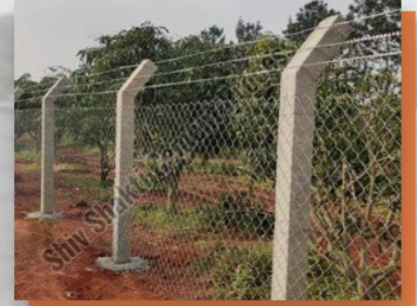
L Shape RCC Poles