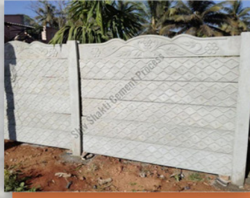
RCC Compound Wall