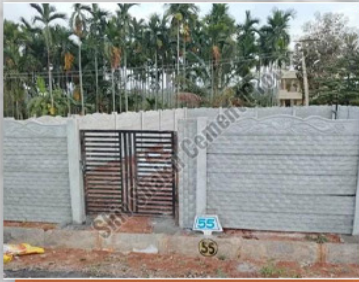
Designer Compound Wall