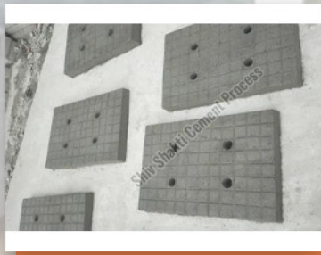
Grey Cement Slabs