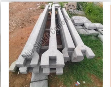
Y Shape RCC Poles