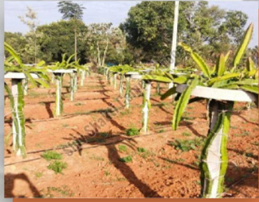
RCC Pearl Rings