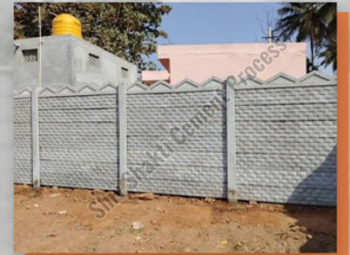
Concrete Compound Wall