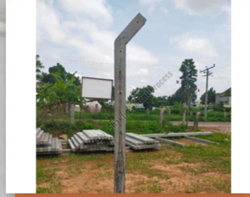
L Bent RCC Poles