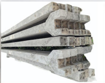
12 Foot RCC Poles