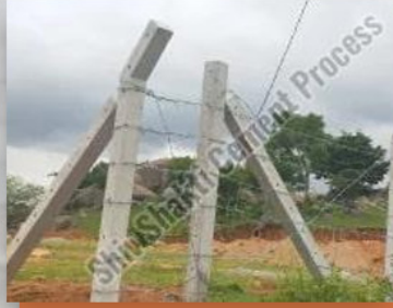
Grey RCC Poles