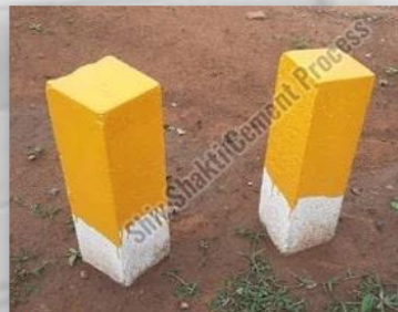
Marking RCC Poles