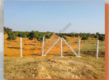
Wire Fencing RCC Poles