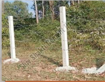
Straight RCC Poles