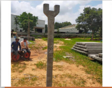
8 Foot RCC Poles