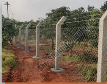
5 Foot RCC Poles