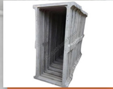
RCC Door Frames