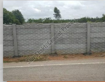
Precast Compound Wall