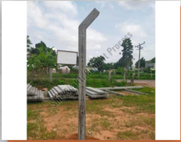
Square Base RCC Poles