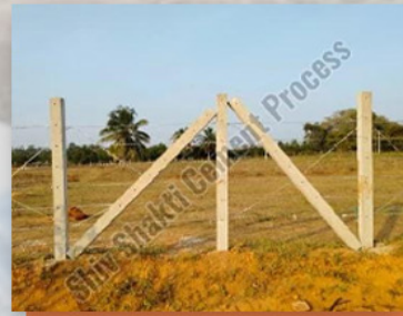
Concrete Fencing Poles