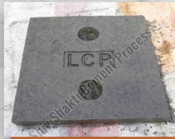
RCC Manhole Cover