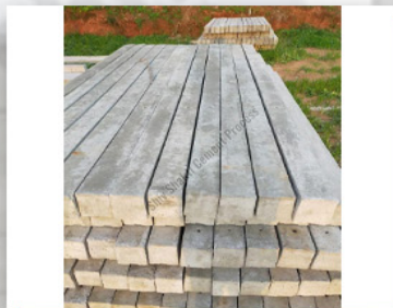
Boundary RCC Poles