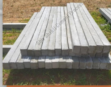
6 Foot RCC Poles