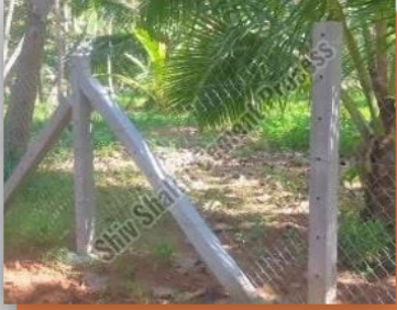
Garden RCC Poles