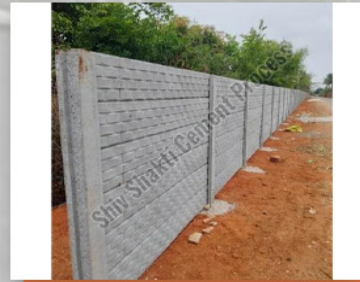
Checked Compound Wall