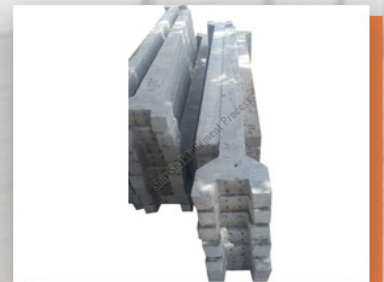
Standard RCC Poles