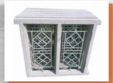
RCC Window Frames