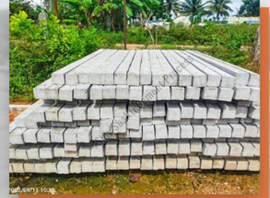
7 Foot RCC Poles