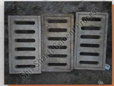
RCC Rectangular Cover