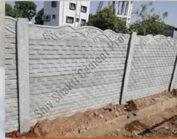
Folding Compound Wall