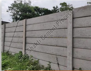
Panel Build Compound Wall