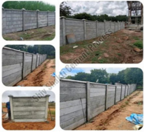
Boundary Compound Wall