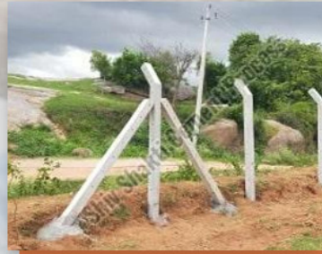
10 Foot RCC Poles