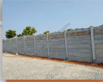
Readymade Compound Wall