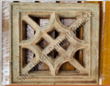
RCC Decorative Grill