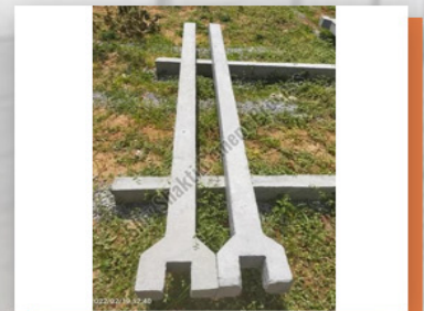
Construction RCC Poles