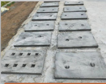
Flooring Cement Slabs