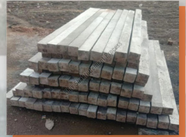
11 Foot RCC Poles