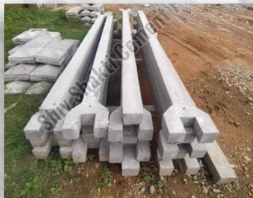
14 Foot RCC Poles