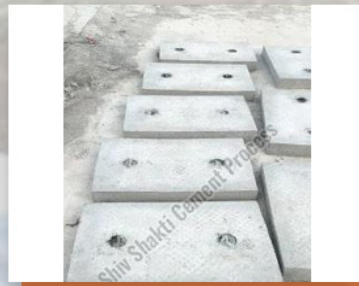
Rectangle Cement Slabs