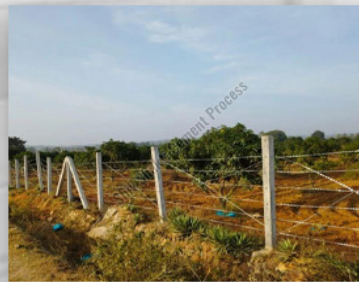
Agricultural RCC Poles