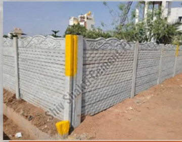
Fancy Compound Wall