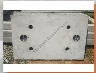
Solid Cement Slabs