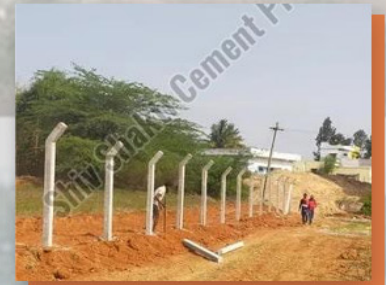
L Bent Cement Poles