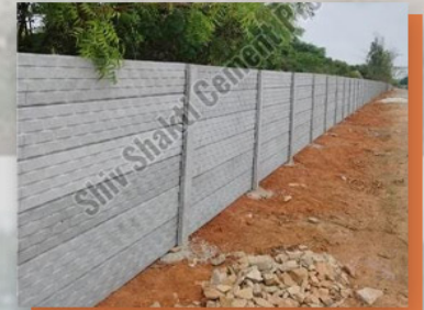
Grey Compound Wall