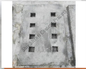
RCC Flooring Cover