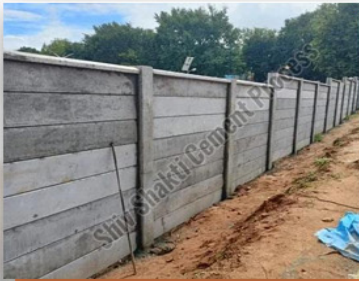
Modular Compound Wall