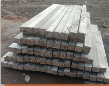
4 Foot RCC Poles