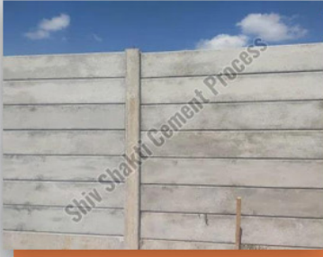
Prestressed Compound Wall