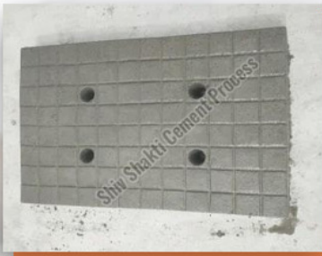
RCC Drain Cover