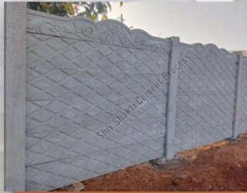
Carved Compound Wall