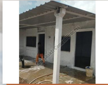
White RCC Poles