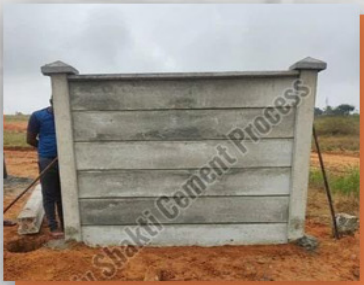
Square Base RCC Poles