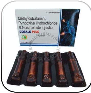
Cobalo Plus Injection