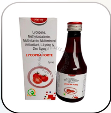
Lycopra Forte Syrup