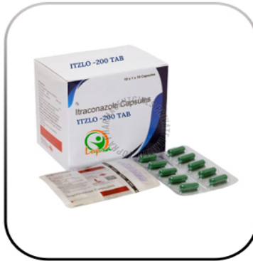
Itzlo -200 Tablet