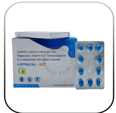
Lopracal K27 Capsule