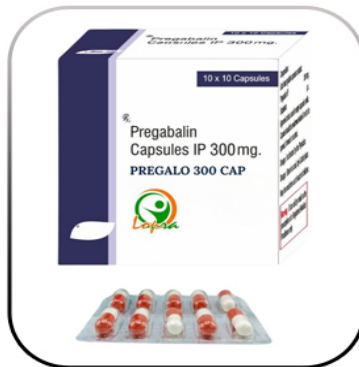
Pregalo 300 Capsules