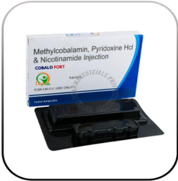
Cobalo Fort Injection