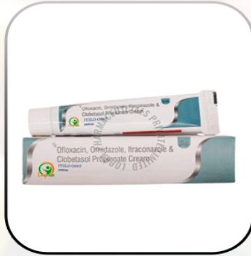
Itzlo Oint Cream