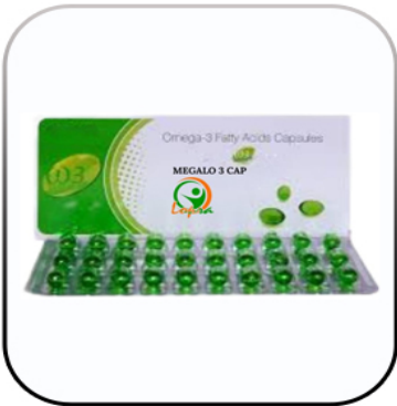
Megal 3 Capsules