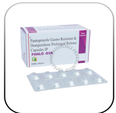
Panlo DSR Capsule