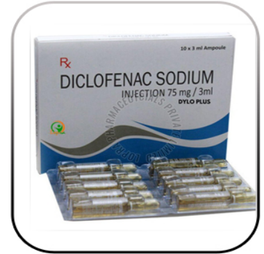
Dylo Plus Injection