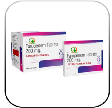
Loropenem 200 Tablets