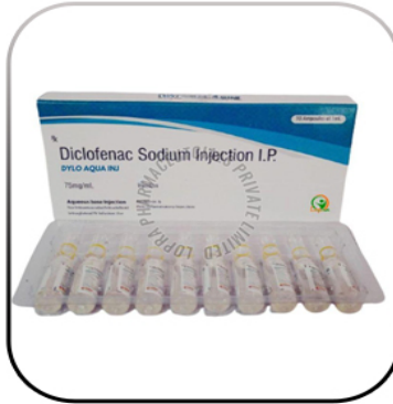
DYLO Aqua Injection