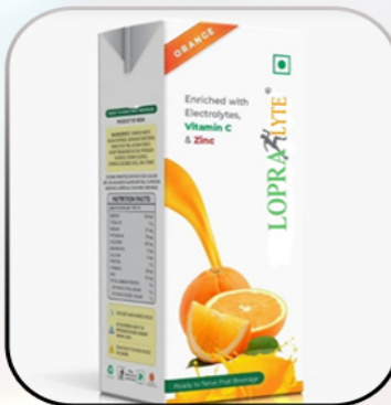
Lopralyte Ors Liquid