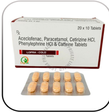
Lopra - Cold Tablet