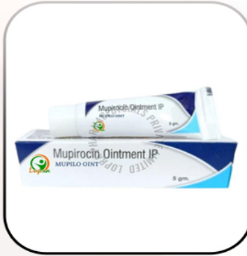
Mupilo Oint Cream