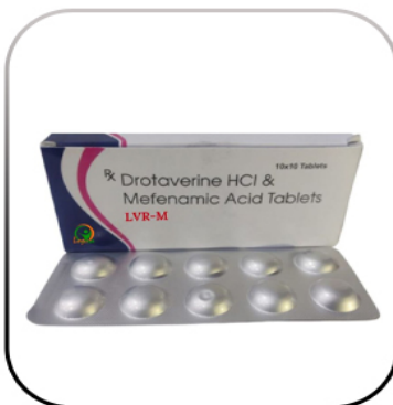
Drotaverine HCl & Mefenamic Acid Tablets LVR-M