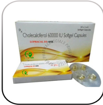
Lopracal D3-60k Capsule