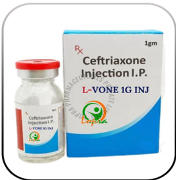
L-Vone 1g Injection