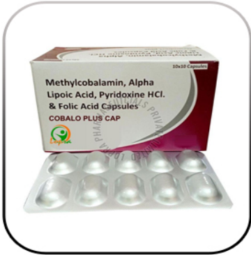
Cobalo Plus Capsule