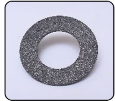
K Series Electromagnetic Clutch Ring