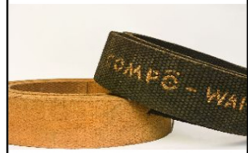
BA Brake Liners