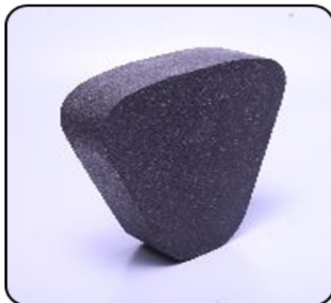
G Series Trapezium Brake Blocks