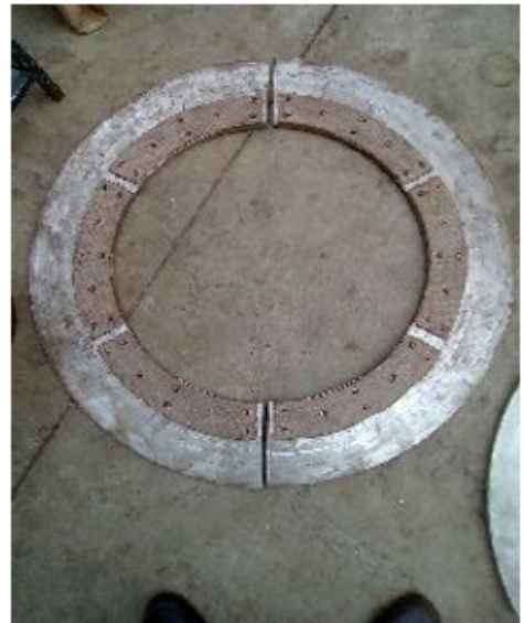
Brake Relining Services