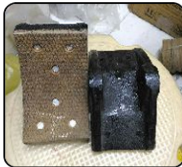
Brake Shoe Liners