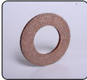
WM 8 Electromagnetic Clutch Ring