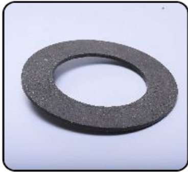
PM 6 Electromagnetic Clutch Ring