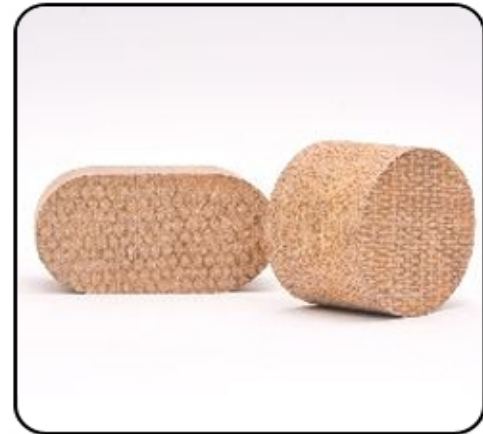
WM 8 Friction Blocks