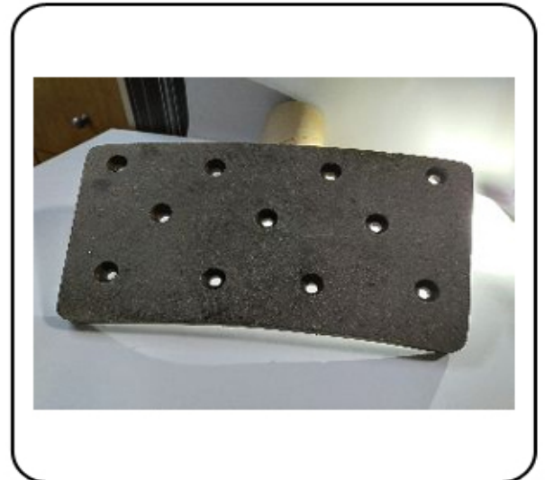
PM 6 Asbestos Friction Segment Brakes