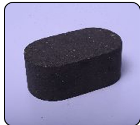
G Series Russian Brake Blocks