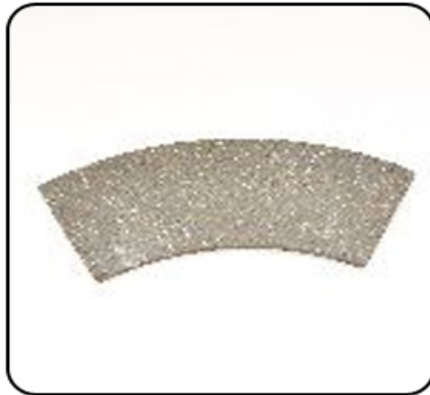
PM 6 Friction Segment Brakes