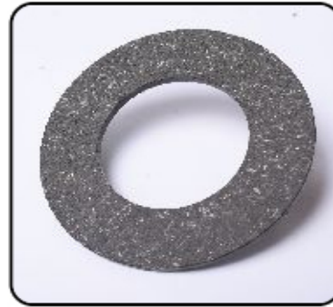
G Series Electromagnetic Clutch Ring