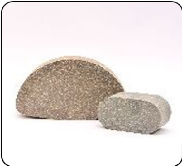
PM 6 Asbestos Friction Blocks