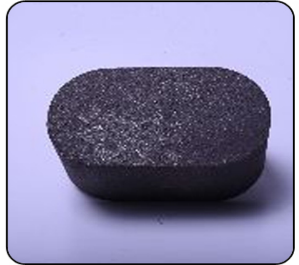
K Series Non Asbestos Friction Liners