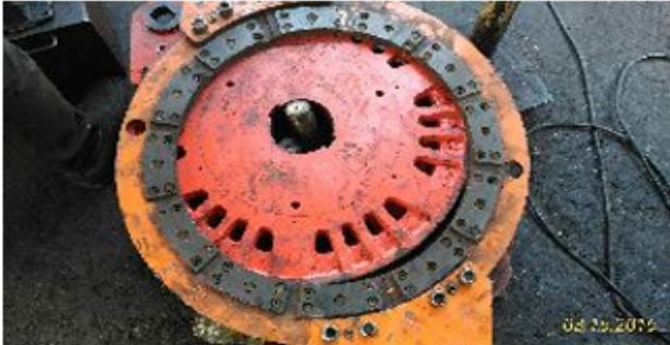
Clutch Relining Services