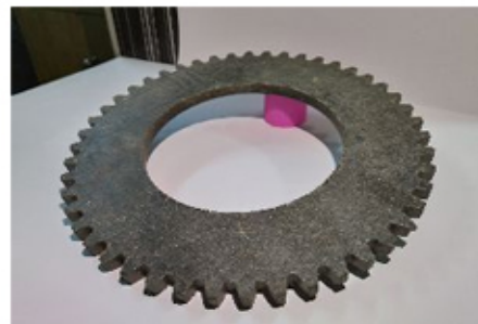
PM 6 Gear Ring