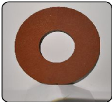
Vulcanized Red Fiber Disc