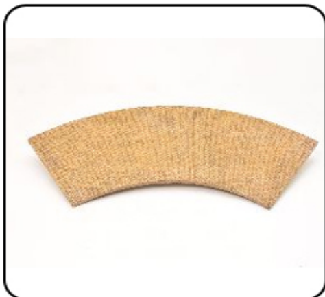
WM 8 Friction Segment Brakes