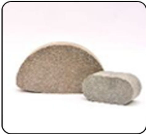
PM 6 Friction Blocks