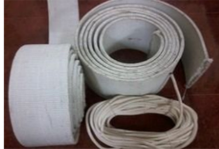
Drop Stamp Hammer Belt