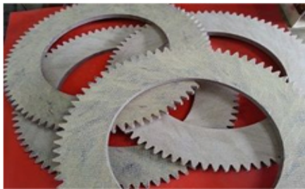
Friction Gear Disc