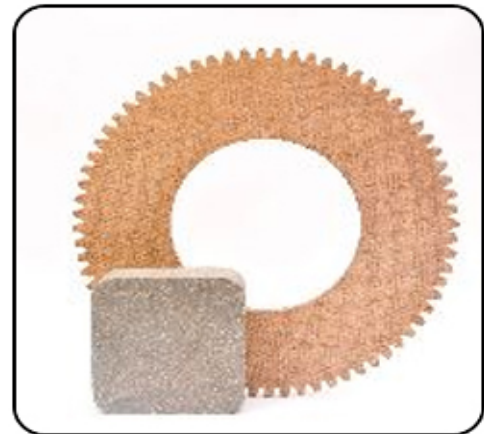
WM 8 Gear Ring