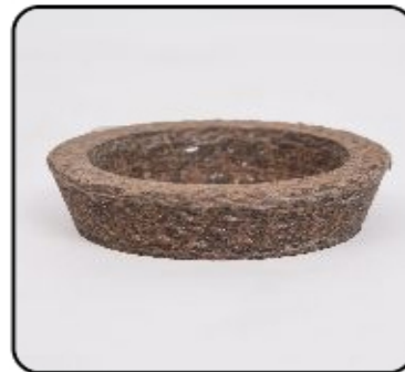
Hoist Brake Liner