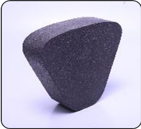
G Series Non Asbestos Friction Liners