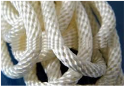
Nylon Pull Cord