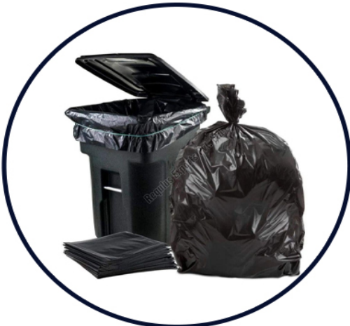
Disposable Garbage Bag