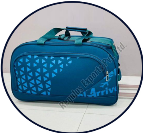
Duffle Trolley Bag