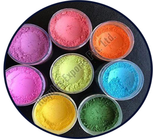
Multicolor Pigment Powder