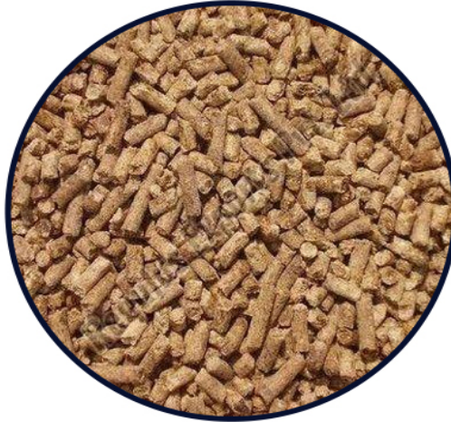
Adult Cattle Feed Supplement