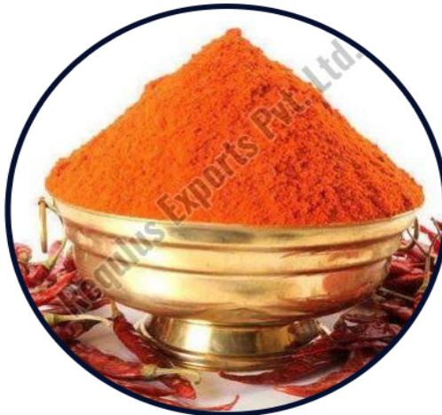
Dry Red Chilli Powder