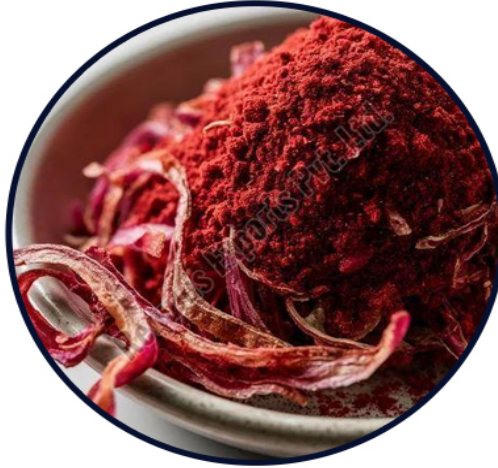
Dehydrated Red Onion Powder