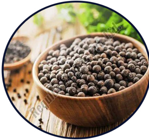
Black Pepper Seeds