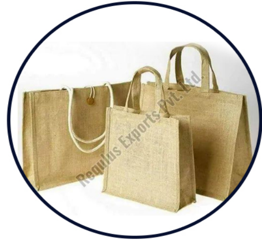
Plain Fancy Jute Bag