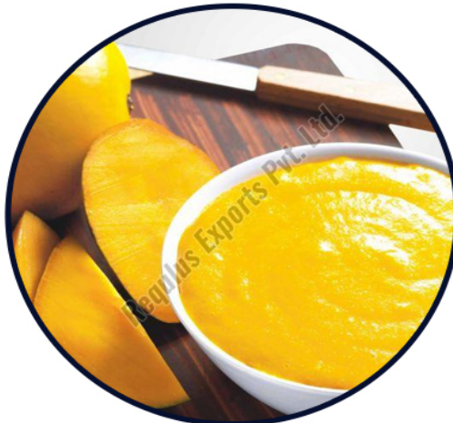
Fresh Mango Pulp