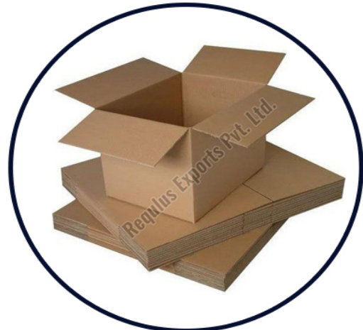
Plain Corrugated Box