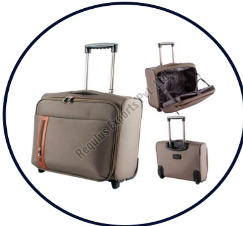
Pilot Trolley Bag