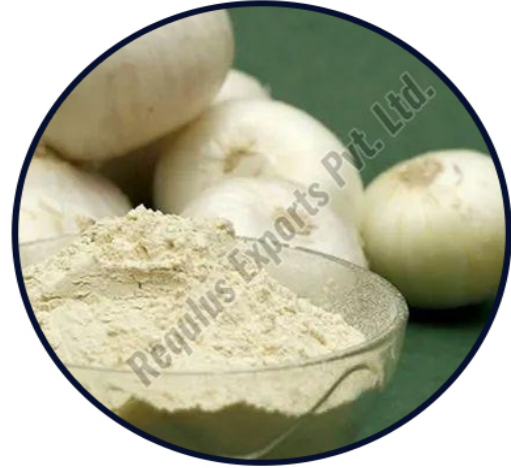
Dehydrated White Onion Powder