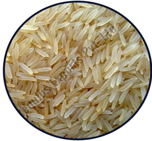
1401 Basmati Rice