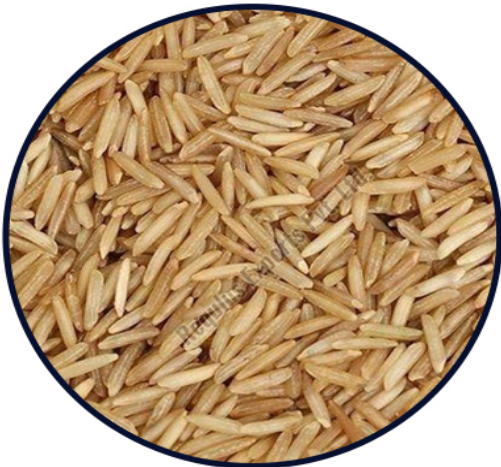
Brown Basmati Rice