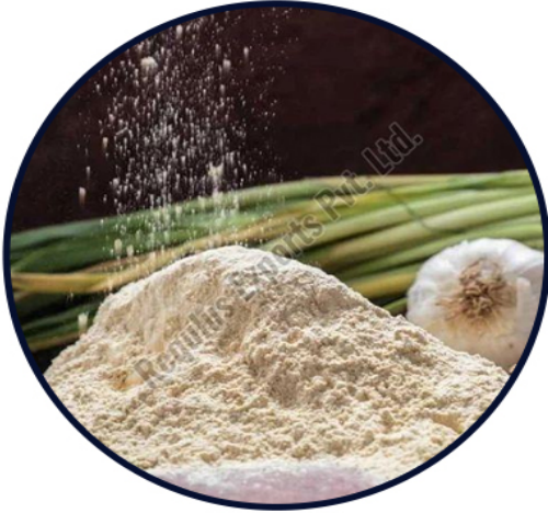
Dehydrated Garlic Powder