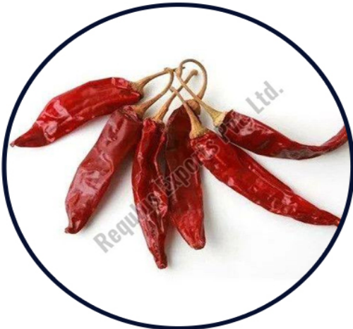
Dried Red Chilli