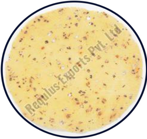
Moong Dal Papad