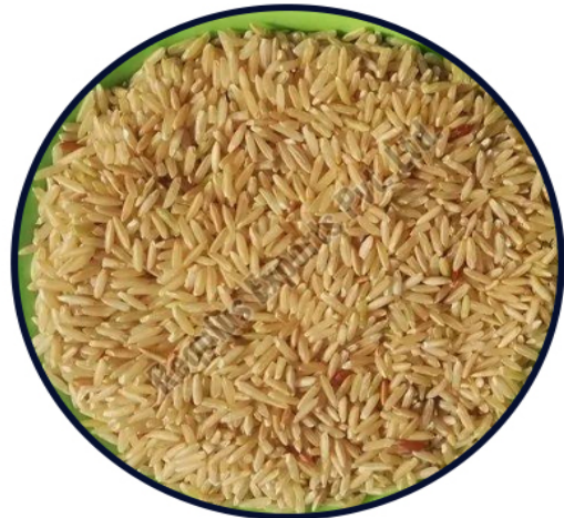
Brown Non Basmati Rice