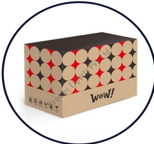
Printed Corrugated Box