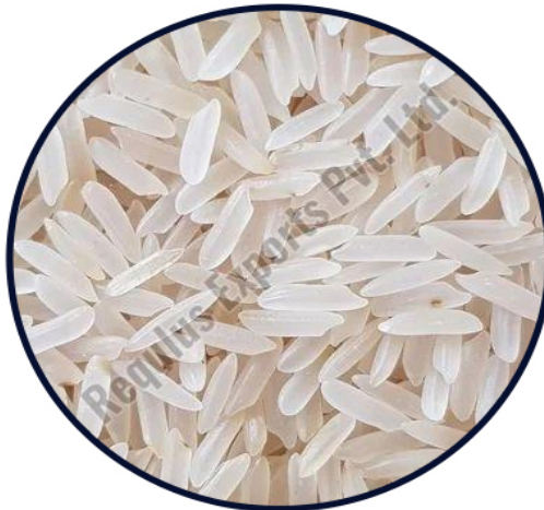
1121 Non Basmati Rice