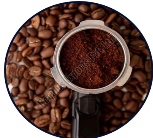
Roasted Coffee Powder