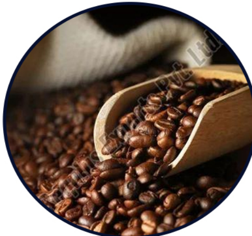
Roasted Coffee Beans