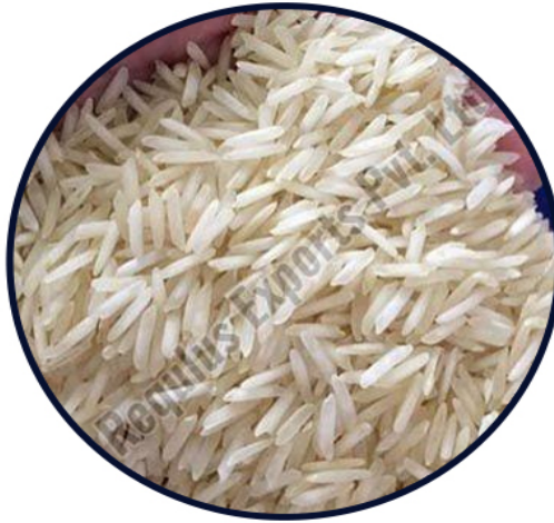
1121 Basmati Rice