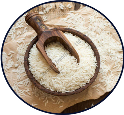
IR 64 Non Basmati Rice