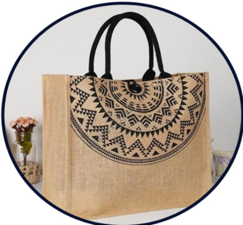
Printed Fancy Jute Bag