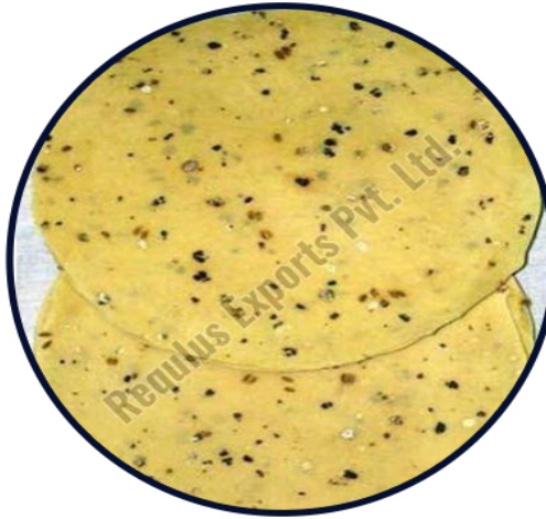
Urad Dal Papad