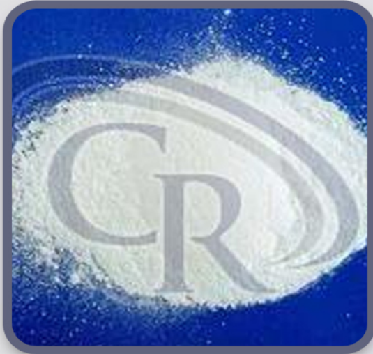
Esomeprazole Magnesium Trihydrate IP Powder