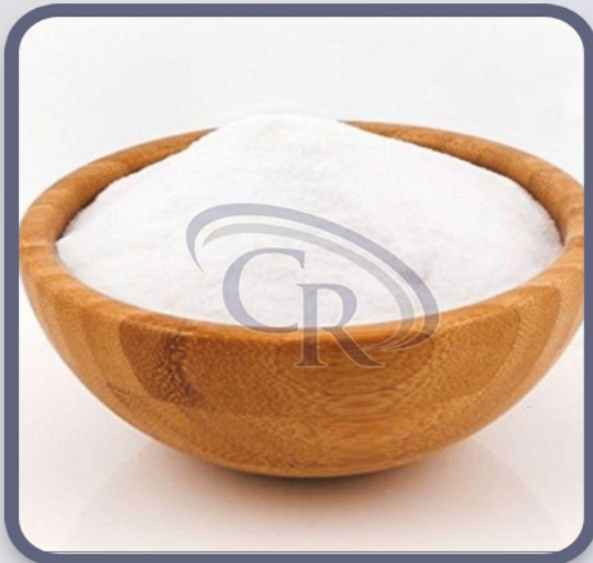
Citicoline Sodium Powder