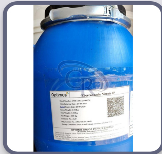
Eberconazole Nitrate Powder