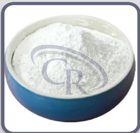
Mebeverine Hydrochloride BP Powder