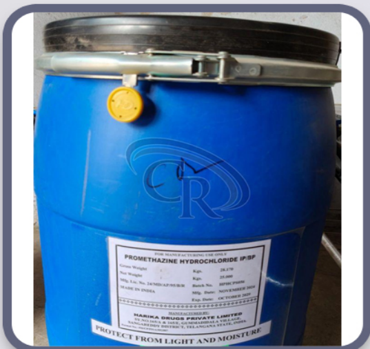
Promethazine Hydrochloride Powder