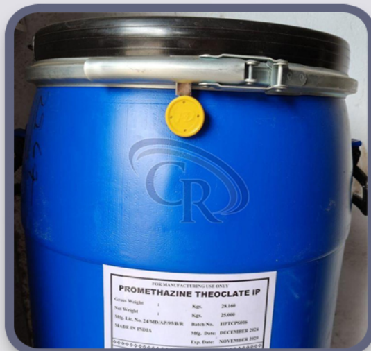
Promethazine Theoclate Powder