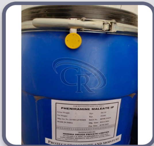
Pheniramine Maleate IP Powder