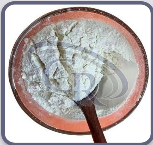
Loperamide Hydrochloride Powder