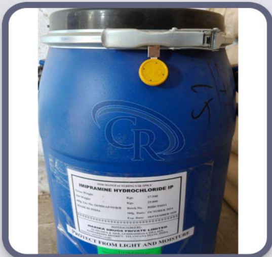
Imipramine Hydrochloride Powder