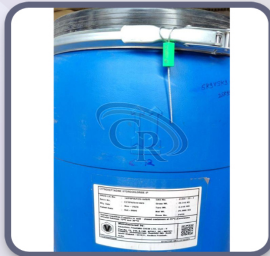
Cyproheptadine Hydrochloride Powder