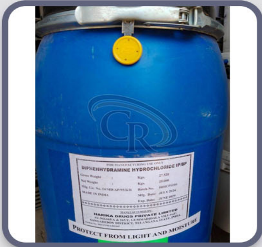
Diphenhydramine Hydrochloride Powder