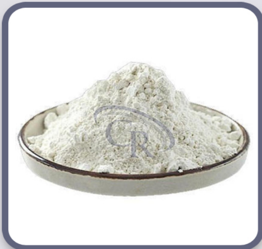
Diclofenac Potassium BP Powder