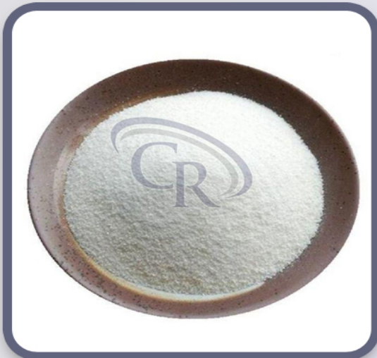
Itopride Hydrochloride Powder