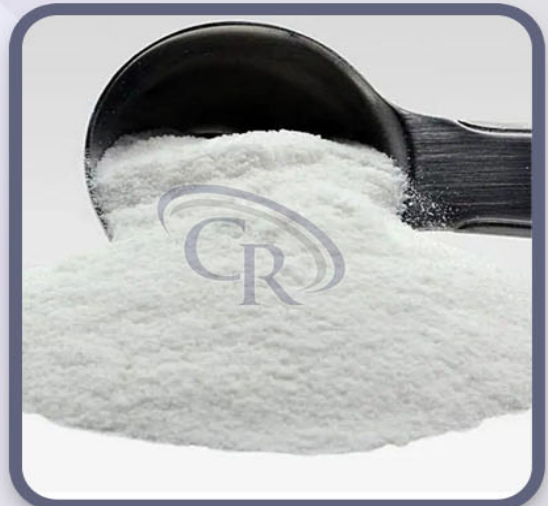
Doxylamine Succinate Powder