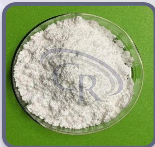
Niacinamide IP Powder