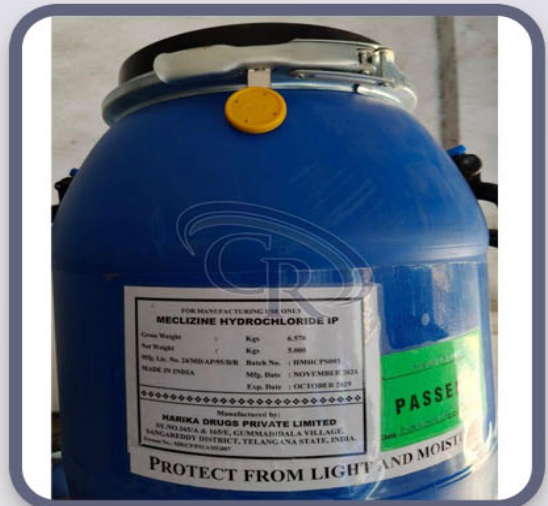
Meclizine Hydrochloride Powder