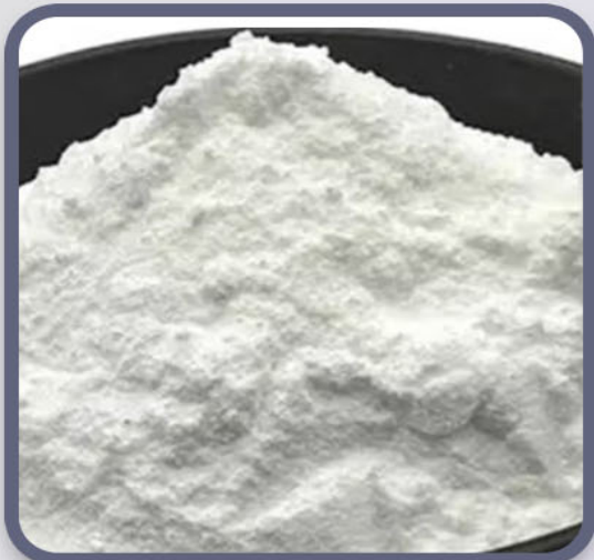
Promethazine Hydrochloride Powder