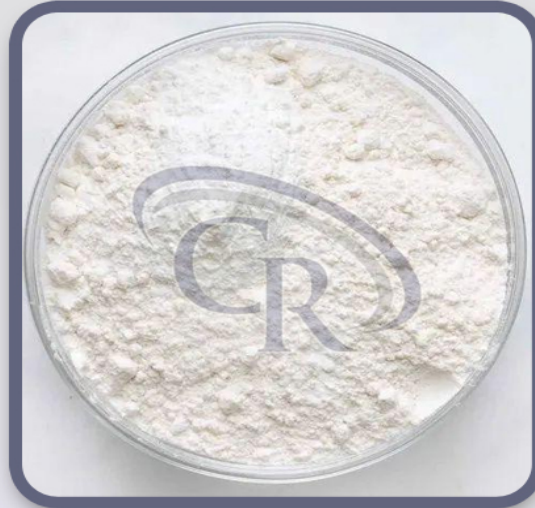
Ciprofloxacin Hydrochloride Powder