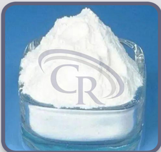
Orphenadrine Citrate Powder