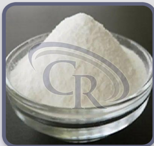
Mefenamic Acid Powder