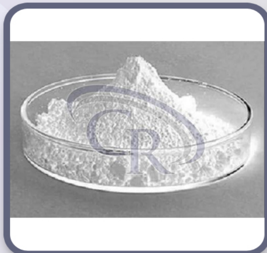
Prochlorperazine Mesylate Powder