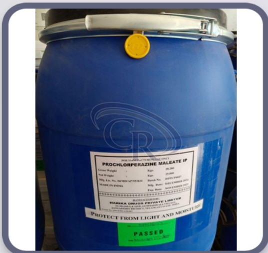
Prochlorperazine Maleate Powder