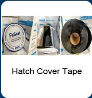
Hatch Cover Tape