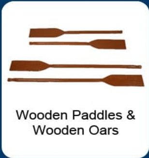
Wooden Paddles & Wooden Oars