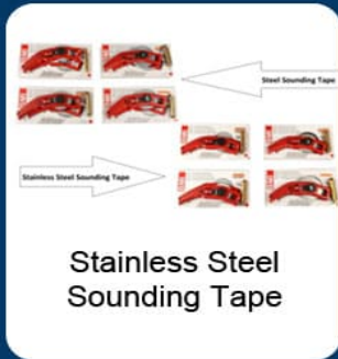
Stainless Steel Sounding Tape