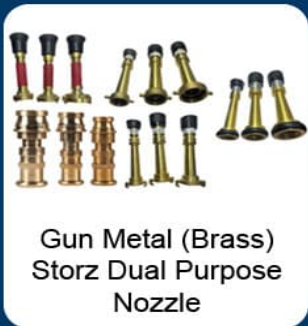
Gun Metal (Brass) Storz Dual Purpose Nozzle