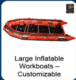
Large Inflatable Workboats - Customizable