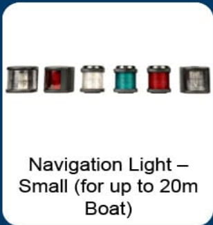
Navigation Light - Small (for up to 20m Boat)