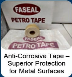
Anti-Corrosive Tape - Superior Protection for Metal Surfaces