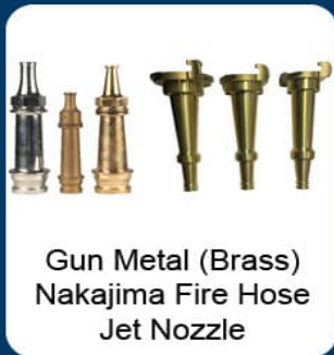
Gun Metal (Brass) Nakajima Fire Hose Jet Nozzle