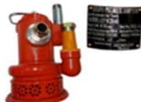
Pneumatic Sump Pump