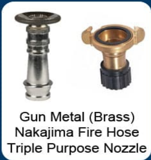
Gun Metal (Brass) Nakajima Fire Hose Triple Purpose Nozzle