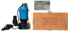
Electric Sump Pump WQ10-15 (220V)