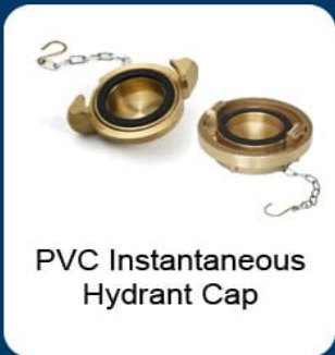
PVC Instantaneous Hydrant Cap