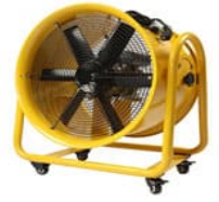
Electric Ventilation Blower / Fan 500MM (20 Inch)