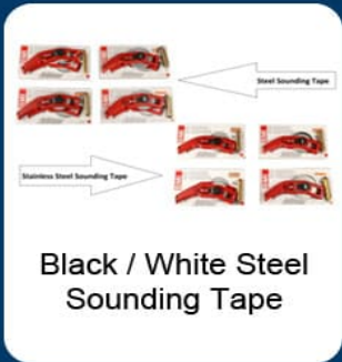
Black / White Steel Sounding Tape