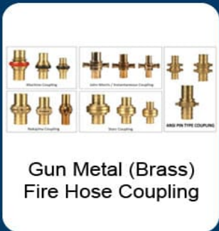
Gun Metal (Brass) Fire Hose Coupling