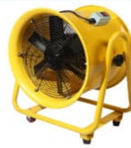
Electric Ventilation Blower / Fan 400MM (16 Inch)