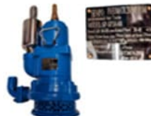
Pneumatic Sump Pump