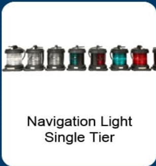
Navigation Light Single Tier