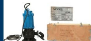
Electric Sump Pump WQ15-30 (220V)