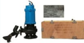
Electric Sump Pump WQ10-20 (220V)