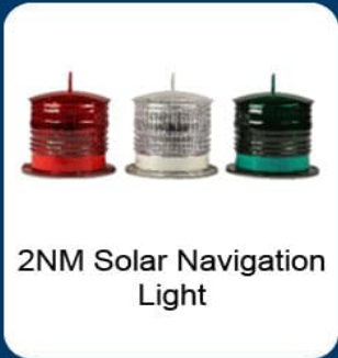
2NM Solar Navigation Light