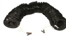
Antistatic Ducting for Explosion-Proof Blower