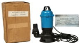
Electric Sump Pump WQ10-15 (110V)