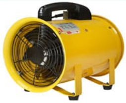
Electric Ventilation Blower / Fan 200MM (8 Inch)