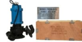
Electric Sump Pump WQ10-20 (220V)