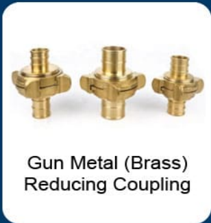
Gun Metal (Brass) Reducing Coupling