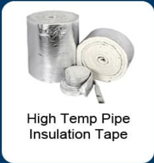
High Temp Pipe Insulation Tape