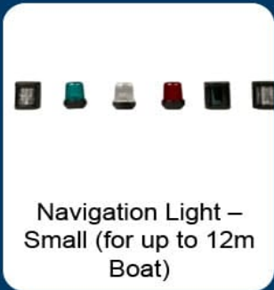
Navigation Light - Small (for up to 12m Boat)