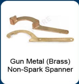
Gun Metal (Brass) Non-Spark Spanner