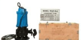
Electric Sump Pump WQ15-30 (440V)