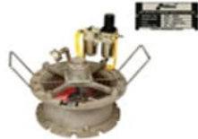
Air-Driven Turbine Fan