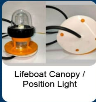
Lifeboat Canopy / Position Light