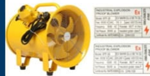
Explosion-Proof Blower / Fan 300MM (12 Inch)