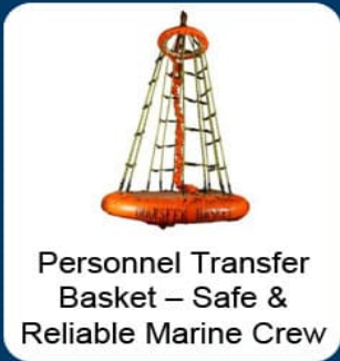
Personnel Transfer Basket - Safe & Reliable Marine Crew