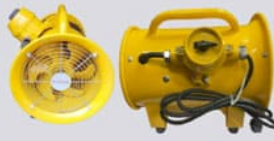
Explosion-Proof Blower / Fan 200MM (8 Inch)