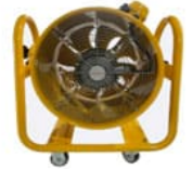
Explosion-Proof Blower / Fan 400MM (16 Inch)