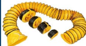
Duct Hose for Ventilation Fan