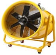
Electric Ventilation Blower / Fan 600MM (24 Inch)