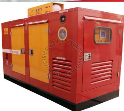
MP 125 KVA THREE PHASE SILENT GENERATOR