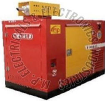
MP 35 KVA THREE PHASE SILENT GENERATOR