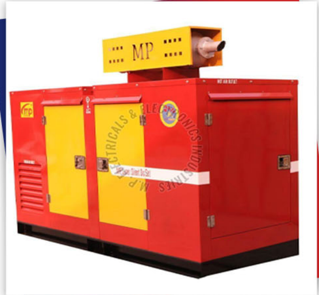
MP 62.5 KVA THREE PHASE SILENT GENERATOR