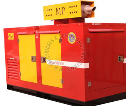
MP 40 KVA THREE PHASE SILENT GENERATOR