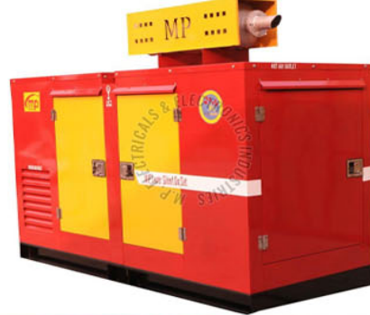
MP 8 KVA SINGLE PHASE SILENT GENERATOR