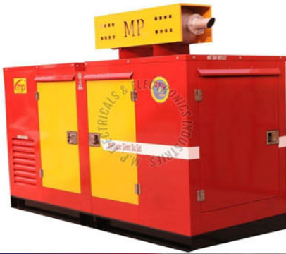
MP 10 KVA SINGLE PHASE SILENT GENERATOR