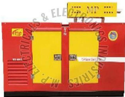
MP 20 KVA THREE PHASE DOUBLE CYLINDER SILENT GENERATOR