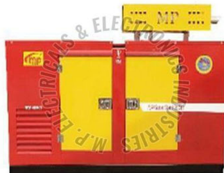
MP 100 KVA THREE PHASE SILENT GENERATOR