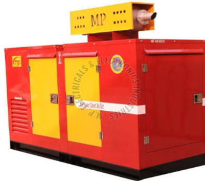
MP 30 KVA THREE PHASE SILENT GENERATOR