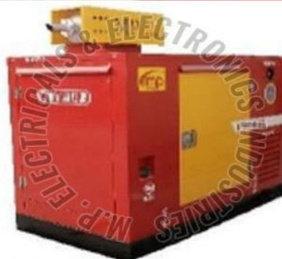
MP 35 KVA SINGLE PHASE SILENT GENERATOR