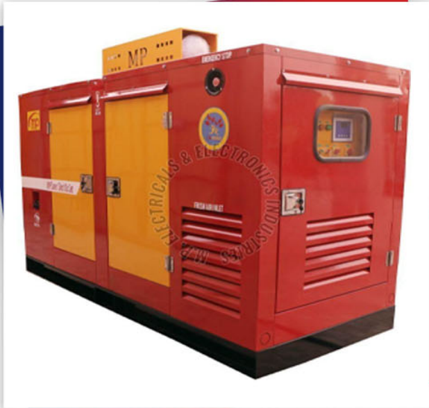
MP 82.5 KVA THREE PHASE SILENT GENERATOR