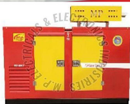
MP 140 KVA THREE PHASE SILENT GENERATOR