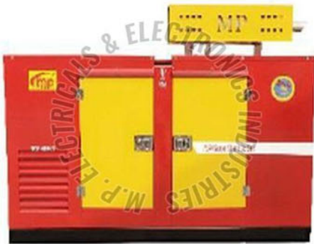
MP 10 KVA THREE PHASE SILENT GENERATOR