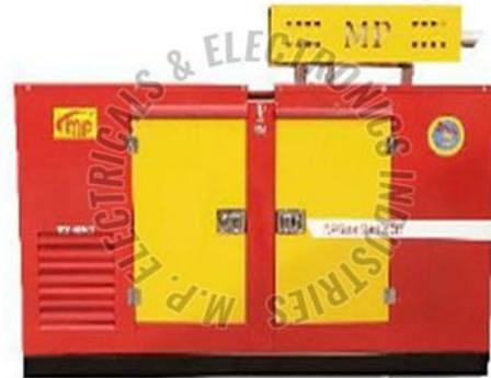
MP 50 KVA THREE PHASE SILENT GENERATOR