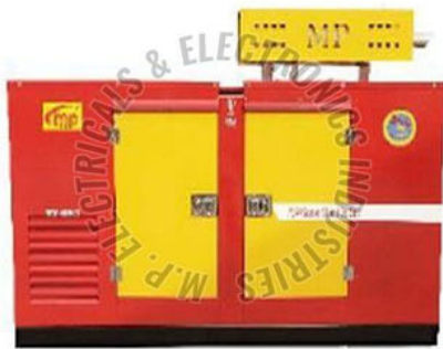
MP 45 KVA THREE PHASE SILENT GENERATOR