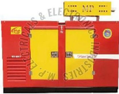
MP 40 KVA SINGLE PHASE SILENT GENERATOR