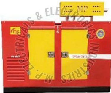
MP 20 KVA SINGLE PHASE SILENT GENERATOR