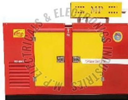
MP 20 KVA THREE PHASE TRIPLE CYLINDER SILENT GENERATOR