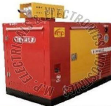
MP 25 KVA THREE PHASE SILENT GENERATOR