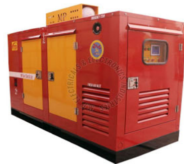
MP 25 KVA SINGLE PHASE SILENT GENERATOR