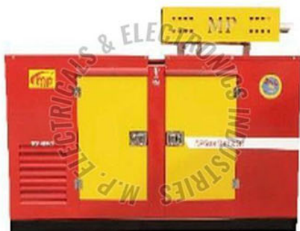
MP 15 KVA THREE PHASE SILENT GENERATOR