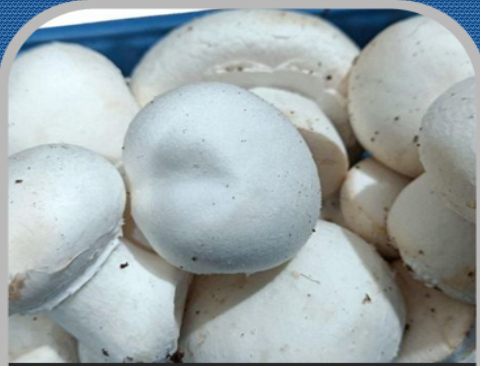
Fresh Button Mushroom