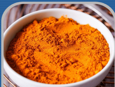
Organic Turmeric Powder