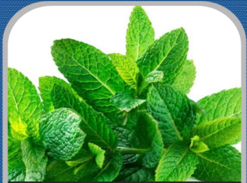
Fresh Mint Leaves