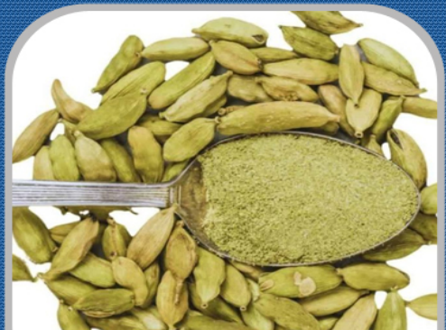
Green Cardamom Powder