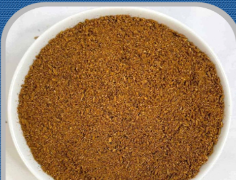
Brown Cumin Seeds Powder