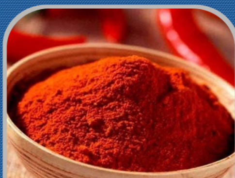
Red Chilli Powder