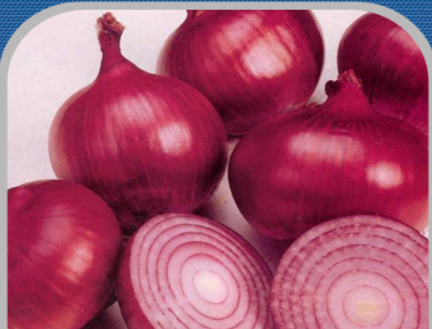
Fresh Red Onion