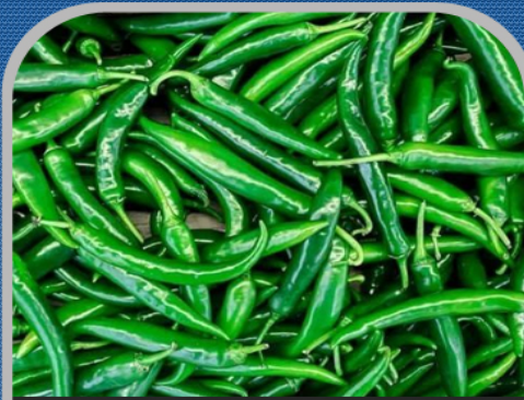
Fresh Green Chilli